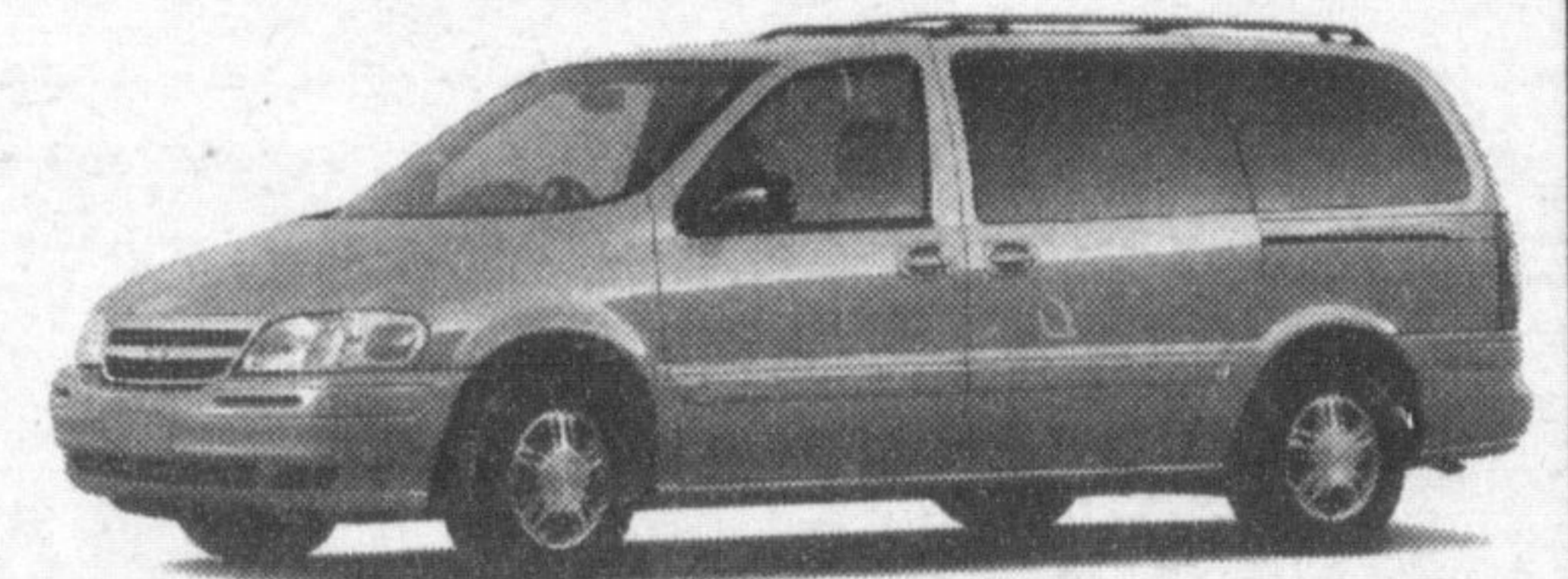
2004 Venture Vans