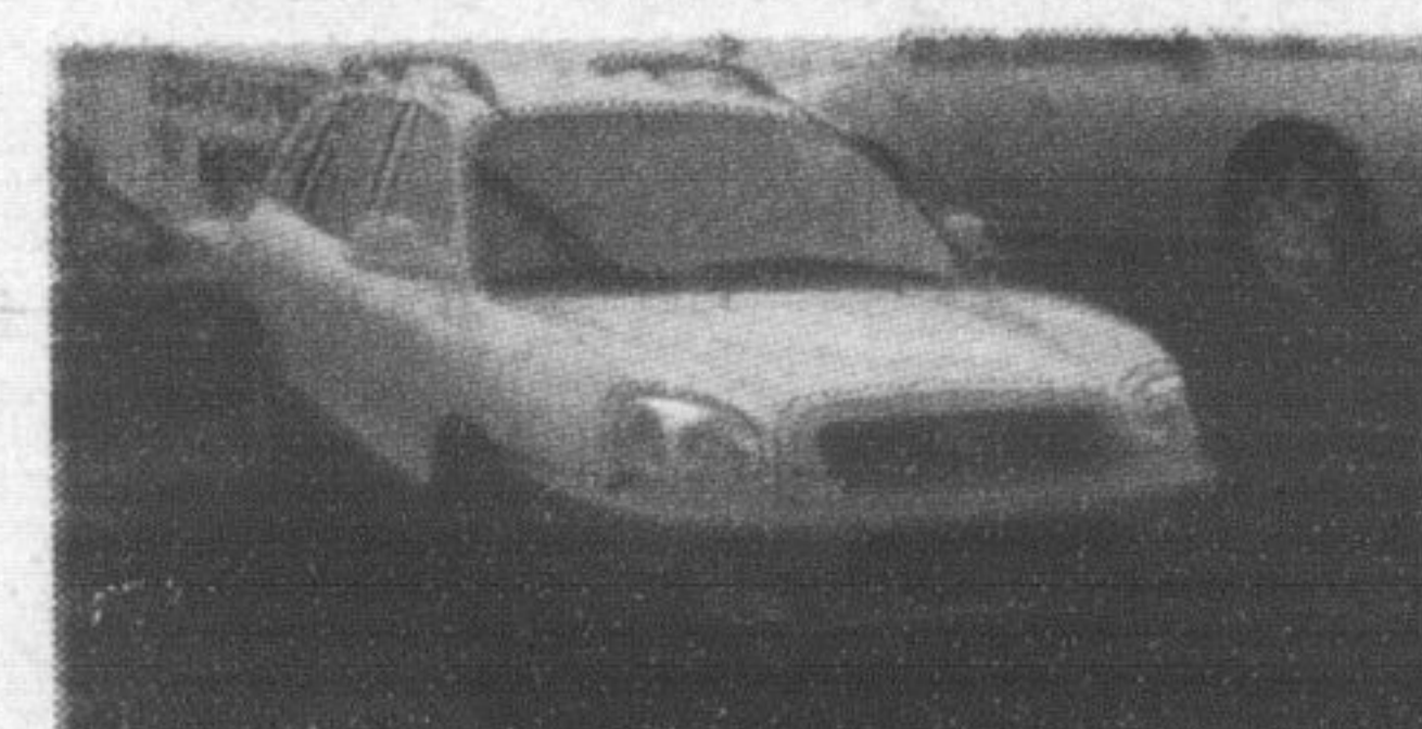
2001 SANTA FE GLS