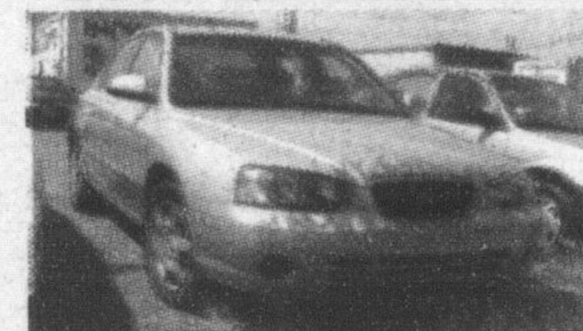
*2003 ELANTRA VE

5 spd. or auto, cassette, 20 to choose from. #U3632 76K's