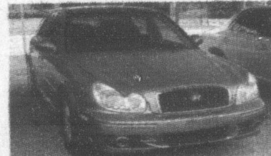
'02 SONATA GL

L, GL, GS, GSI Models Available 1996-2002 Models from $4495-$11,995