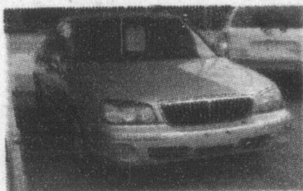
2001 XG 300

5 spd., air, pg, sunroof, alloy wheels and CD. #U3696