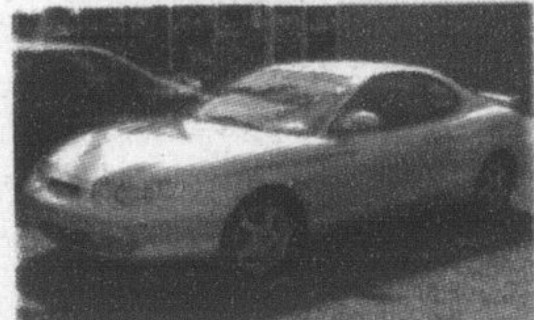
2000 TIBURON SE