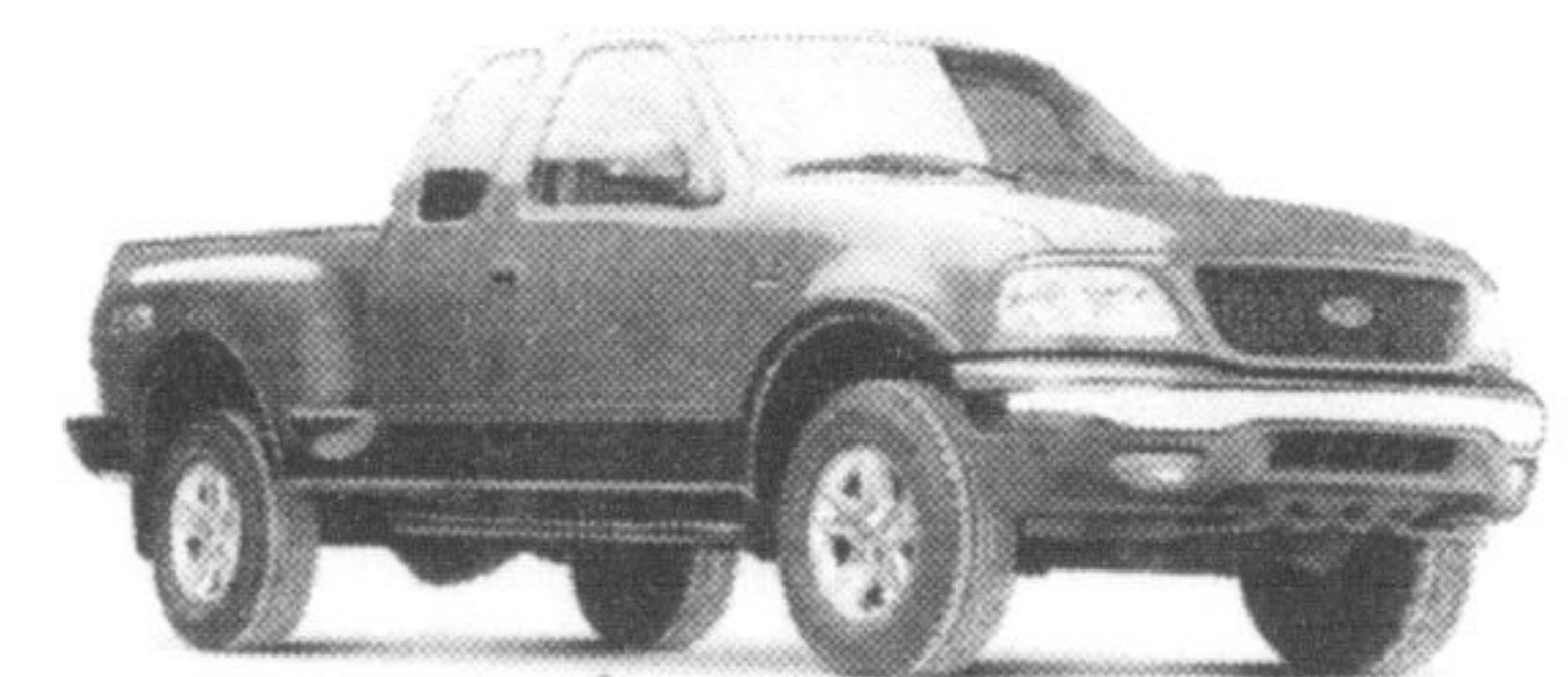
2003 Ford F-150