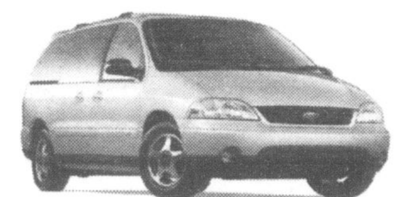
2003 Ford Windstar