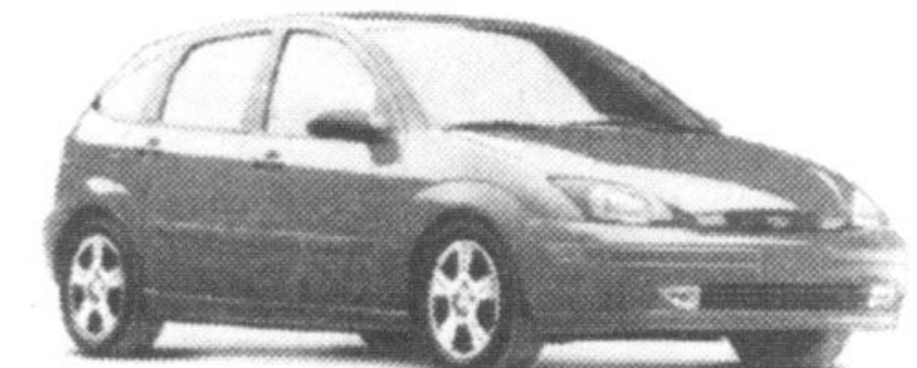
2003 Ford Focus

OR Get savings of up to $6,000 on Cash Purchase Savings range from $1,000 to $6,000 on new in-stock 2003 Ford Focus, Mustang, Taurus, Marauder, Grand Marquis, Ranger, Explorer, Escape, Windstar, Expedition, Excursion, F-150 including SuperCrew.