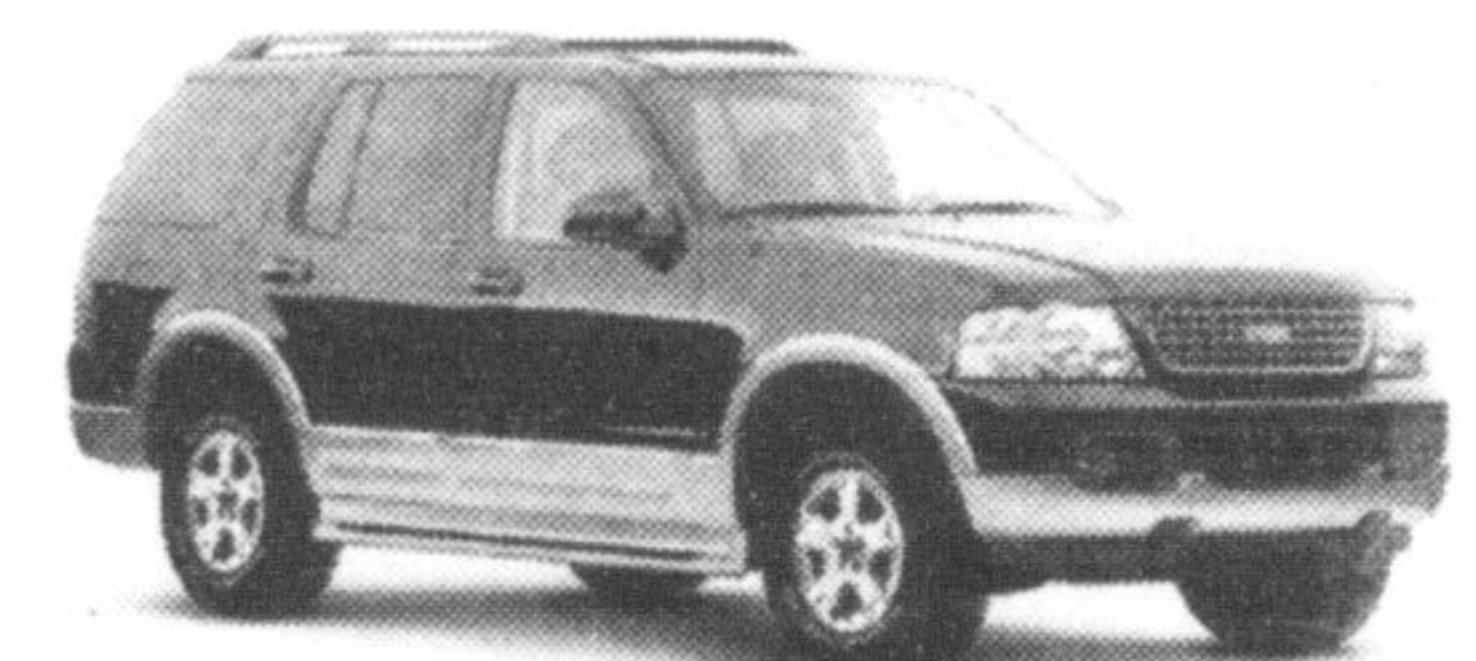
2003 Ford Explorer