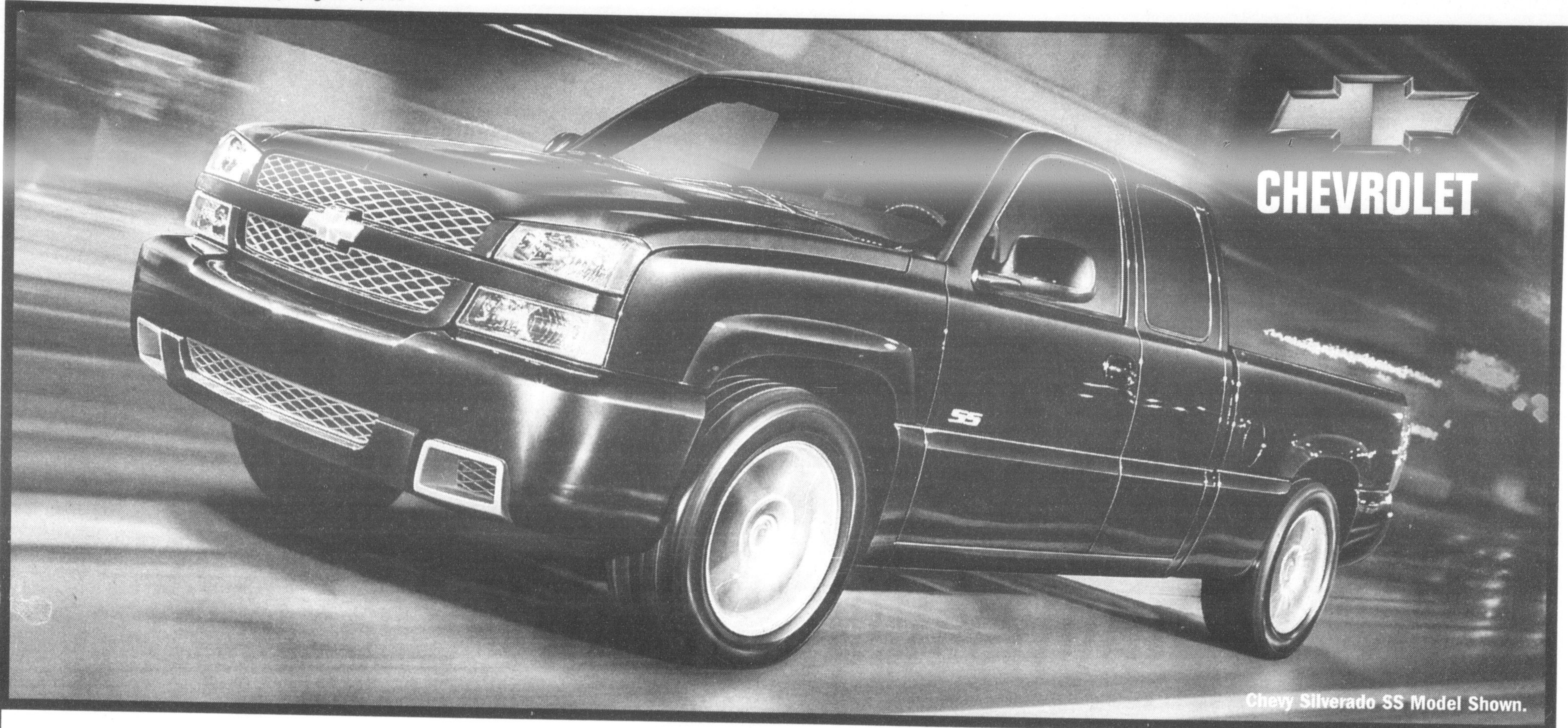
Chevy Silverado SS Model Shown.