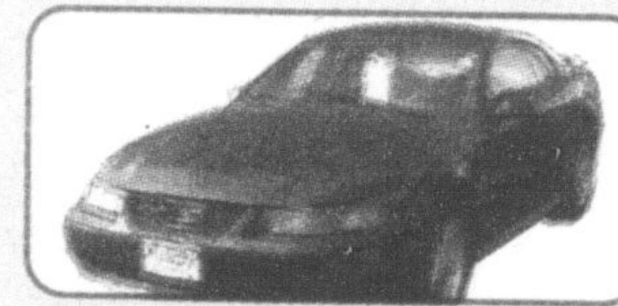
2003 Ford Mustang CASH PRICE '$22,996'

Plus $1,000 Cash Back On Selected Models