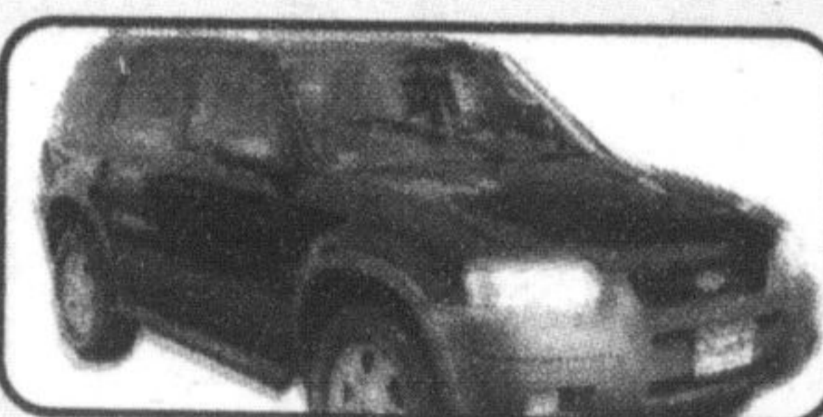
2003 Escape XLT CASH PRICE '$28,999'

Top of the line... dual power sliding doors, fam. security pkg, heated seats, advance trac, fam. entertainment system, leather interior. W3070