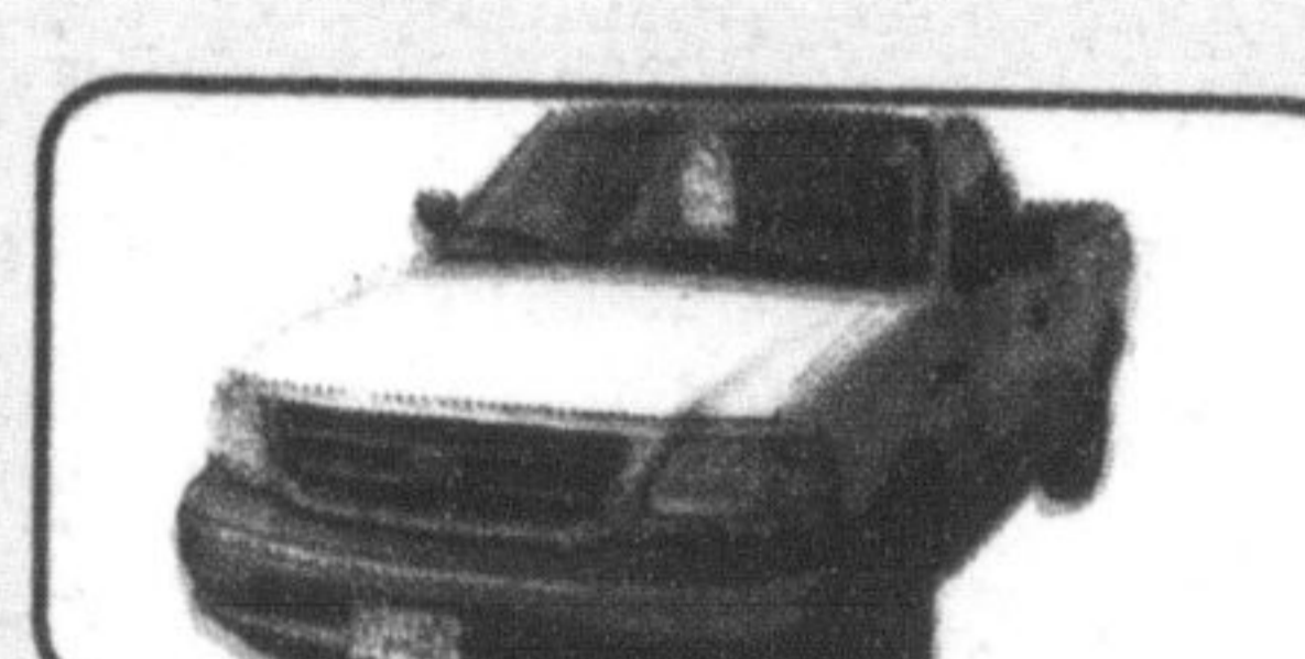
2003 F150 Reg Cab XLS Pkg CASH PRICE '$25,246'

5.4 L Triton V8, climate control, class IV trailer tow, pwr moonroof, safety canopy. P3006