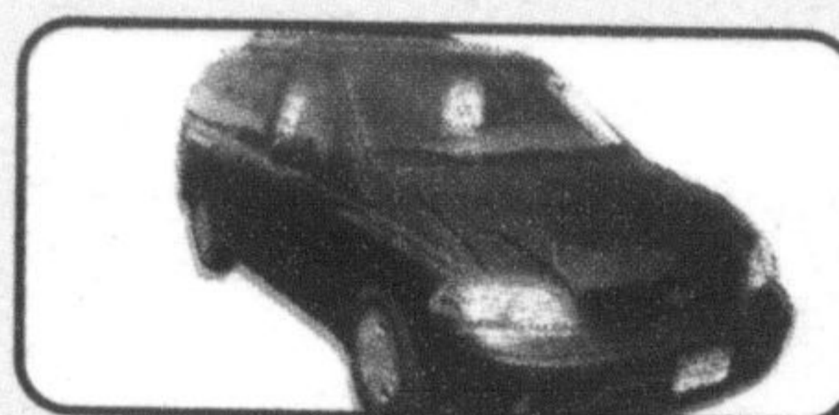
2003 Windstar LX Utility CASH PRICE '$24,163'

2.0L DOHC 16V Zetec engine, speed control, anti-lock brakes, Canadian winter pkg, power moonroof, leather low back bucket seats A3110