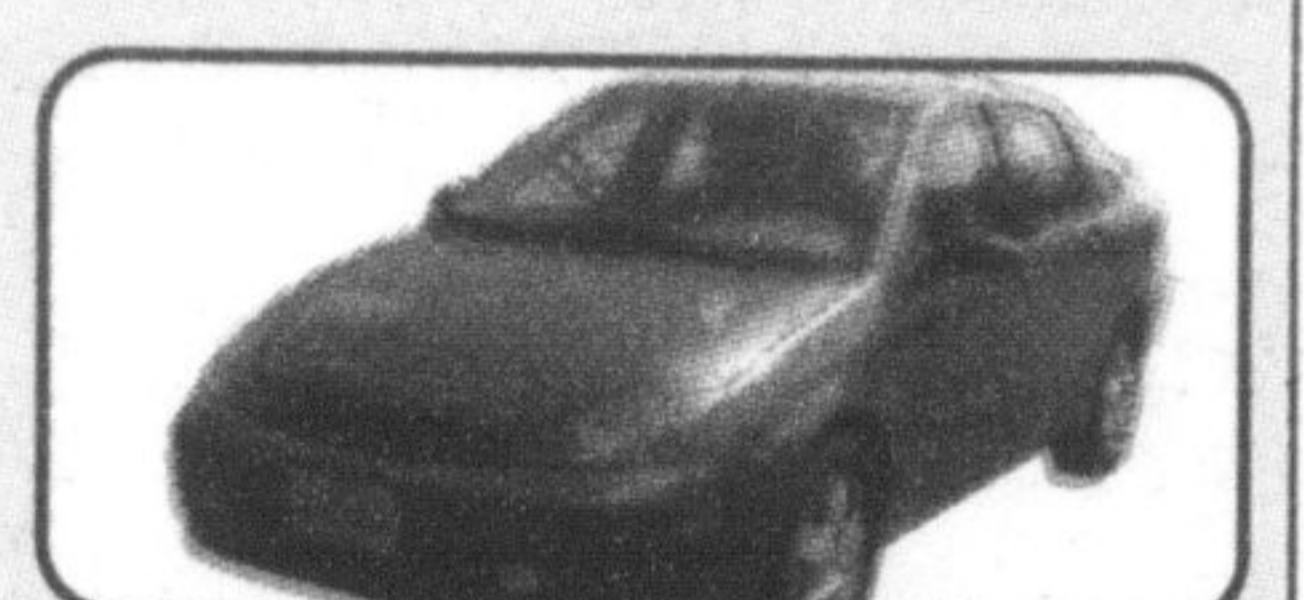
2003 Focus ZTS CASH PRICE '$21,169'

2.0L DOHC 16V Zetec engine, speed control, anti-lock brakes, Canadian winter pkg, fog lamps, power moonroof, CD/MP3 player, leather bucket seats. A3100