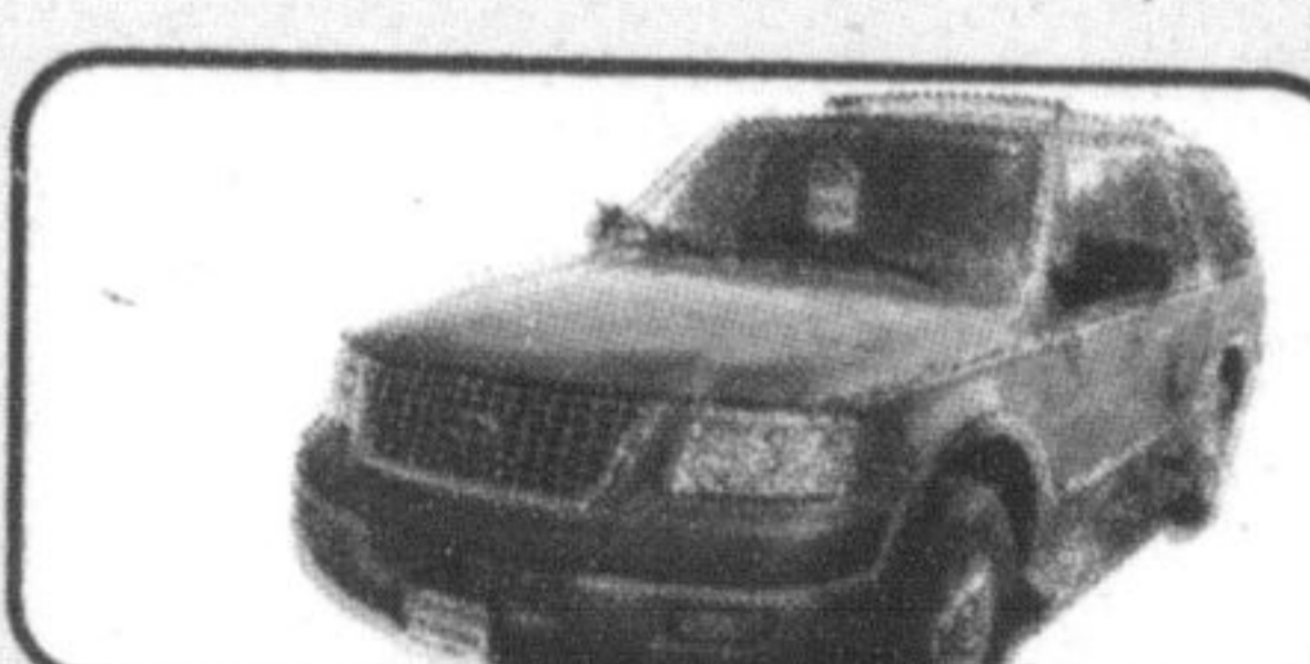
2003 Expedition Eddie Bauer CASH PRICE '$48,602'

3.0L V6, ABS, fog lamps, power group, speed control. S3051