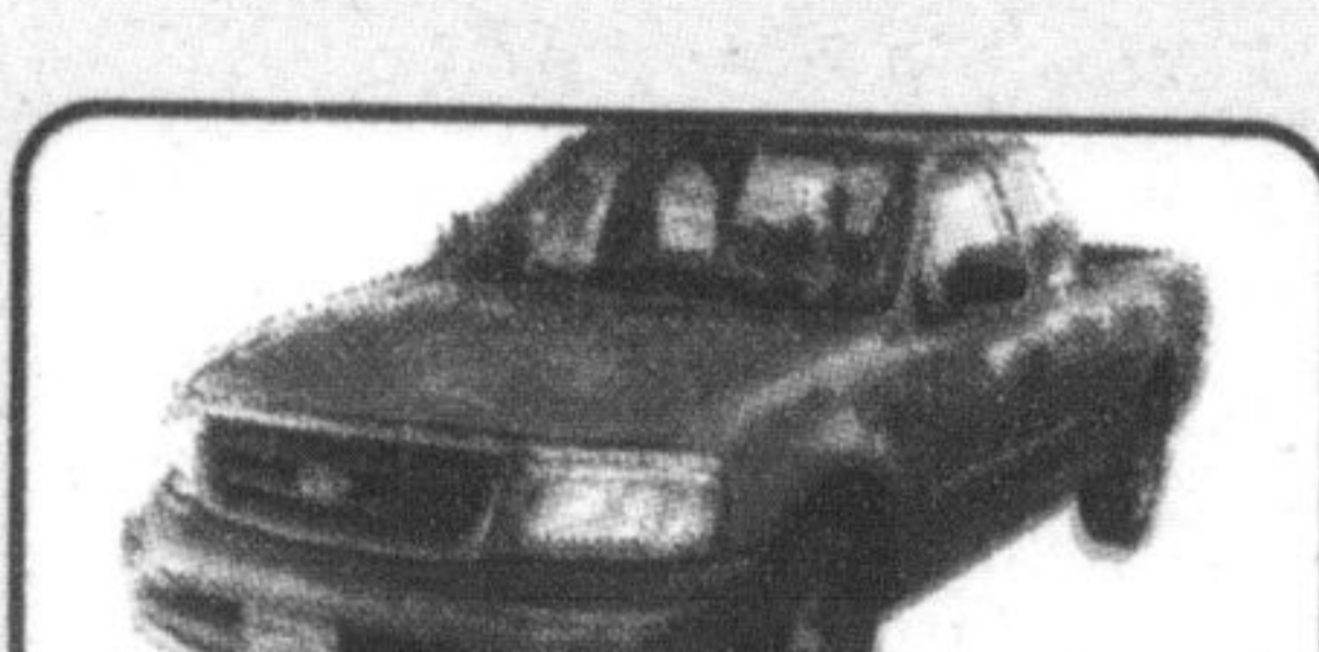
2003 F150 Supercab CASH PRICE '$27,315'

4.2L V6, auto, a/c, CD, aluminum wheels, speed control, tilt. F3047