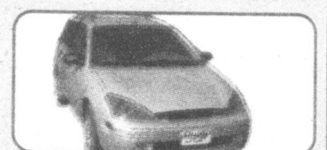
2003 Focus SE Sport Wagon CASH PRICE '$19,921'

43.8L EFI, auto, sport appearance group, handling pkg, all speed traction control M3015