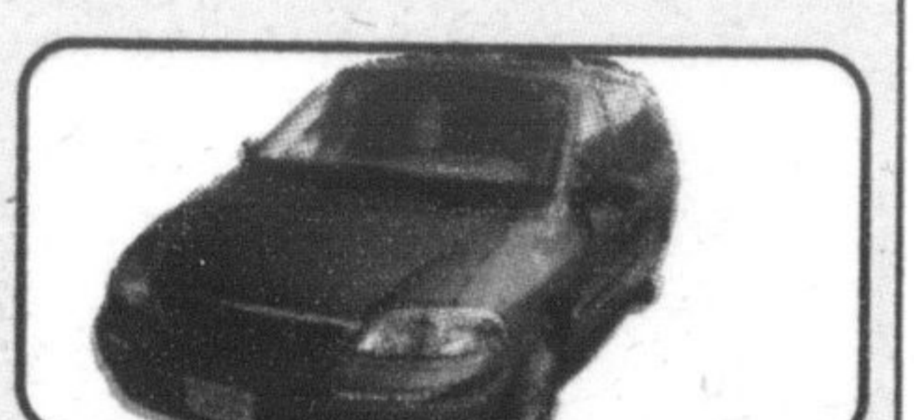
2003 Windstar Limited CASH PRICE '$37,066'

3.8L V6, auto, a/c, 7 passenger seating. W3034