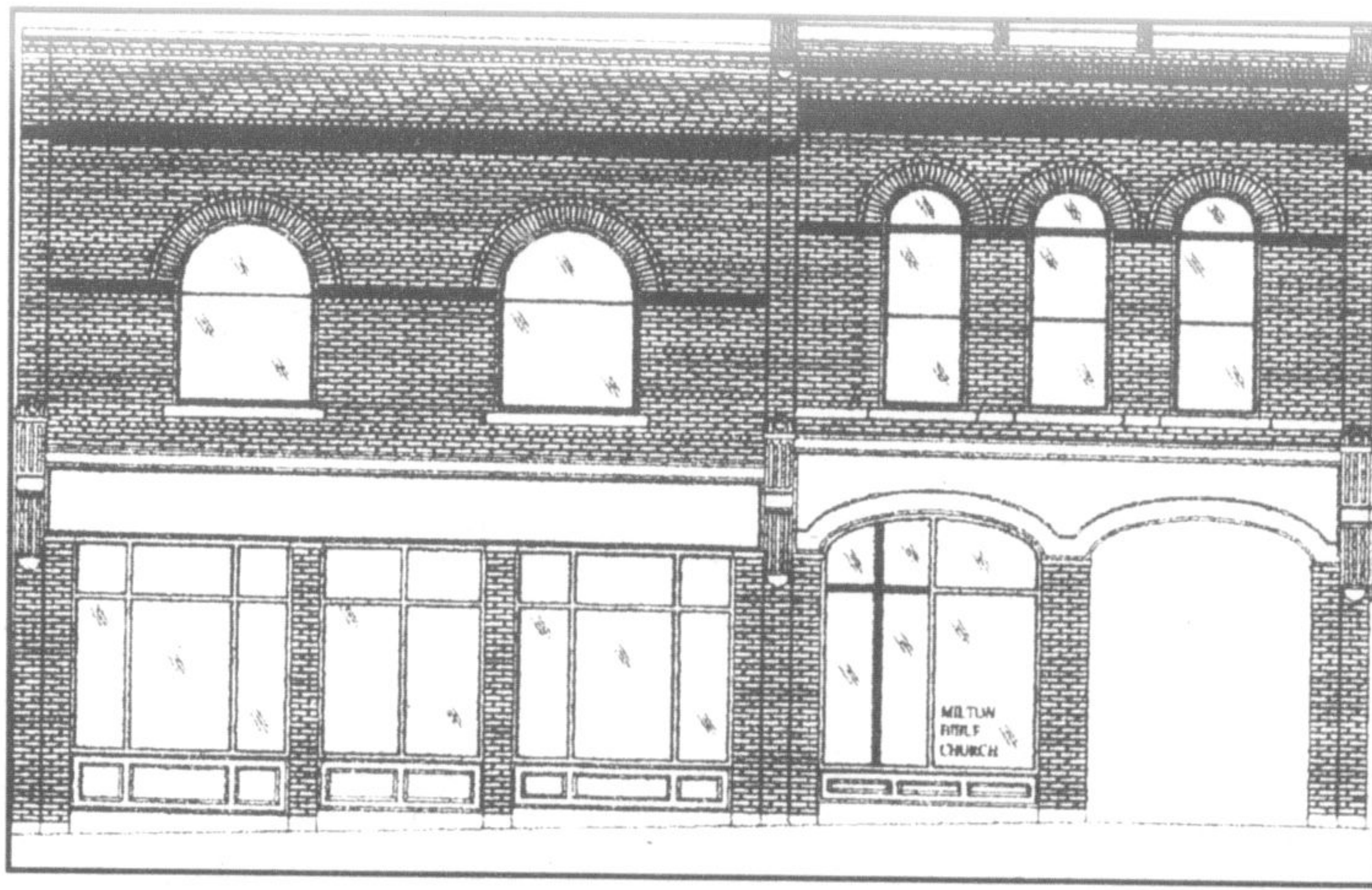
A sketch shows what the church will look like.

The church has been operating out of Milton District High School on Sundays the past two years.