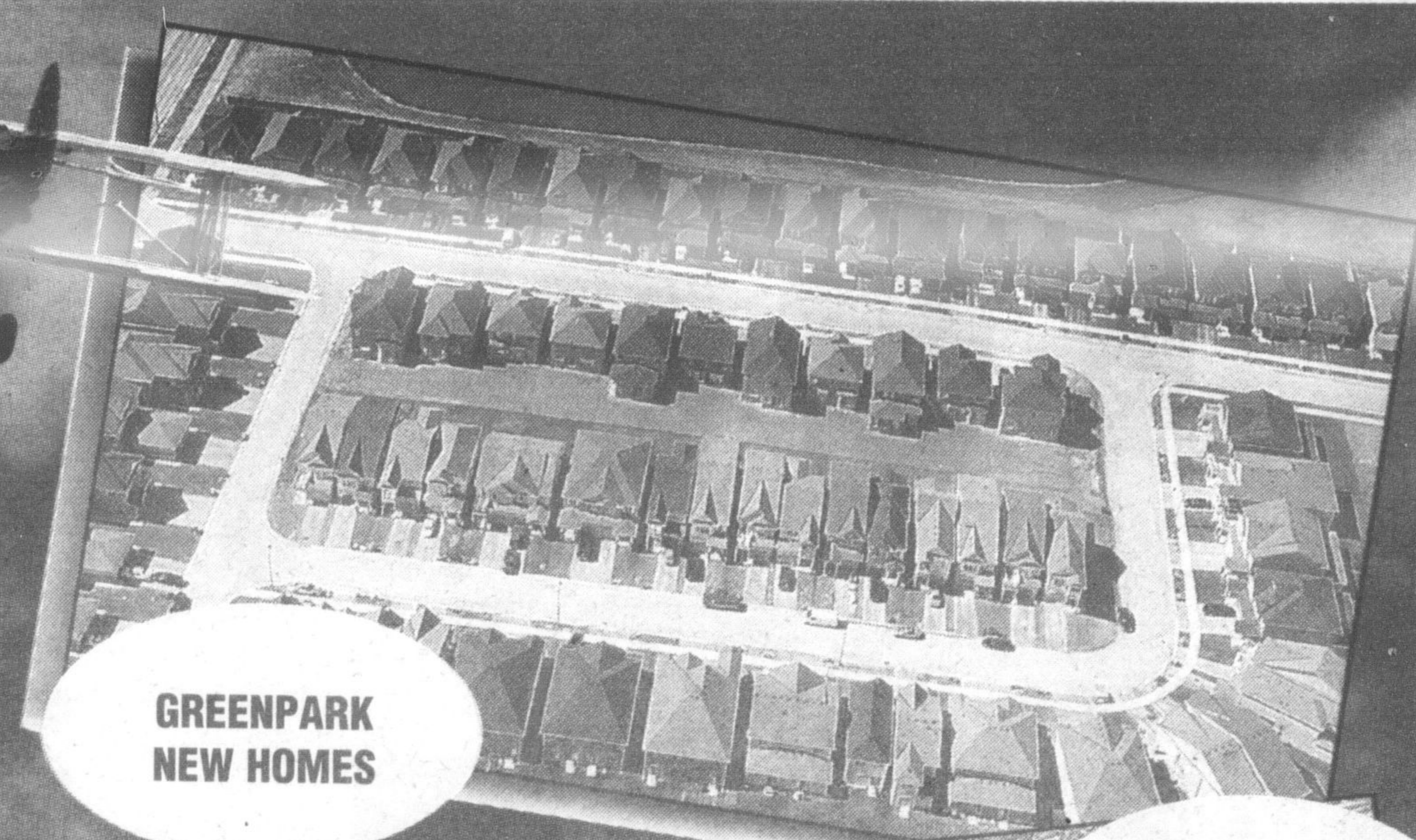
GREENPARK NEW HOMES