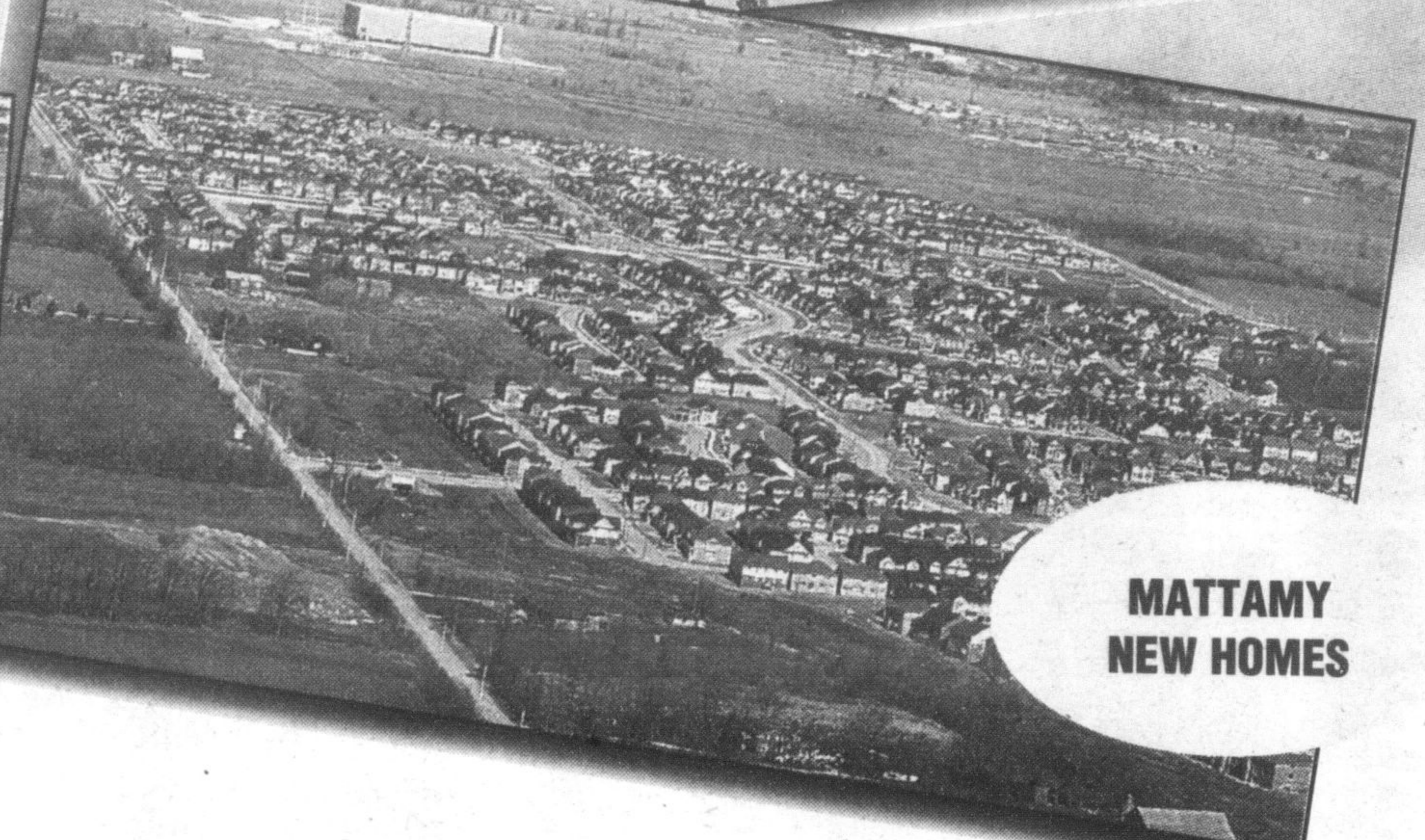
MATTAMY NEW HOMES