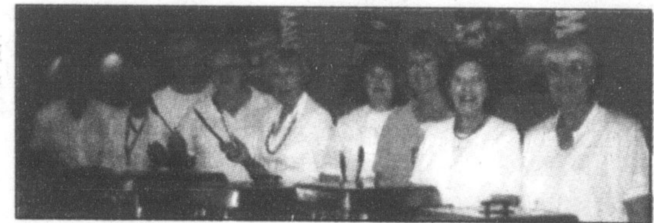
The beautiful faces of the Auxiliary members who served at the Jump Up

This hard-working committee planned, organized and held a wonderful fundraising dance. It was truly a memorable experience. Limbo dancers, steel bands and delicious food. The greatest accomplishment of all.....raising $17,000 for the Foundation. These proceeds will be used to finance a triple IV pump for the ICU unit at the Milton District Hospital.