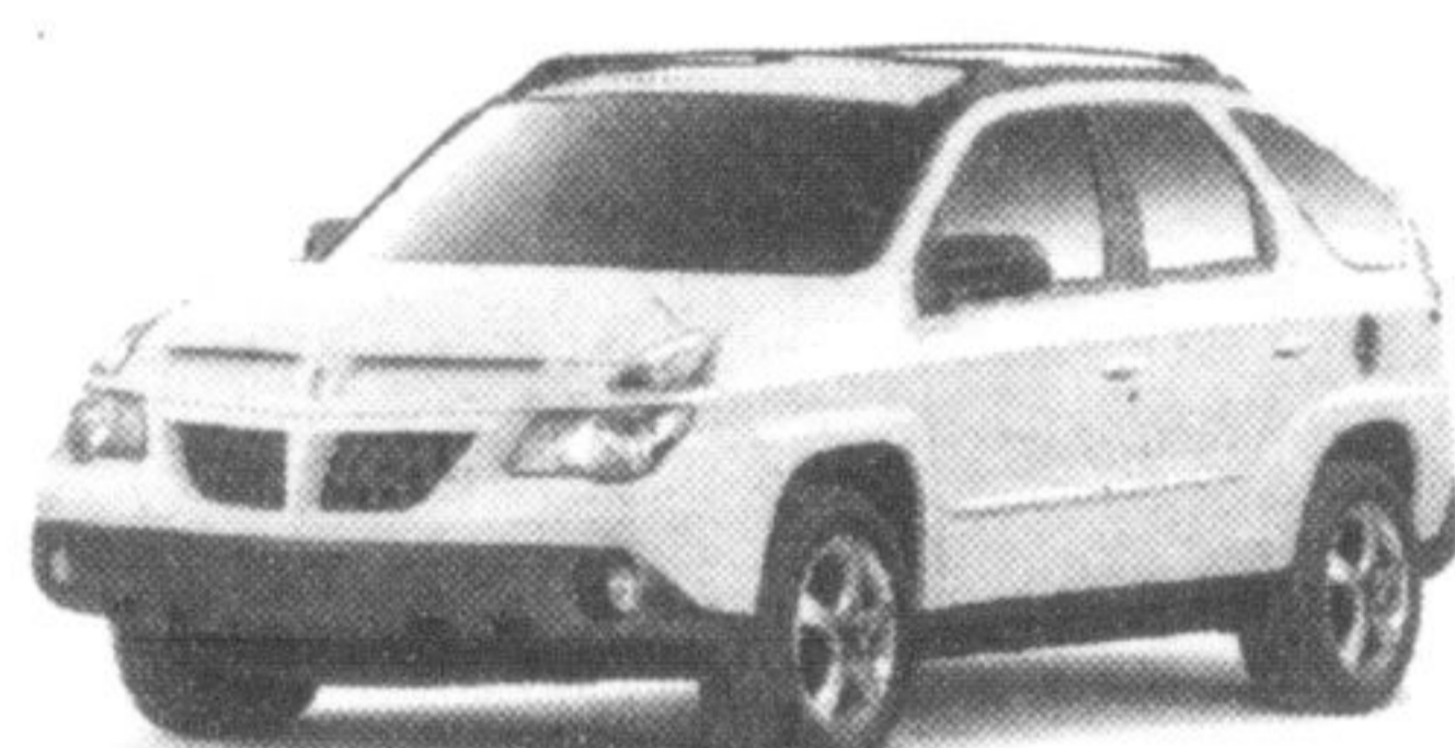
2003 PONTIAC AZTEK