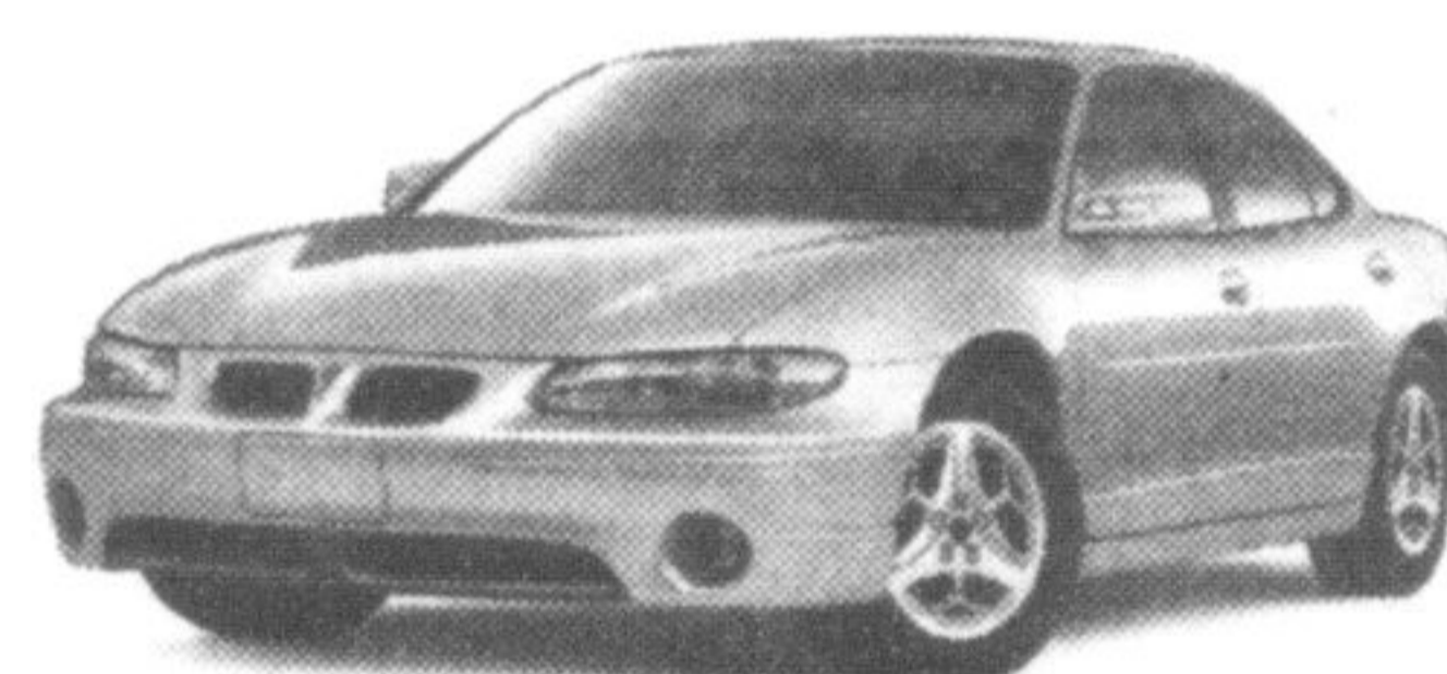
2003 PONTIAC GRAND PRIX