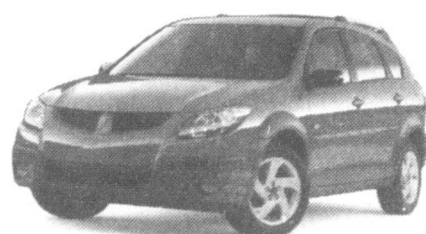
2003 PONTIAC VIBE