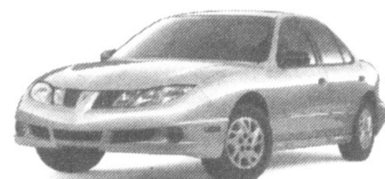
2003 PONTIAC SUNFIRE