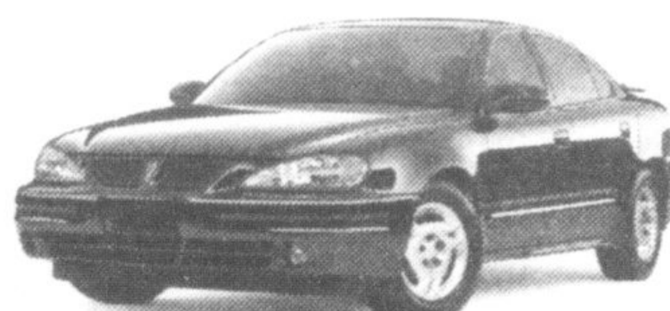
2003 PONTIAC GRAND AM