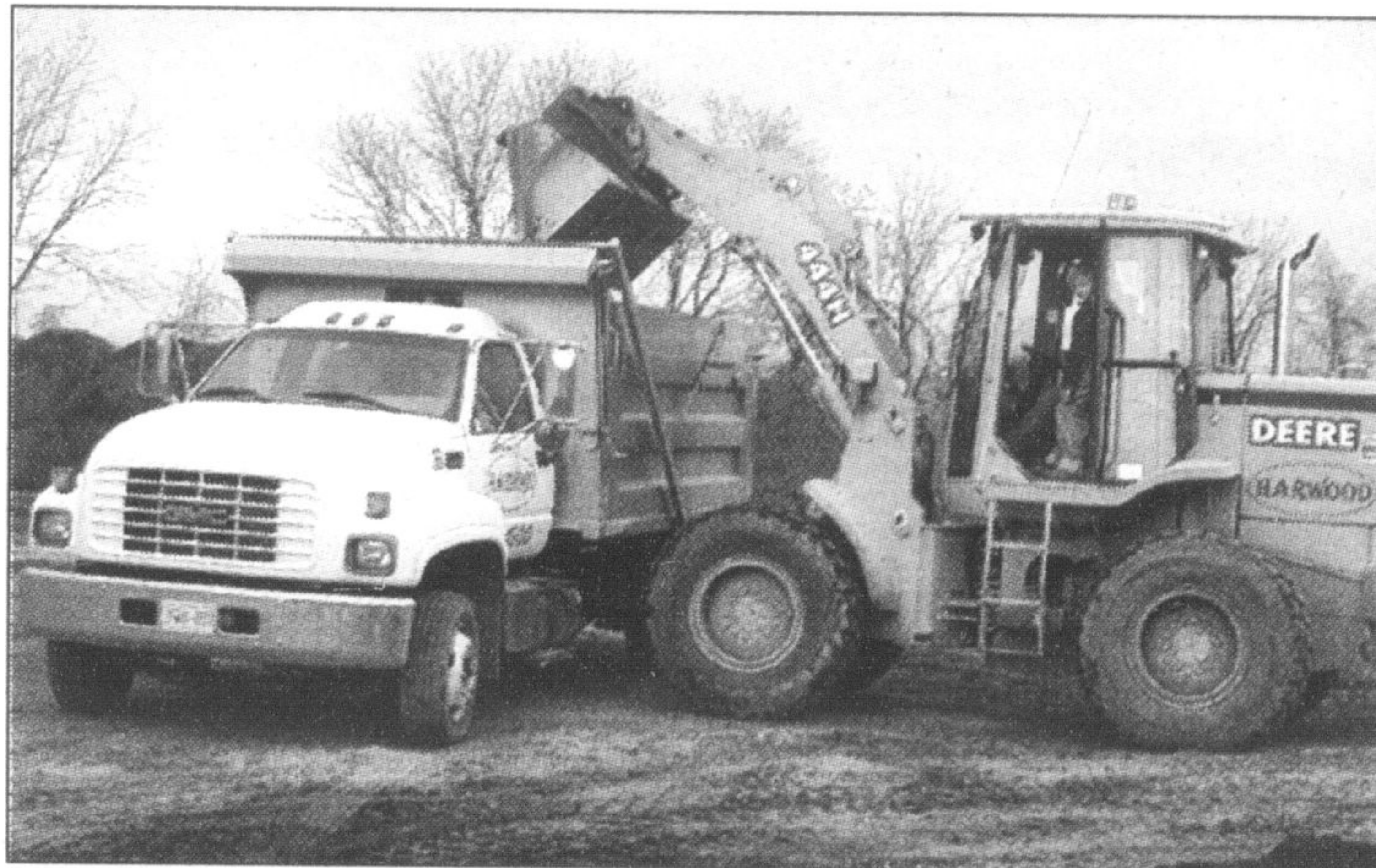
Jake Harwood, 9, Junior apprentice for his parents family run & operated business, Harwoods Horticultural Soil Farm and Garden Supply, located on Steeles Avenue. The outlet offers all sorts of decorative stones, soils and mulch, as well as a variety of alternative environmentally friendly solutions to pest control.

"Tackling garden pests is quite a chore," says Harwood, "Most garden centres carry the latest chemical solution to rid gardens of all sorts of bugs and weeds, but for those concerned, we have a few organic solutions