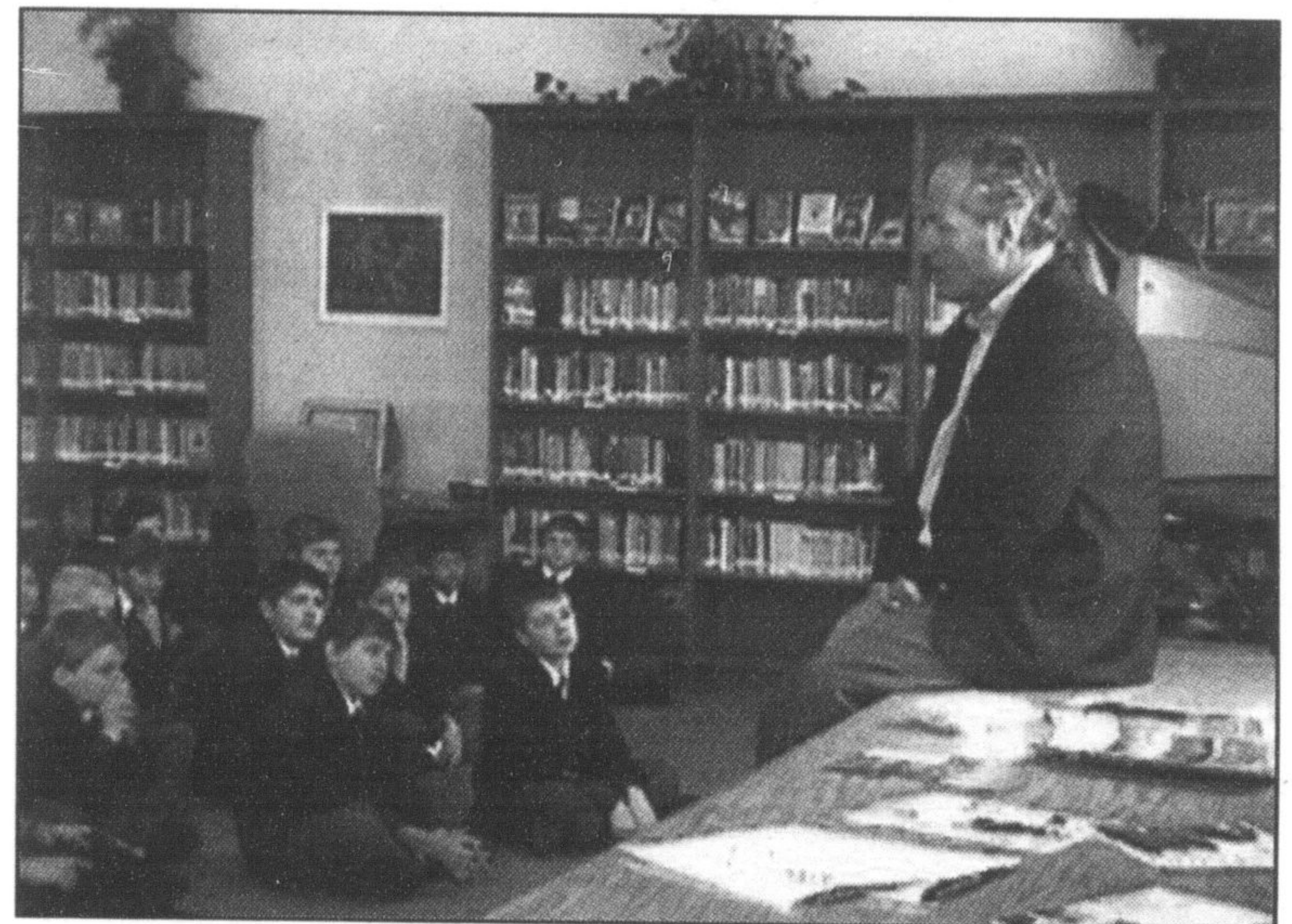
Halton MPP Ted Chudleigh visits with Grade 5 students in North Oakville.