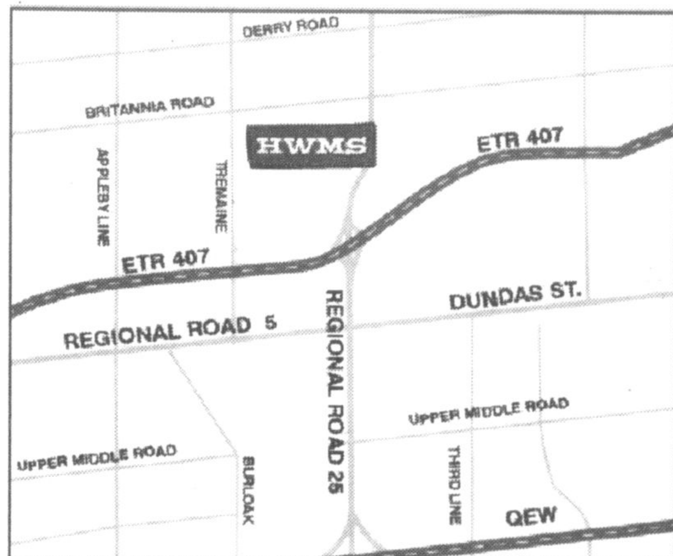
Halton Waste Management Site 5400 Regional Road 25, Milton