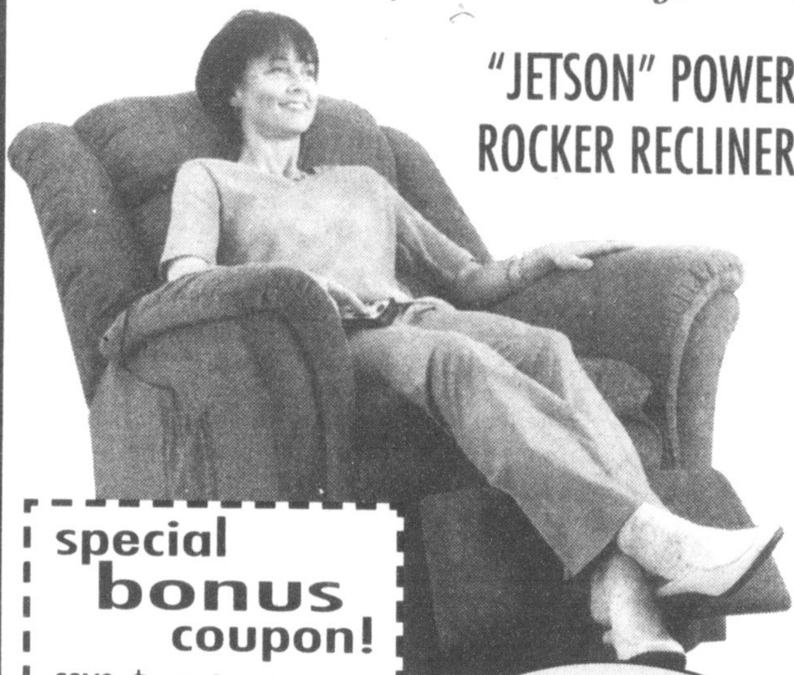
"JETSON" POWER ROCKER RECLINER