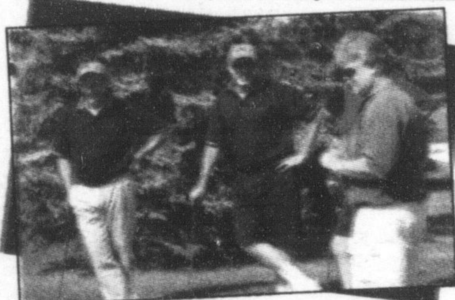
Enjoy a day of golf.