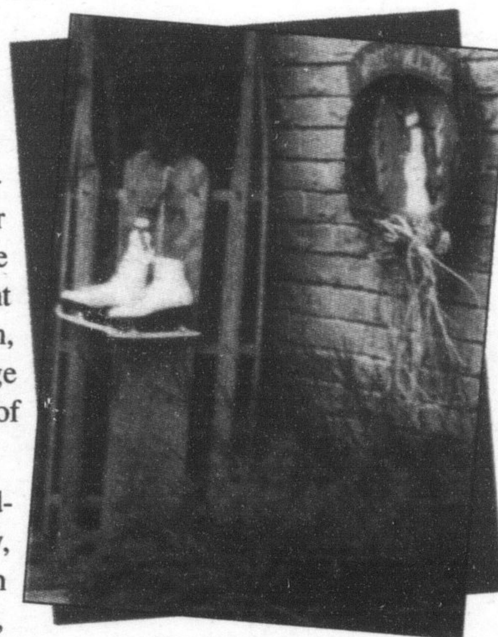
Decorated exterior from Christmas House Tour

The next tour is scheduled for Saturday, November 22nd, with an evening limited ticket, bus tour on Friday Nov. 21st.