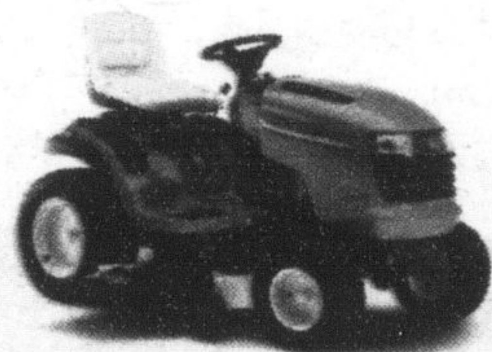
L130 23-hp, V-Twin engine $3,619 list price*