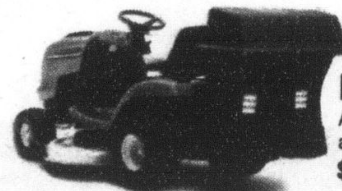
L110 Automatic with cruise control and LCD hour meter $2,599 list price*