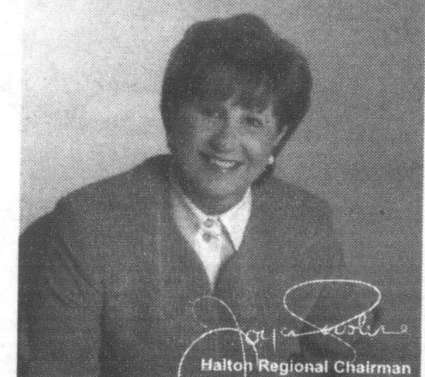
Halton Regional Chairman

Call us for your complimentary copy of Halton's Household Guide to Water Efficiency.