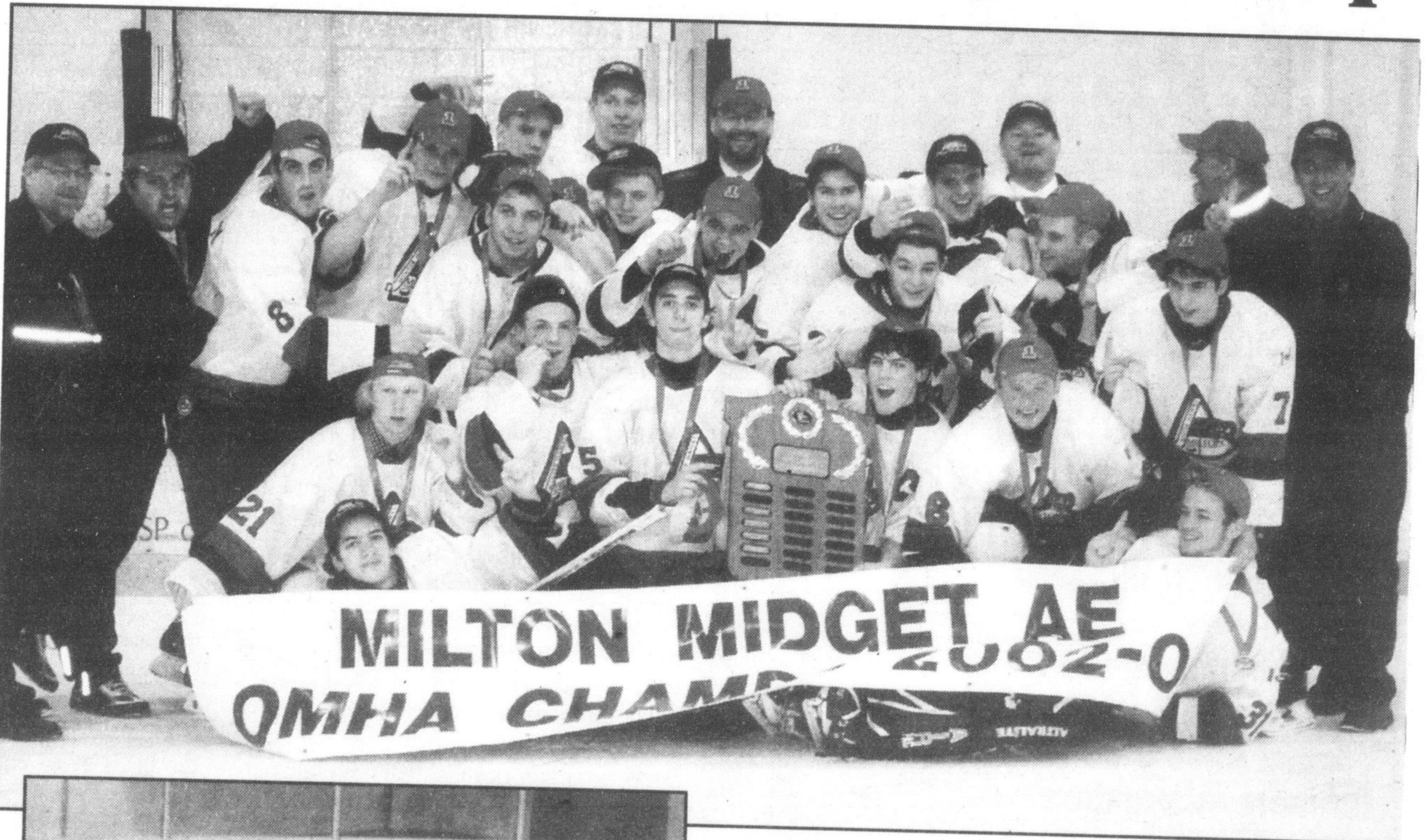
Milton's 'A' midgets celebrate their OMHA championship win after disposing of Tecumseh 2-1 in front of a sizable hometown crowd at Memorial Arena Sunday night.

Beyond that, the champs simply returned to the dependably