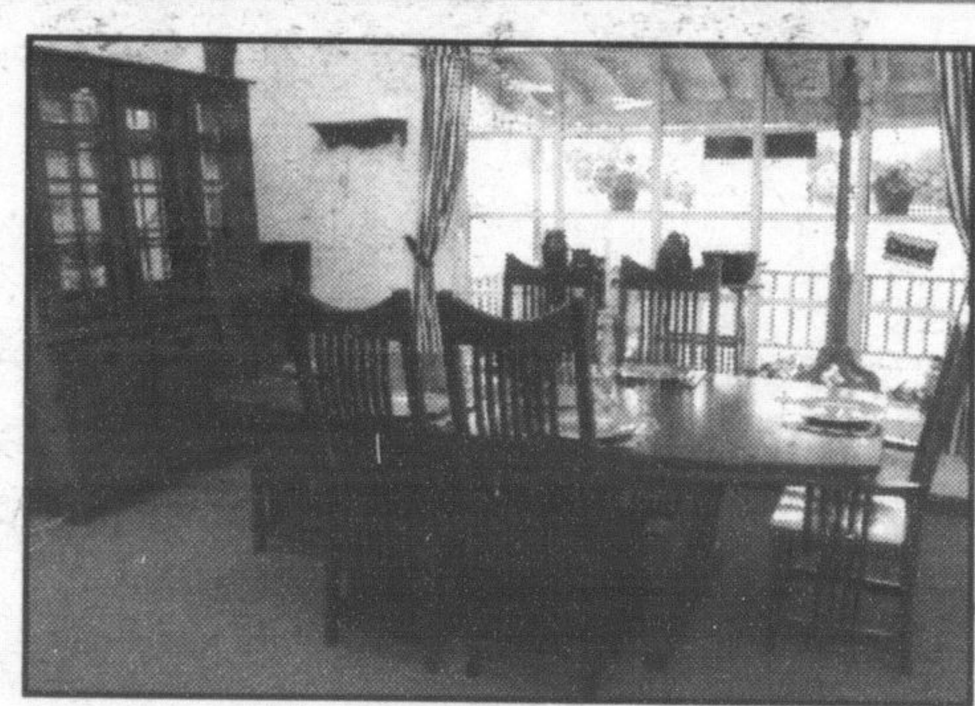
New Style, New Colour. Solid Oak Mission Dining Suite. Seats up to 12. Other styles to choose from. 10 fabulous colours available.

SOUTH OF 401 AT GUELPH LINE, CAMPBELLVILLE