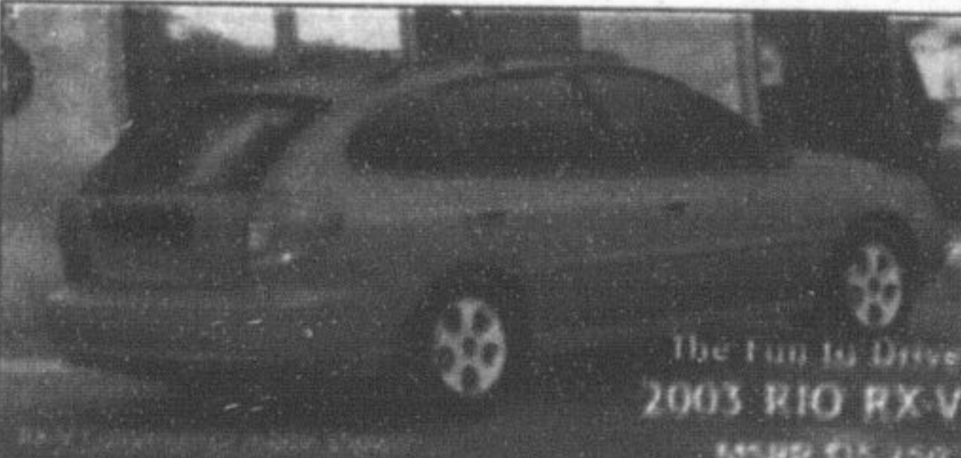
The Fun to Drive 2003 RIO RKV MSRP $15,750

$259 PER MO./48 MOS. LEASE FROM Only $3,850 Down Payment $0 SECURITY DEPOSIT OR 0% PURCHASE FINANCING AND DON'T PAY FOR 3 MONTHS