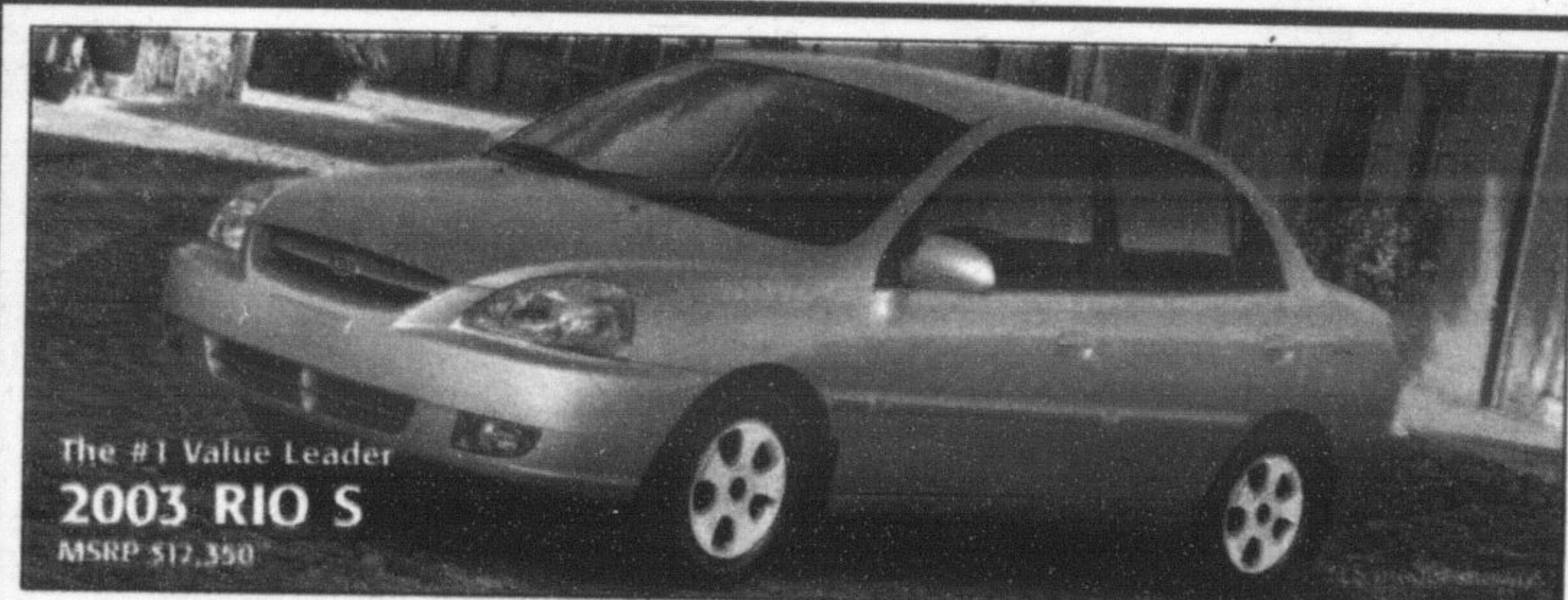
The #1 Value Leader 2003 RIO S MSRP $12,350