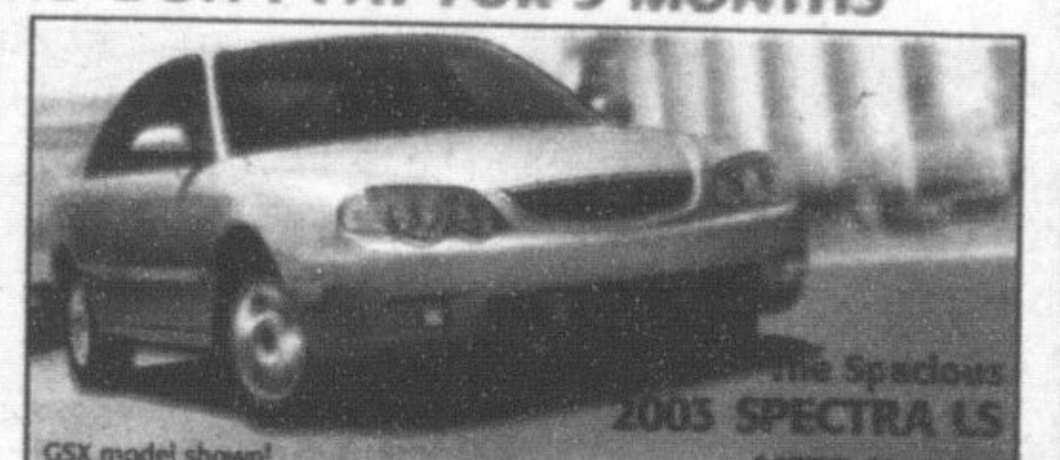
The Spacious 2003 SPECTRA LS MSRP $16,795

$189 PER MO./60 MOS. LEASE FROM Only $1,195 Down Payment $0 SECURITY DEPOSIT OR 0% PURCHASE FINANCING AND DON'T PAY FOR 3 MONTHS