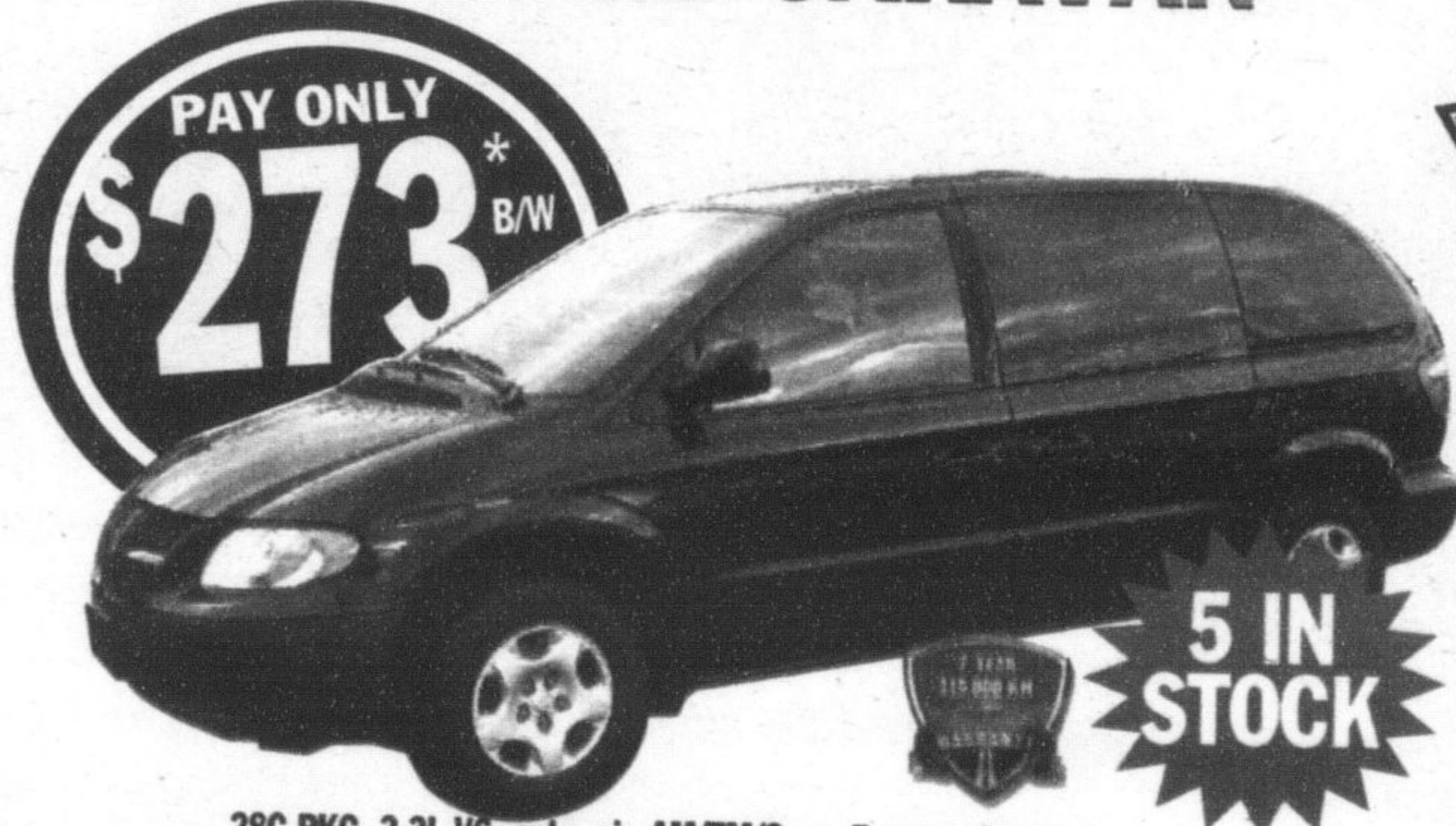
28C PKG, 3.3L V6, auto, air, AM/FM/Cass, 7 pass., floormats, rear window wiper, sunscreen glass & much more!

CANADA'S BEST SELLING VEHICLE 2003 DODGE CARAVAN