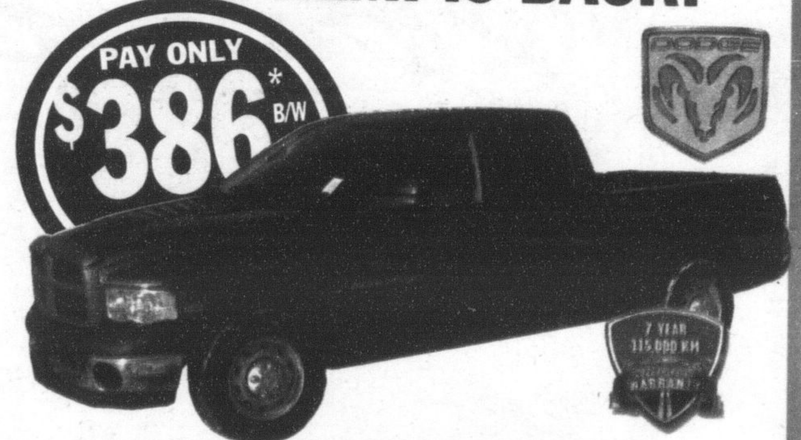
26A PKG, 5.7L HEMI V8 345HP, 5SPD AUTO TRANS., TRAILER TOW, TILT, CRUISE, ANTI-SPIN REAR AXLE, AM/FM/CD & MUCH MORE! ST# 739279

2003 DODGE RAM HEAVY-DUTY PICK-UPS "THE HEMI IS BACK!"