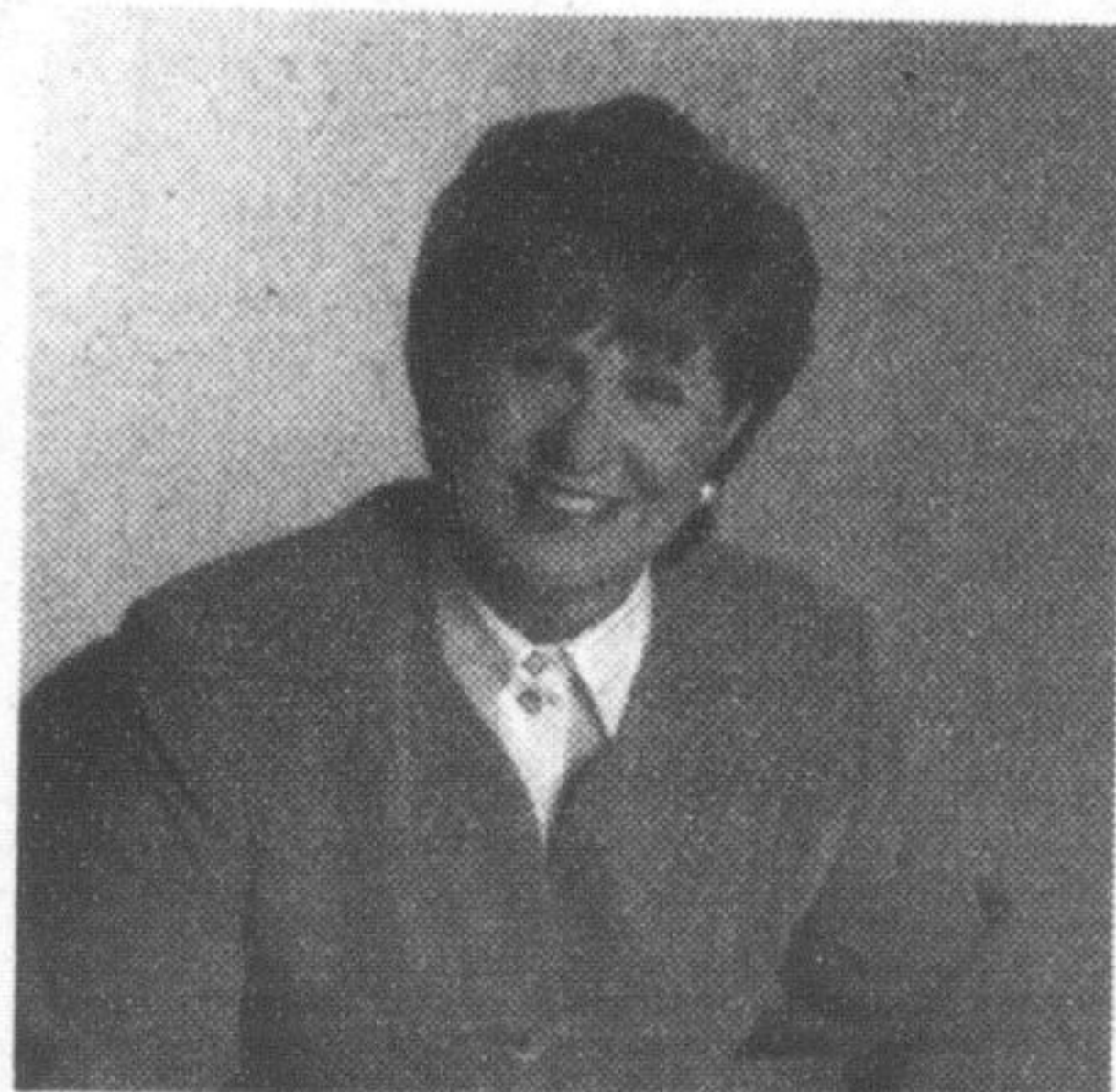
Halton Regional Chairman

To obtain a copy of the report, please visit Halton Region's website at www.region.halton.on.ca - click on the Emergency Housing Advisory Group button. The Advisory Group wishes to thank the community for their interest and contribution to the development of the final report and recommendations. The Group believes the criteria developed will ultimately lead to a solution that balances the needs of the public with the needs of Halton citizens who require access to emergency shelter within their own community.