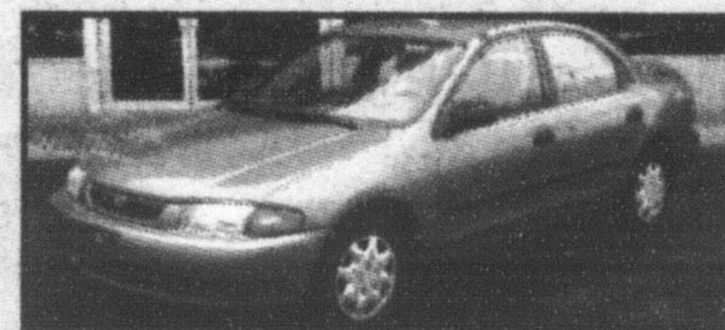
1998 MAZDA PROTEGE LX TOURING EDIT.

Automatic transmission, air conditioning, power locks/mirrors/windows, cruise and tilt steering, AM/FM/CD cassette, 4 spkrs. & clock. $16,995