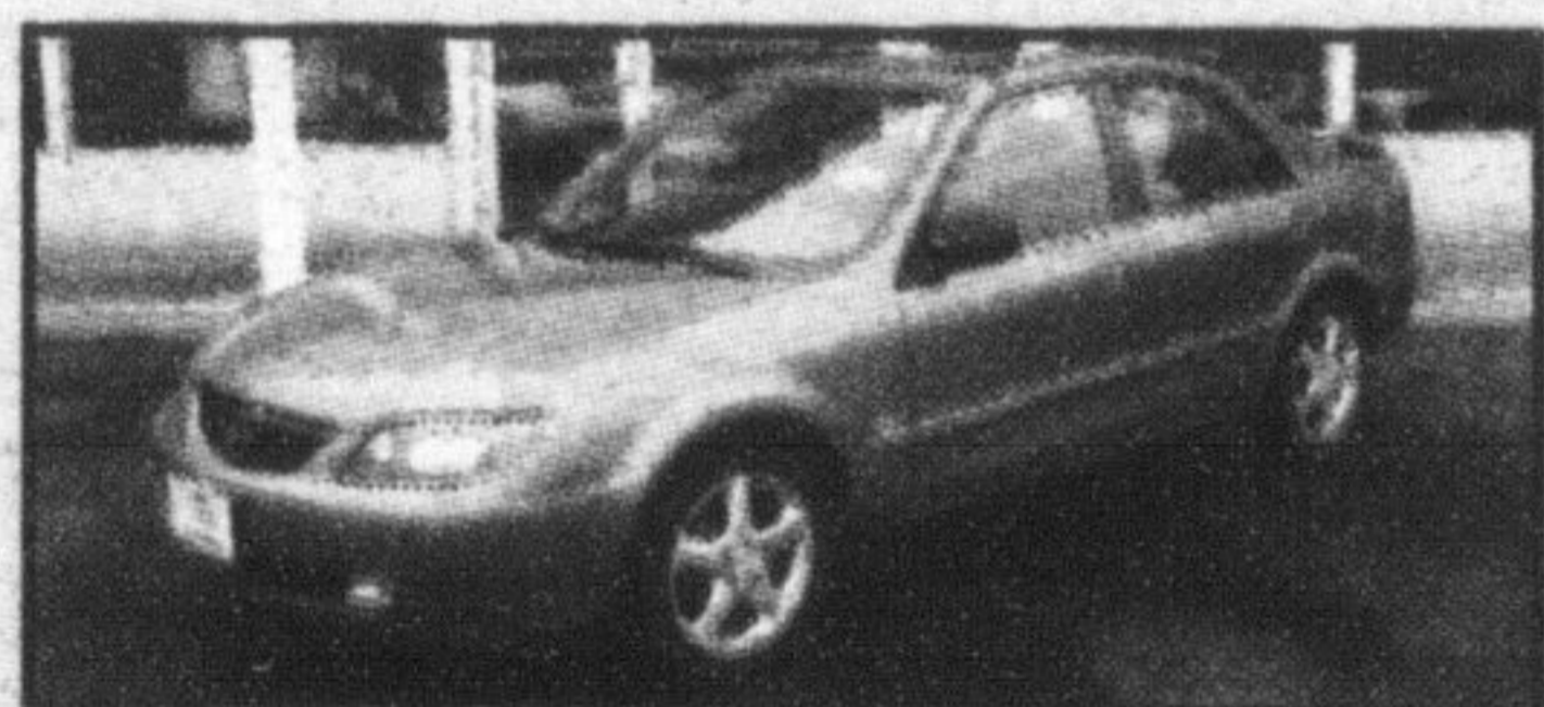
2001 MAZDA PROTEGE ES G

2.0L DOHC 16 valve, auto, AM/FM CD player w/4 spkrs & clock, tilt steering, cruise, AC, p. l/w/v, keyless entry w/2 key fobs, p. glass moonroof w/map lights, dual air bags, rear spoiler, leather wrapped 3 spoke steering wheel, 16" alloy wheels, fog lights. $17,995