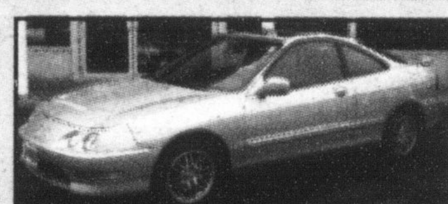
2000 ACCURA INTEGRA GS

Automatic transmission, 3.4L V6 engine, power locks/mirrors/windows, AM/FM CD player w/4 spkrs. & clock, rear heater, built-in rear child seat, balance of 72 month or 100,000 km warranty. $19,995