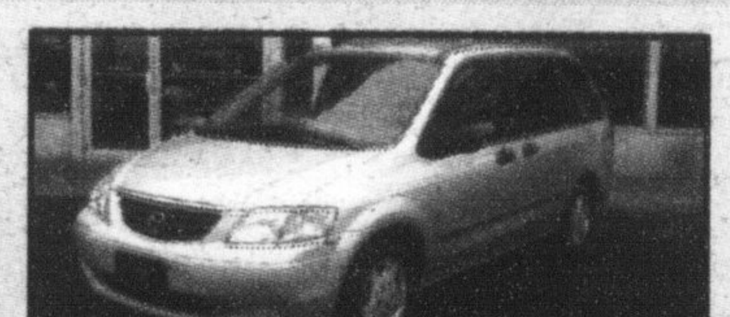
2000 MAZDA MPV-DX CONVENIENCE

5-spd. man. trans., a.c., p.locks/mirrors/windows, AM/FM CD player w/4 spkrs. & clock, power glass moonroof w/map lights, leather wrapped 3 spoke steering wheel, rear spoiler, 15" aluminum alloy wheels, dual air bags, power antenna, cruise & tilt steering, 1.8L DOHC VTEC 4 cylinder. $20,995