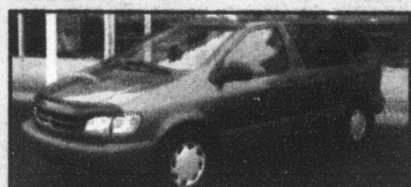
2000 TOYOTA SIENNA CE MINIVAN

1.6L 4 cyl., 5 spd. manual transmission, air conditioning, AM/FM CD player w/4 spkrs. & clock, dual air bags, tilt steering, intermittent wipers, power glass moonroof w/map lights, rear spoiler, tachometer. $13,995