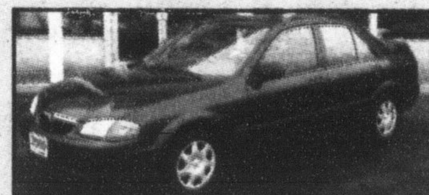
2000 MAZDA PROTEGE SE SPECIAL EDIT.

1.6L fuel injected engine, automatic transmission, air conditioning, AM/FM CD player w/4 spkrs. & clock, tilt steering, intermittent wipers, dual air bags. $14,995