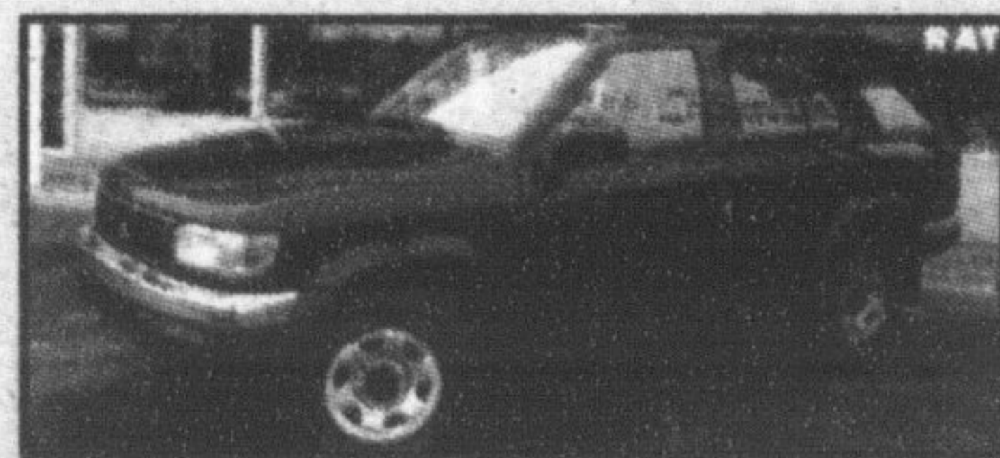
1998 NISSAN PATHFINDER XE/4X4

4.3L Vortec V6, auto trans., a.c., power locks/mirrors/windows, cruise and tilt steering, 8-way power driver seat, overhead console w/temp., homelink transmitter, fog lights, 15" aluminum alloy wheels, leather wrapped 3 spoke steering wheel, steering wheel mounted audio controls. $19,995