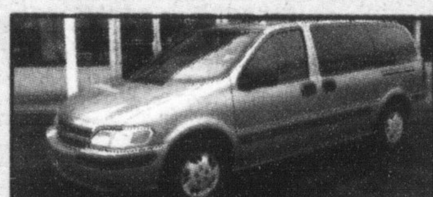
2001 CHEVROLET VENTURE

2.0L DOHC 16 valve, automatic transmission, air, AM/FM CD player w/4 spkrs & clock, tilt steering, dual air bags, intermittent wipers, 15" styled steel wheel covers, metallic paint. $15,995