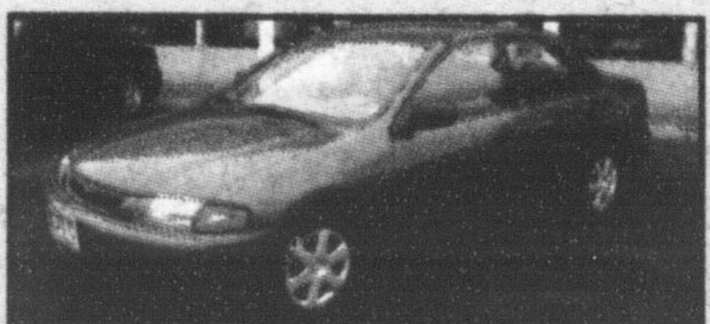
1998 MAZDA PROTEGE SE

1.8L SVT 16 valve multi port fi, 5-spd. manual transmission, air conditioning, power locks/mirrors/windows, tilt steering, cruise control, AM/FM CD player w/4 spkrs. & clock, rear spoiler. $12,995