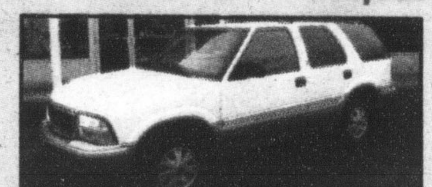
1999 GMC JIMMY SLE 4X

4.0L V8, automatic transmission, premium leather seats, 16" alloy wheels, power seat, power locks/mirrors/windows, homelink transmitter, cruise and tilt steering, AM/FM CD player w/4 spkrs. & clock. $19,795