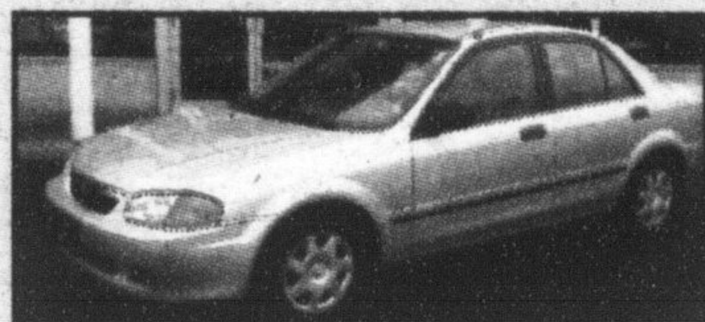
2000 MAZDA PROTEGE SE 4-DOOR

2.5L V6, automatic transmission, air conditioning, AM/FM CD player w/4 spkrs. & clock, power locks/mirrors/windows, cruise and tilt steering, privacy glass. $18,995