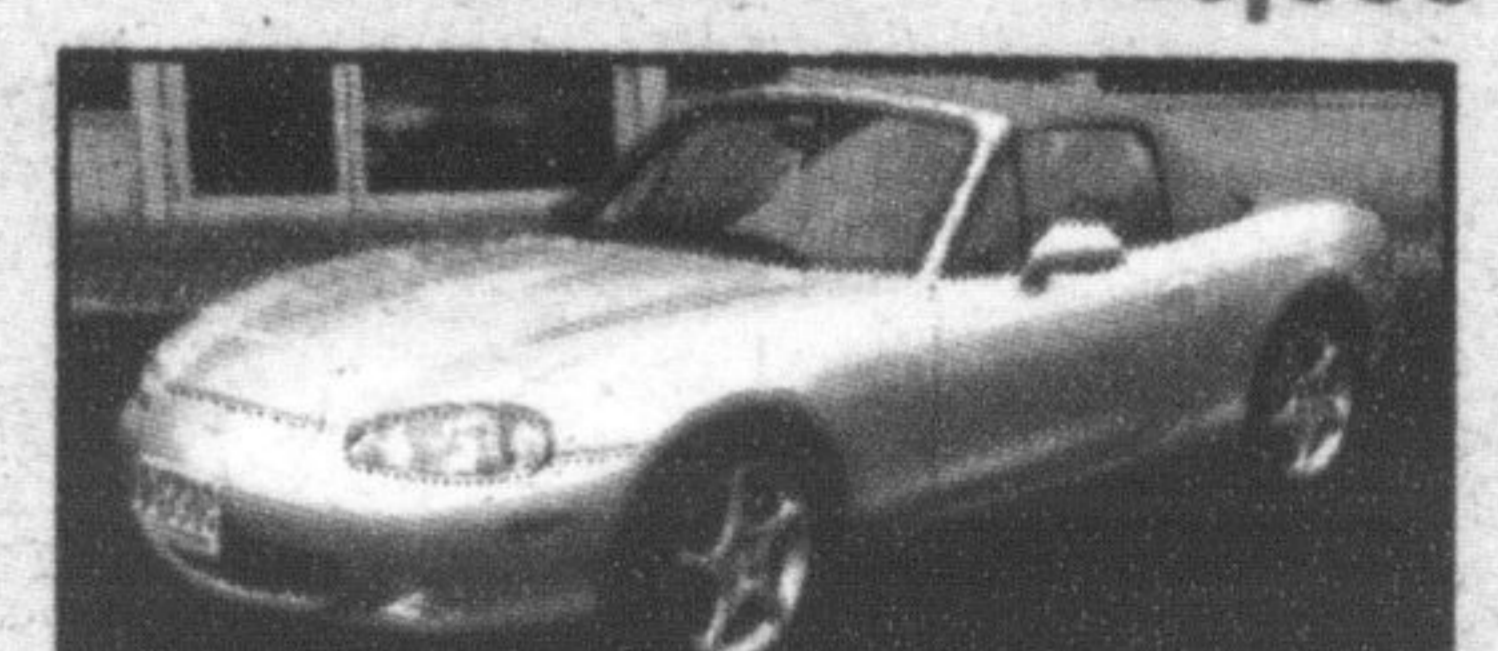
2002 MAZDA MIATA 2-DR., CONV.

3.9L Magnum V8, auto, a.c., body coloured p. mirrors, intermittent wipers, 15" alum. alloy wheels, fog lights, sliding rear window, AM/FM cass., prem. AM/FM 6 disc changer, color matching tonneau cover, box liner, dual air bags. $12,995