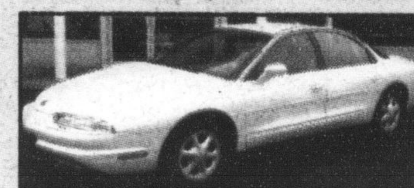
1999 OLDSMOBILE AURORA

3.0L DOHC 24 valve V6 MPFI, auto, p. locks/mirrors/windows, cruise & tilt steering, AM/FM CD player/4 spkrs. & clock, keyless entry w/2 key fobs, steering wheel mounted audio controls, rear heater, rear wiper, 7 pass. seating, 4-dr., dual air bags, privacy glass. $20,595