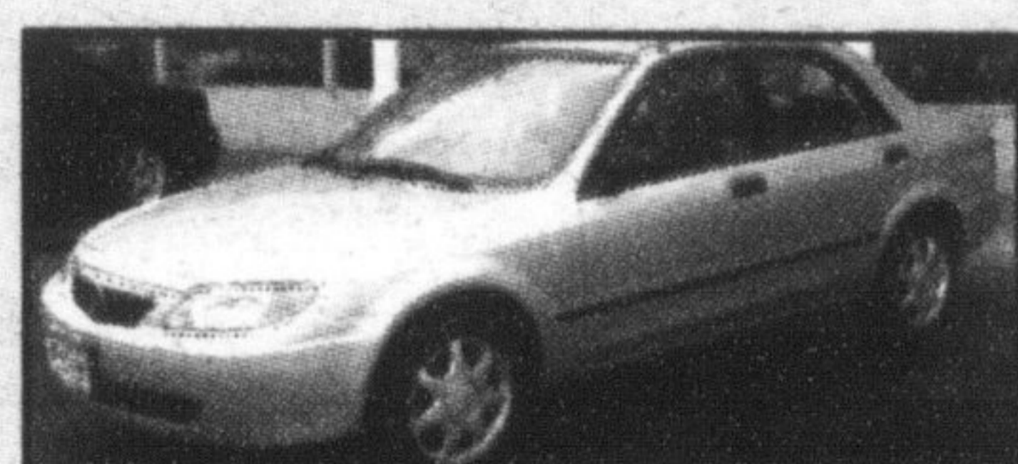
2001 MAZDA PROTEGE LX

2.0L DOHC 16 valve, auto, AM/FM CD player w/4 spkrs & clock, tilt steering, cruise, AC, p. l/w/v, keyless entry w/2 key fobs, p. glass moonroof w/map lights, dual air bags, rear spoiler, leather wrapped 3 spoke steering wheel, 16" alloy wheels, fog lights. $17,995