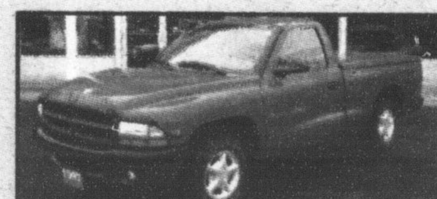
1997 DODGE DAKOTA REG. C SPORT

1.6L 4 cyl., automatic transmission, intermittent wipers, tilt steering, dual air bags, AM/FM CD player w/4 spkrs. & clock. $10,995