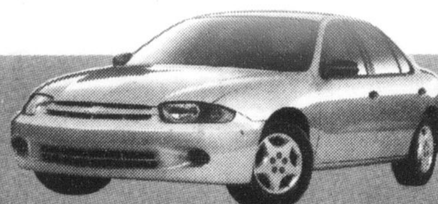
2003 Chevrolet Cavalier VL Sedan

easy TO GET into: $12,978* † $174 *CASH PURCHASE plus freight. †PLUS YOUR RING IN AND WIN AWARD.