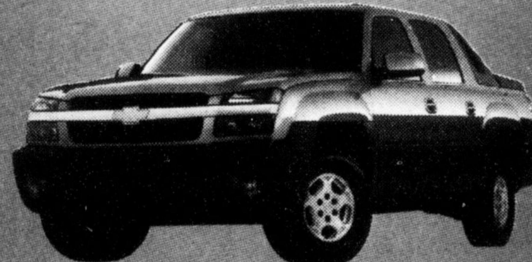
2003 Chevy Avalanche

★★★★★ FIVE STAR SAFETY RATING. Chevrolet Impala has earned a 5-Star front crash test rating.*