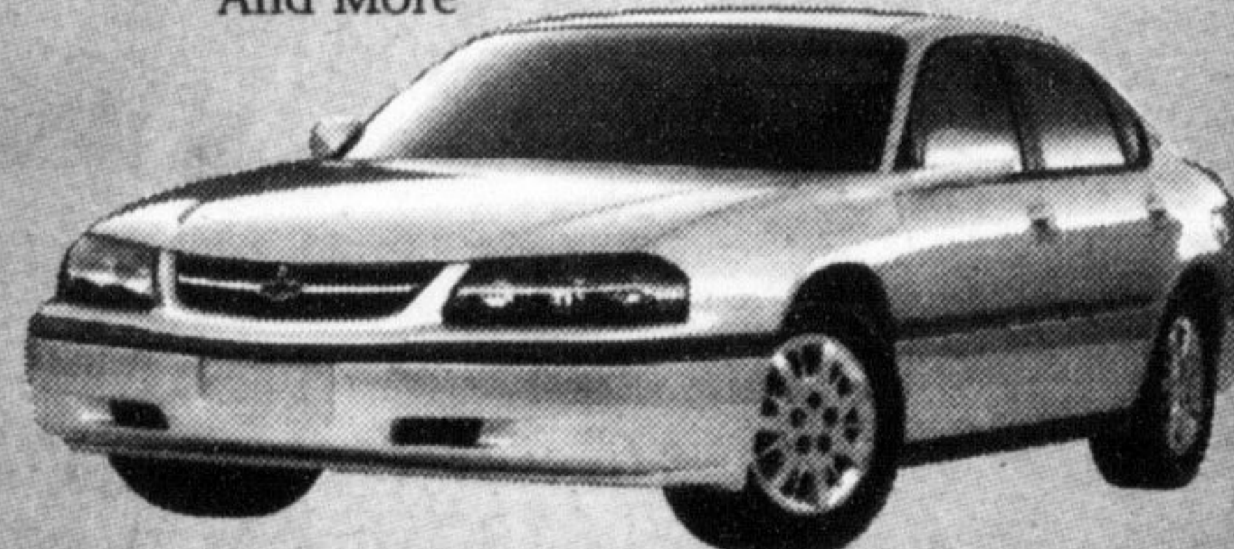
2003 Chevrolet Impala

easy TO GET into: $23,598* † $278 *CASH PURCHASE plus freight. †PLUS YOUR RING IN AND WIN AWARD.