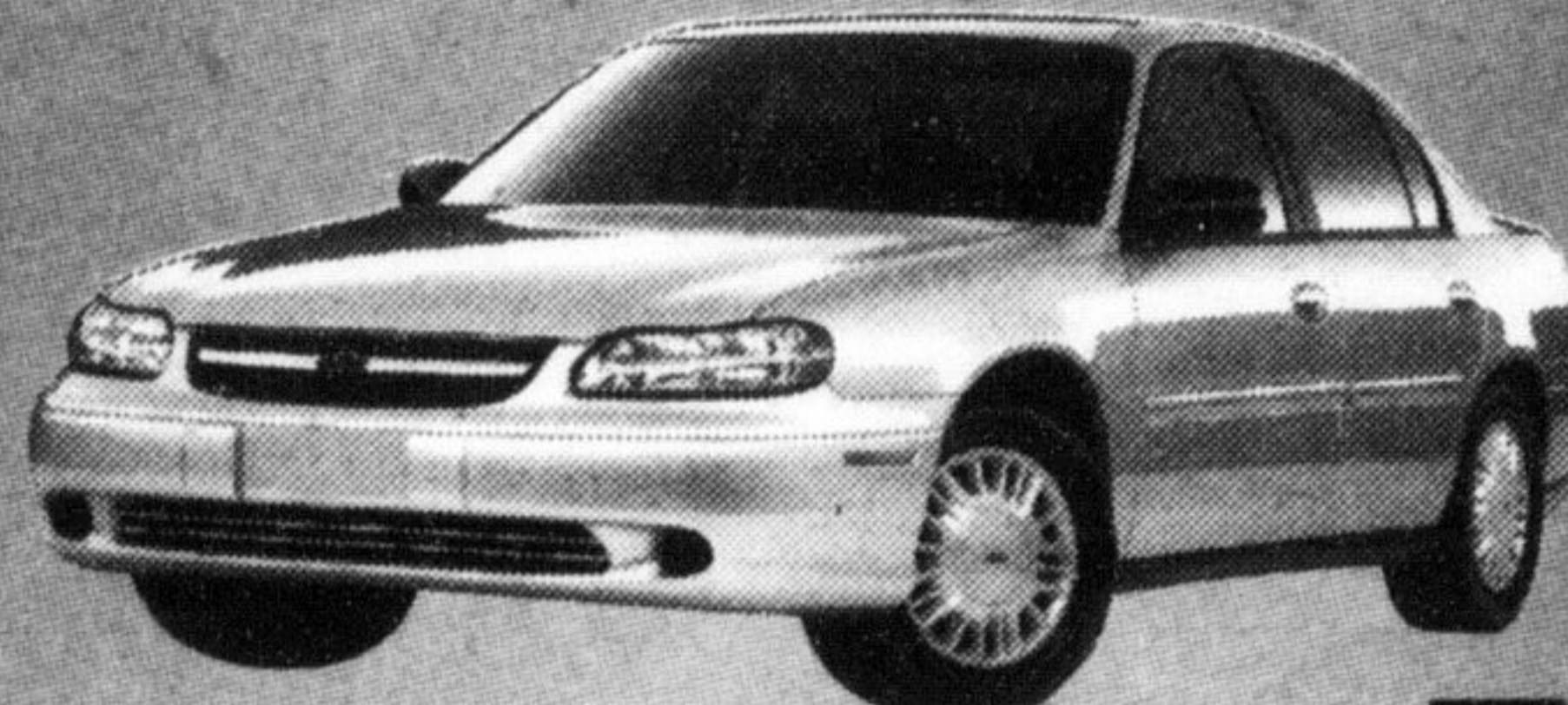
2003 Chevrolet Malibu V6

easy TO GET into: $19,998* † $258 *CASH PURCHASE plus freight. †PLUS YOUR RING IN AND WIN AWARD.