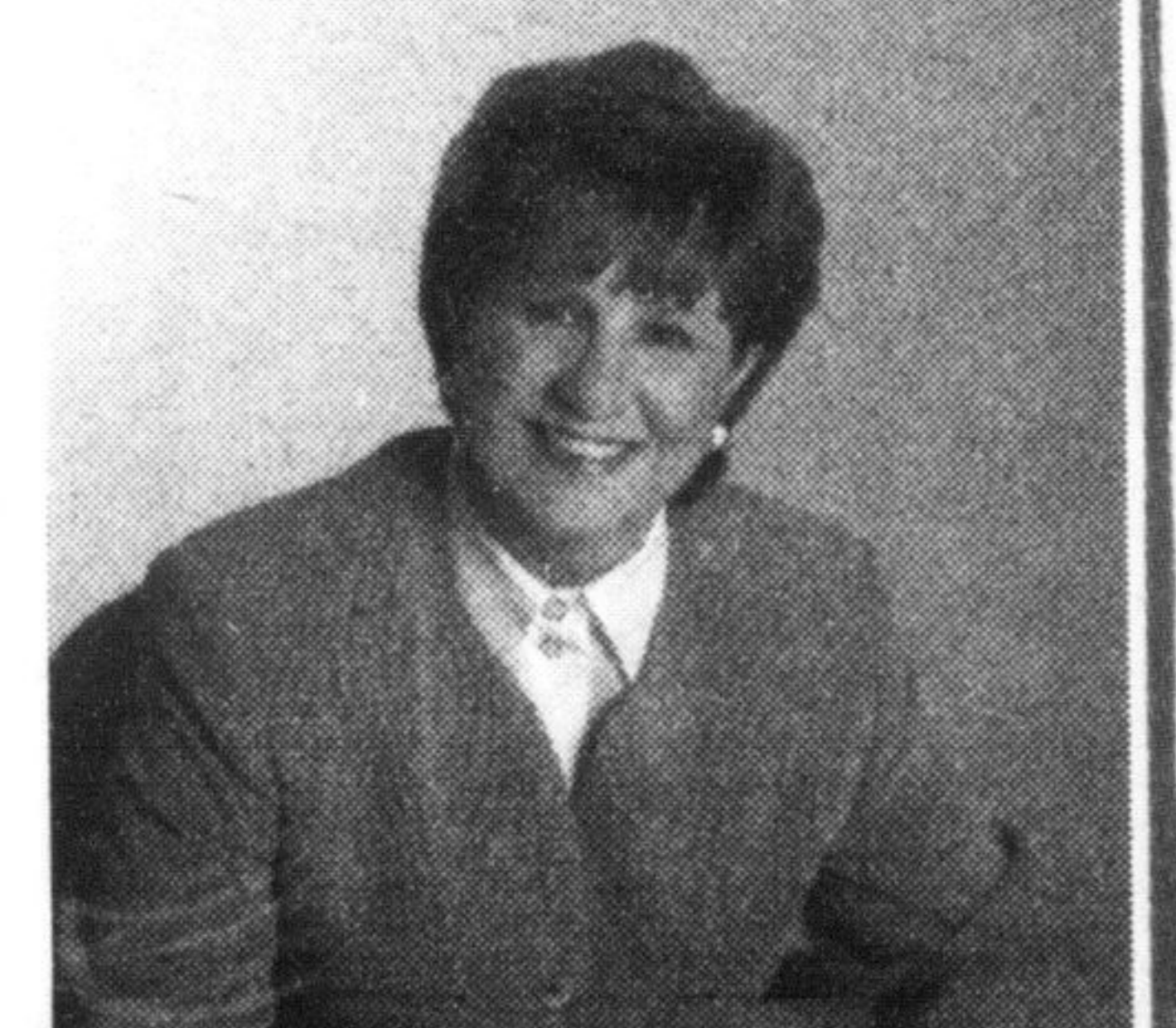
Halton Regional Chairman