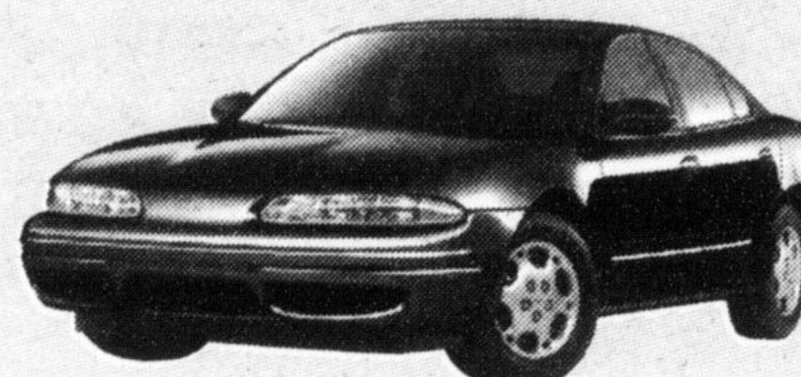
2003 Alero GX Sedan by Oldsmobile