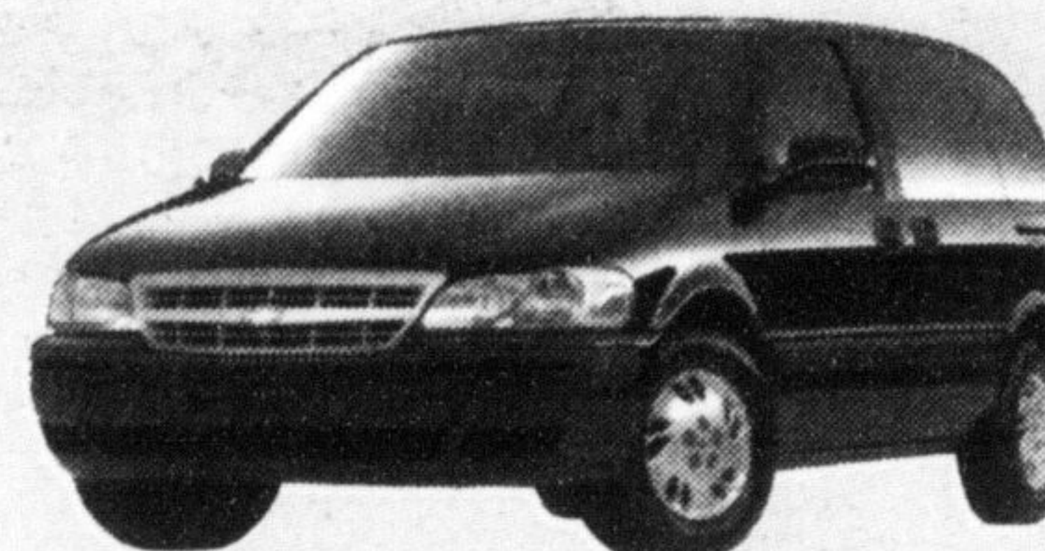
2003 Chevrolet Venture