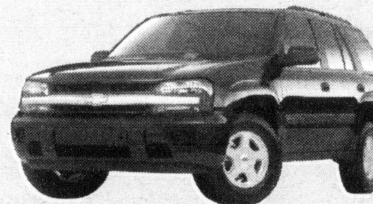
2003 Chevy TrailBlazer LS 4x4

★★★★★ FIVE STAR SAFETY RATING. On vehicles equipped with optional side bags Chevrolet Venture holds a 5-Star front seat rating in side impact tests.*