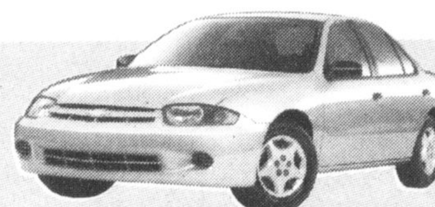
2003 Chevrolet Cavalier VL Sedan