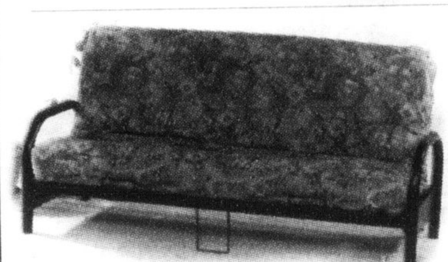
Iron Futon Black iron tubing. Mattress included. $209