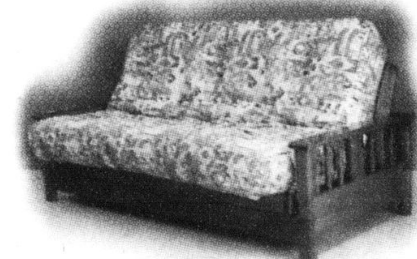
Manhattan Futon Mattress included $439