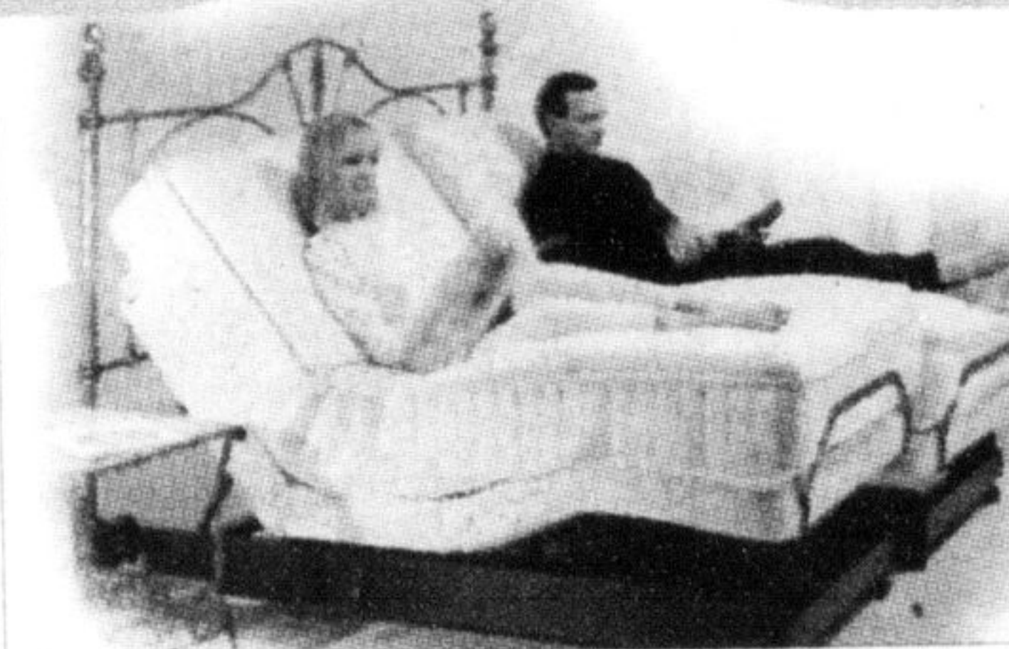
Electric Bed Complete comfort adjustable sleep system. $1279