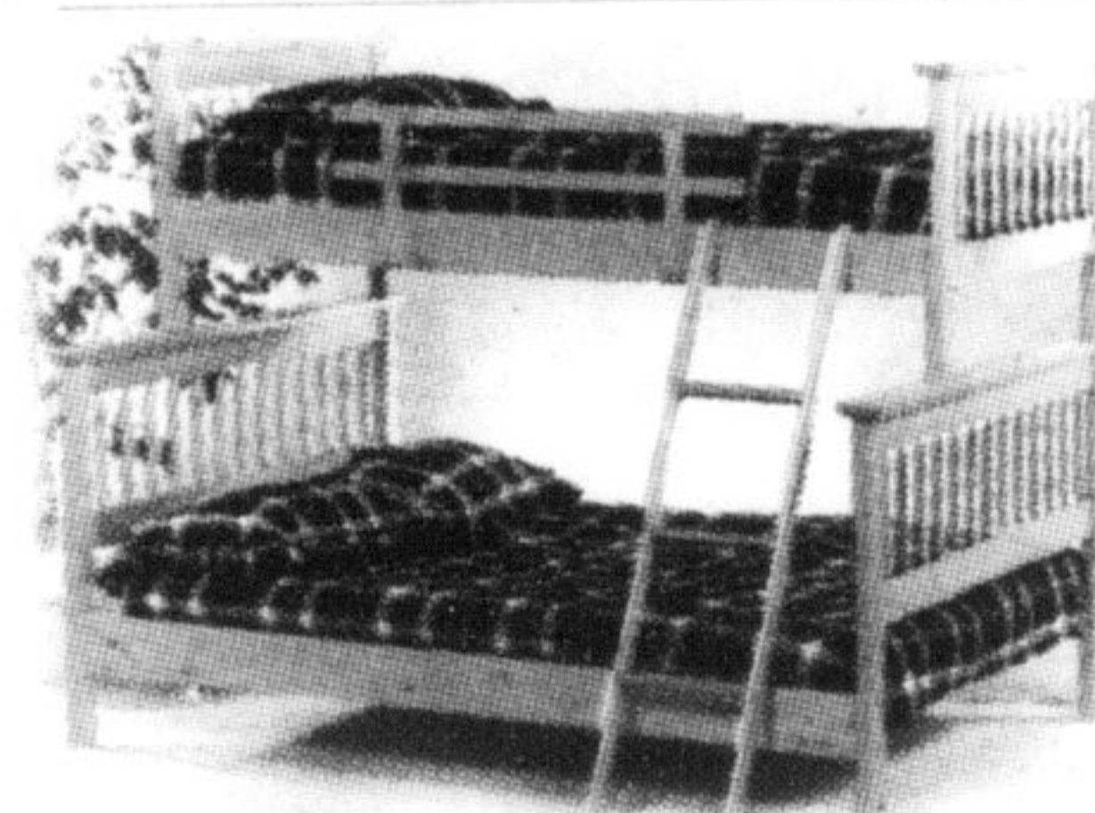
Milan Twin Over Double Bunk $529