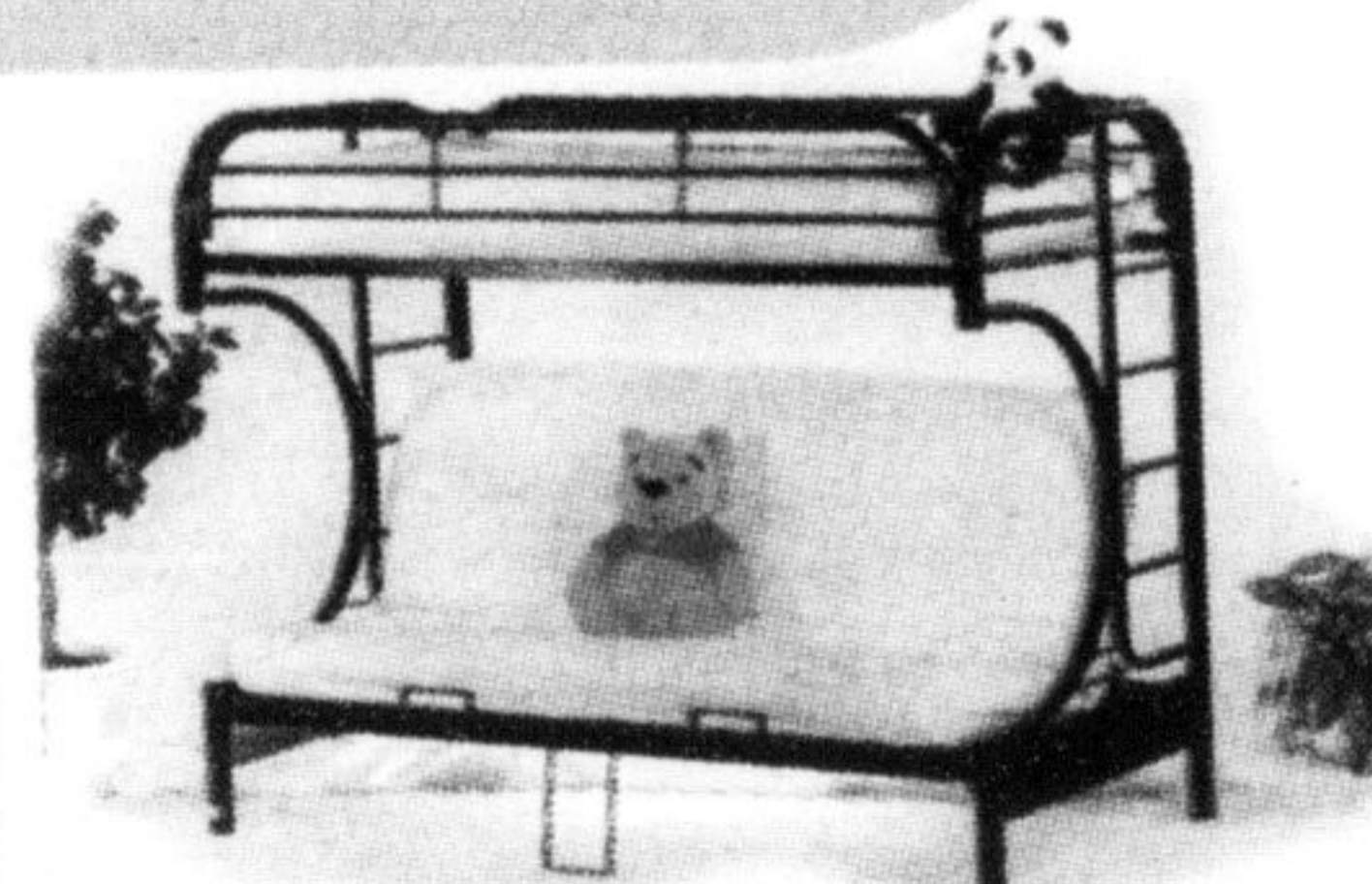
Iron Futon Bunk Mattresses included $549