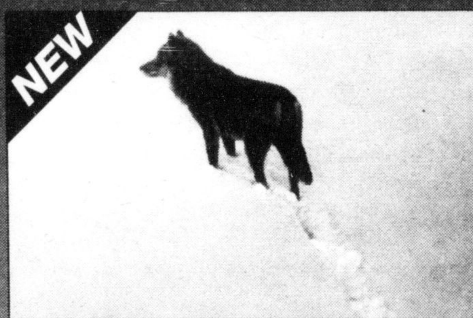
$345 unframed "New Territory - Black Wolf" 21" x 32"

SPECIAL ORDER "HAIRY WOODPECKER" & receive his new "BIRDS" Book FREE