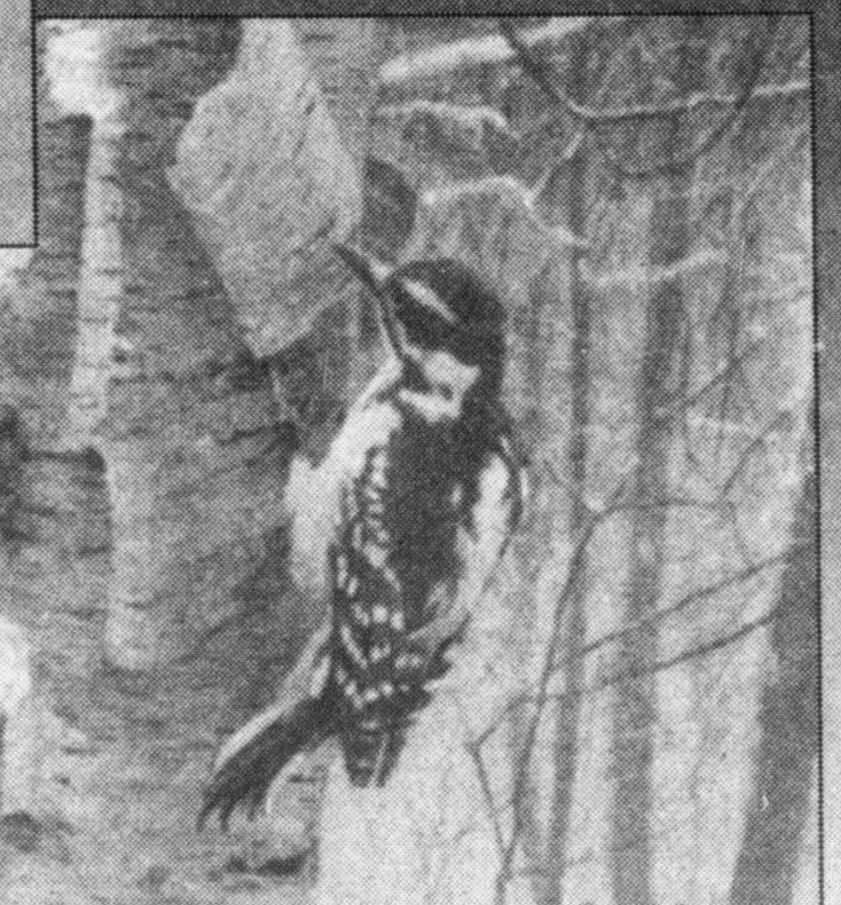
$185 "Hairy Woodpecker on Birch" 11 7/9" x 17"

An excellent selection of his artwork will be available.