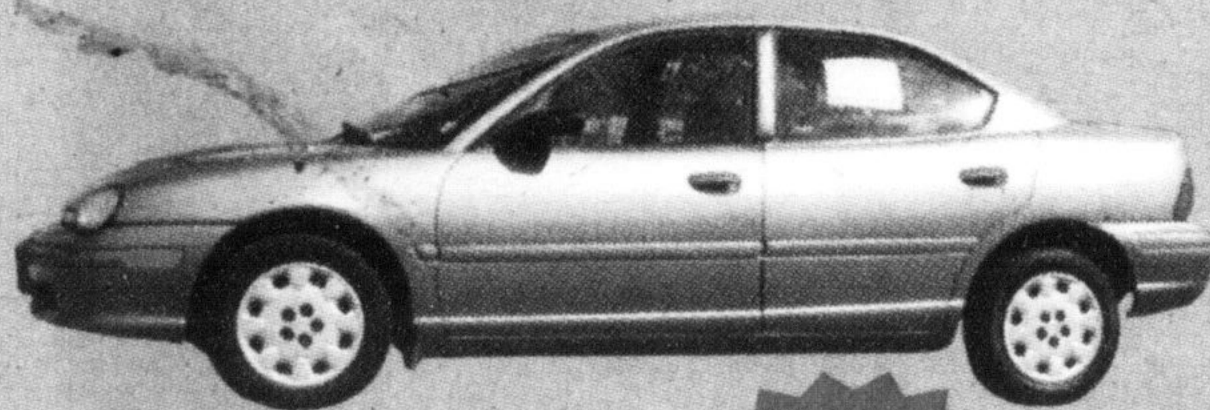
1999 Neon Platinum, A/C, auto, 4 dr., 56,000 km REDUCED TO CLEAR $9,995