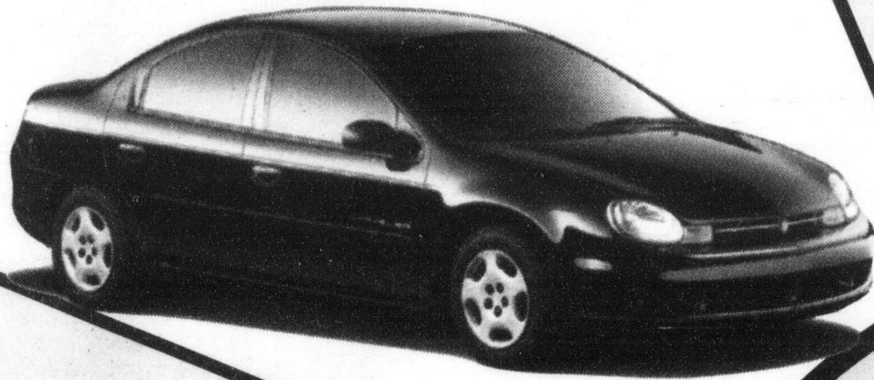
Chrysler Neon 2002