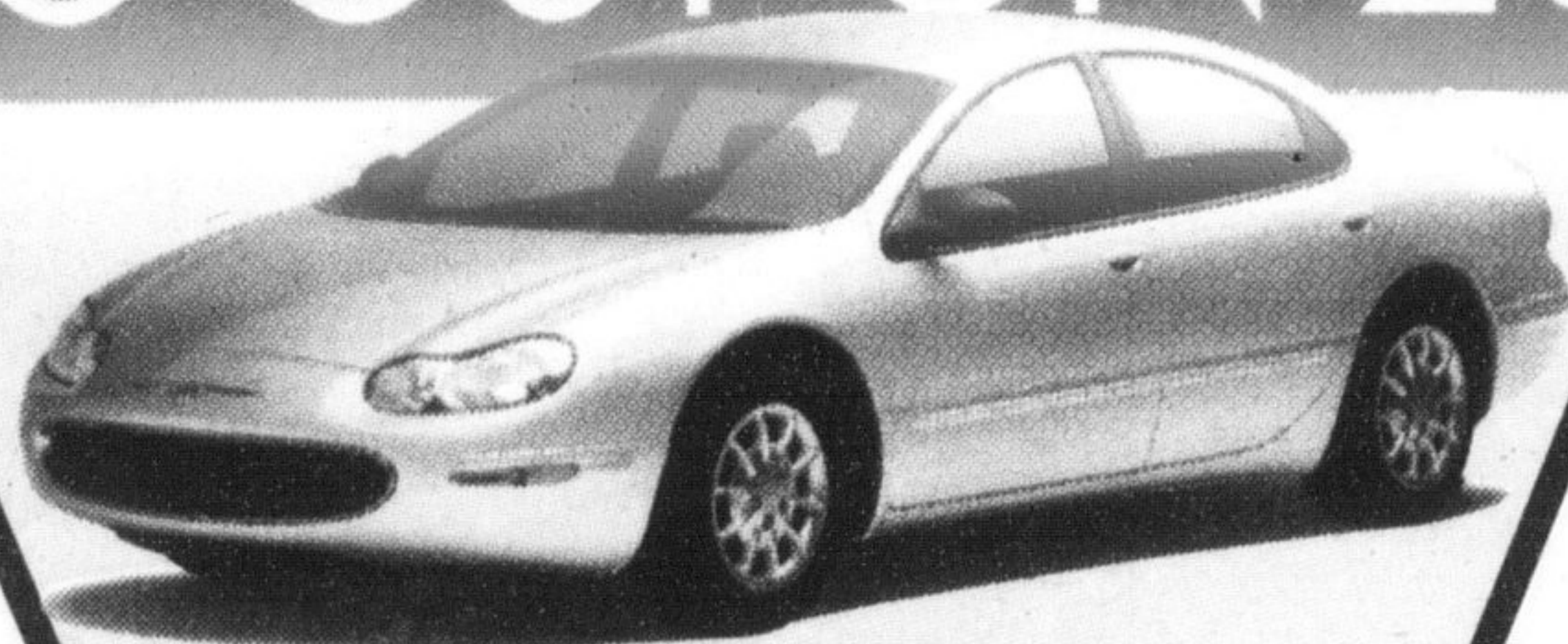
Chrysler Concorde LX 2002