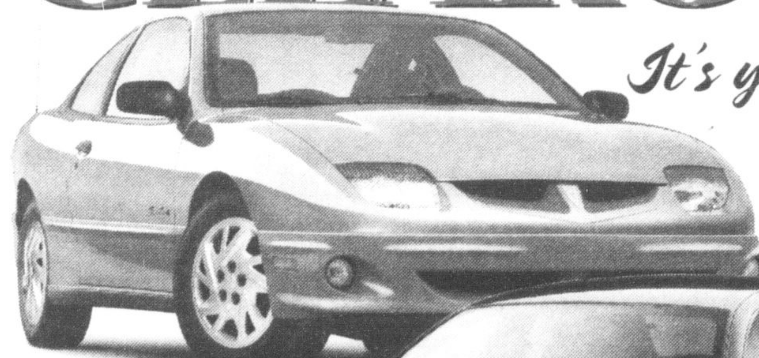
Sunfire SL Coupe