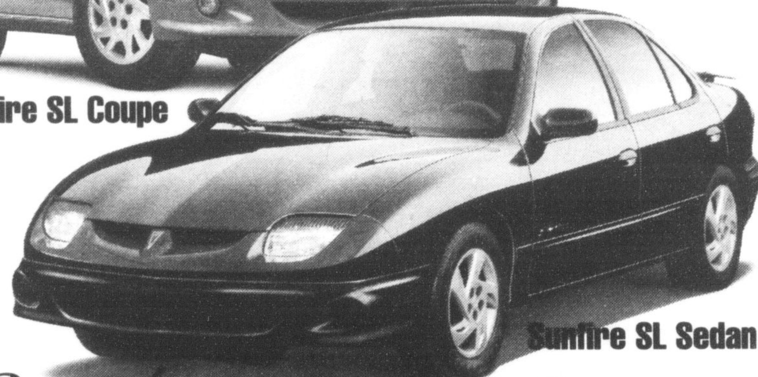
Sunfire SL Sedan