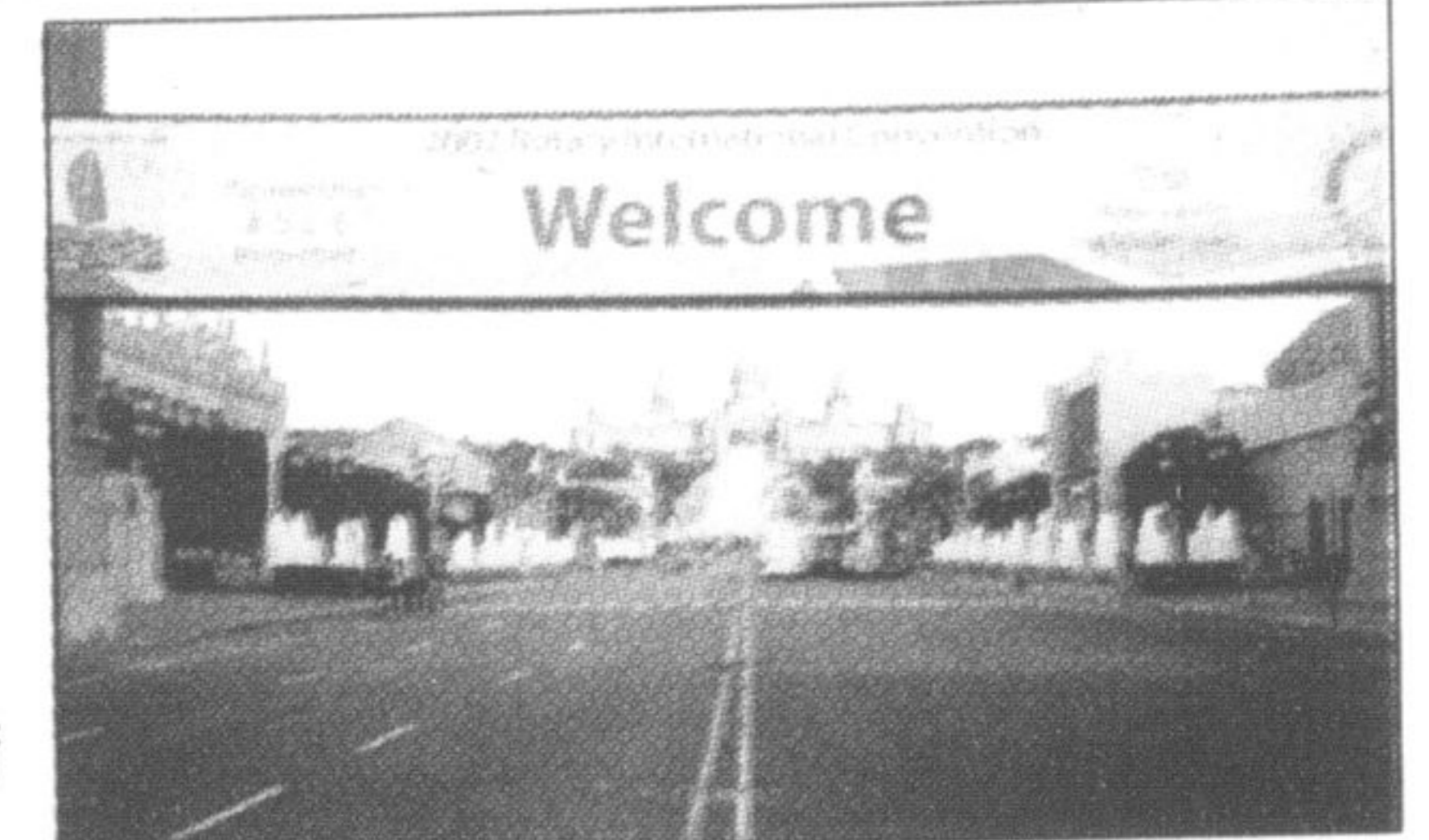
Milton goes to the Rotary Convention in Barcelona.