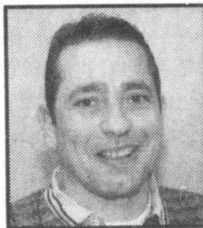
by GARRY TRENTON Denturist