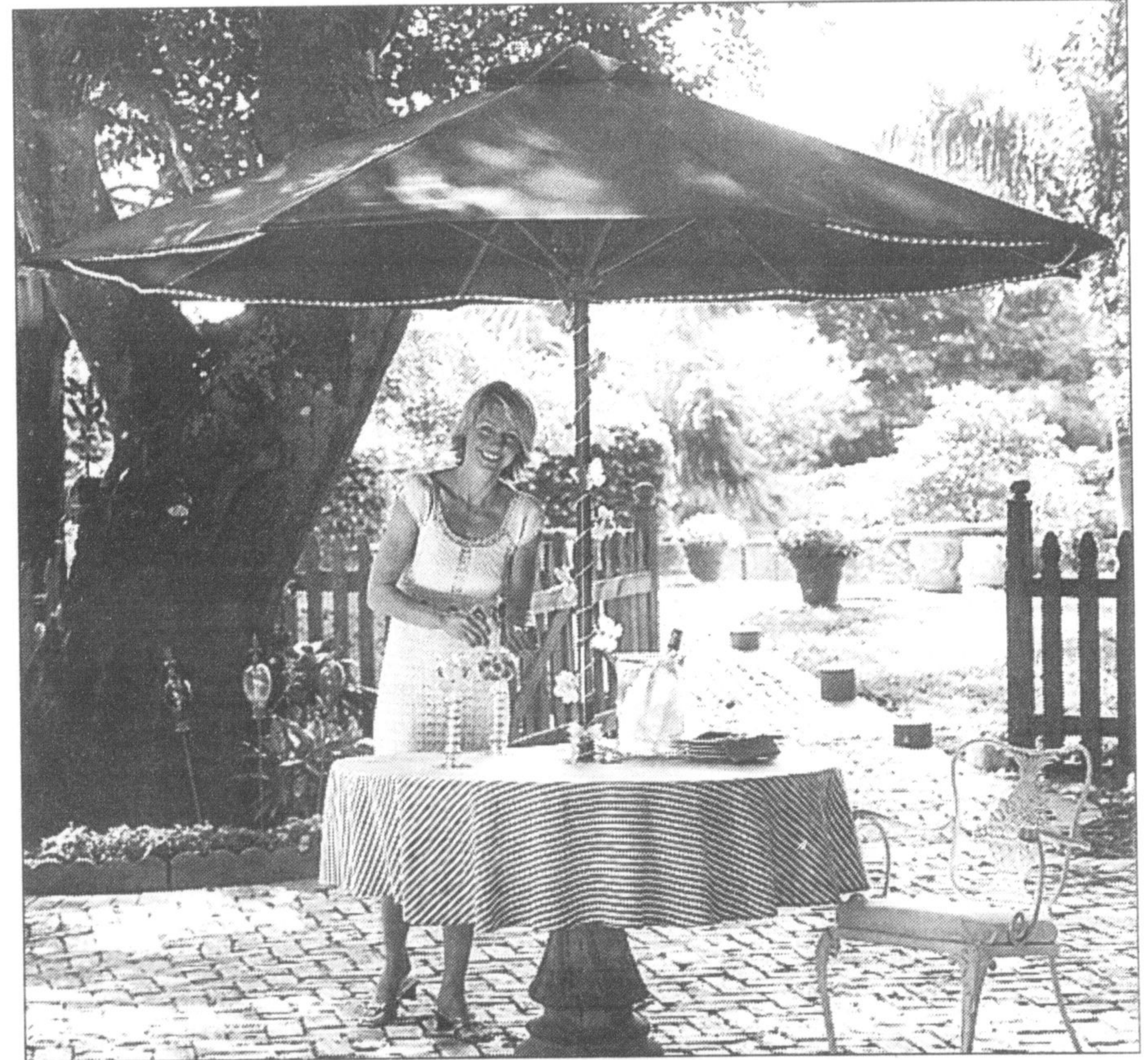
MAKE YOUR GARDEN PARTY the highlight of the summer with tips from Lillian Vernon and www.lillianvernon.com .