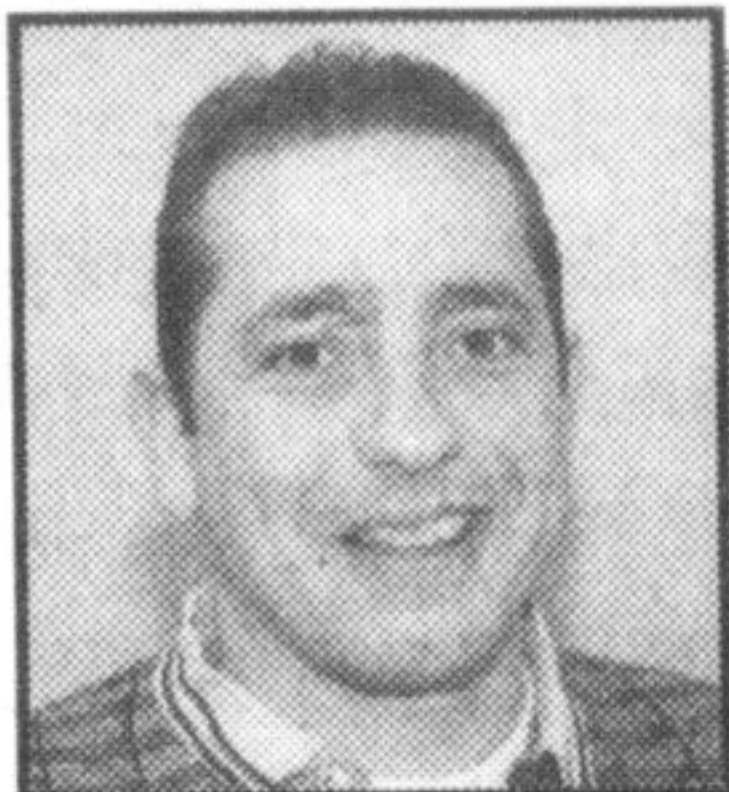
by GARRY TRENTON Denturist