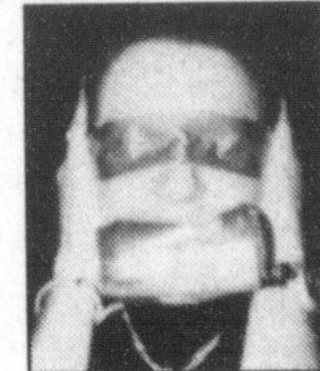
Frumious T. Bandersnatch

Word to our fizzle rizzles! It's Frizzle Tizzle Bizzlesnizzle! Y'all betta look out now, cuzze hizzle cozzle another dazzle drizzle! Enjoy ya bizzle swizzle fizzle gizzle rizzles! Fo' sheeze.