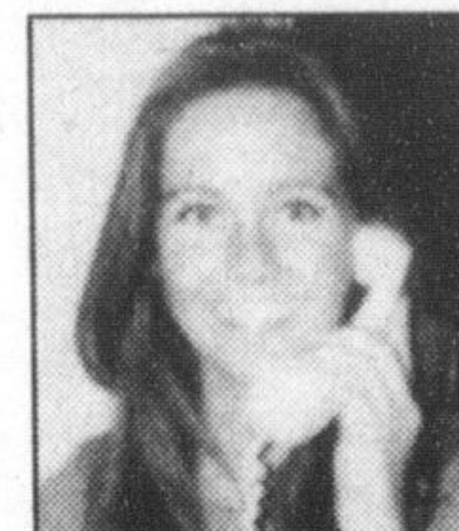
The Incendiary Jellotron