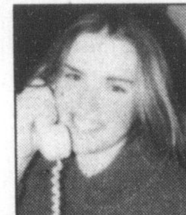
Papaya! Papaya! Papaya!