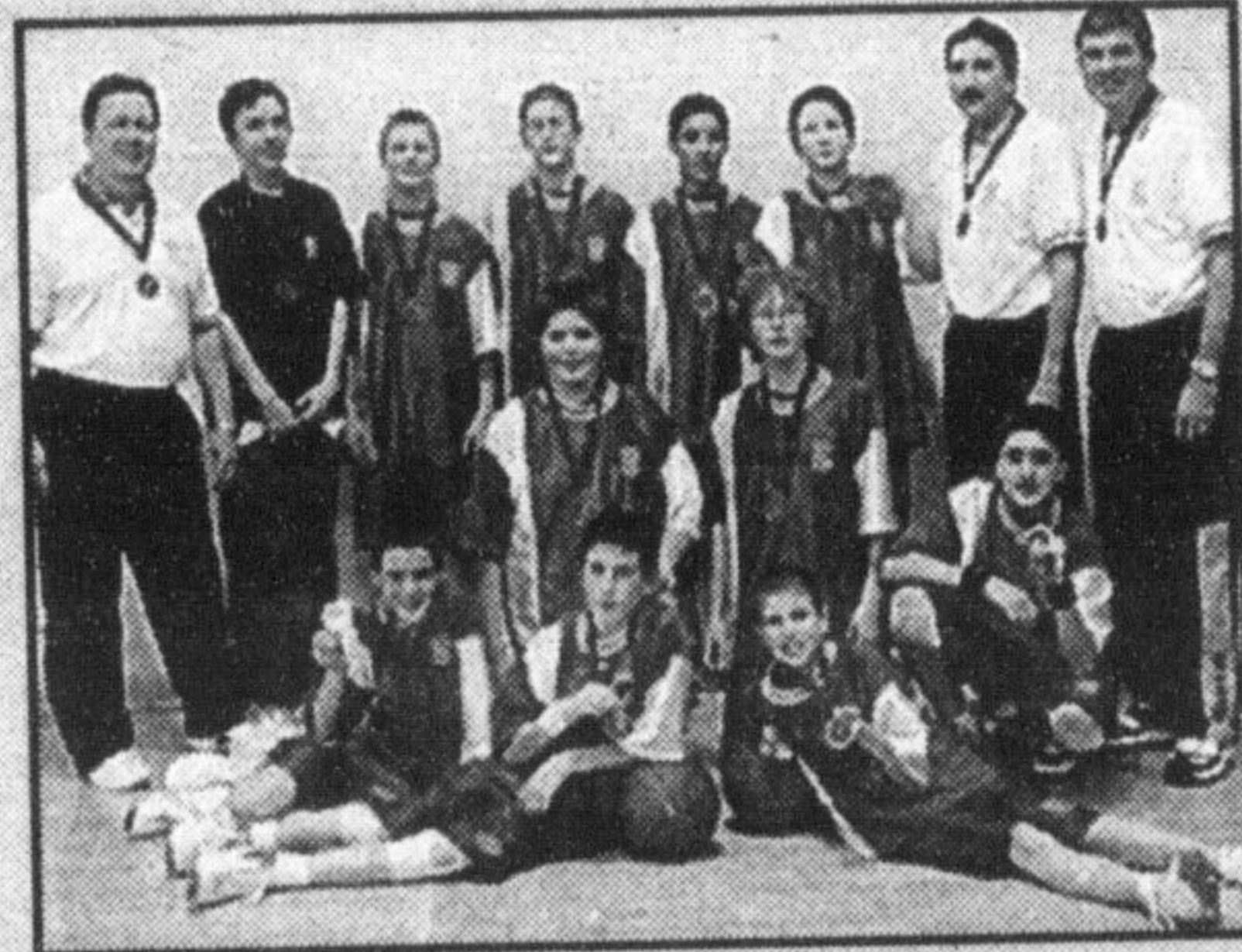
Milton's bantam boys basketball team proudly display the silver medals secured in Huntsville.

hosts — falling 48-38 — but had all sorts of problems with Caledonia and were pounded 44-12.