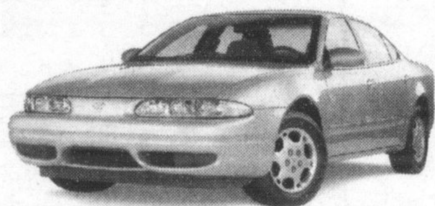
ALERO GX SEDAN BY OLDSMOBILE