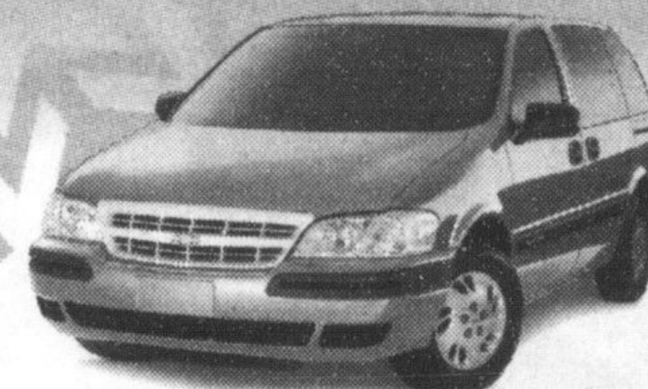
CHEVROLET VENTURE VALUE VAN