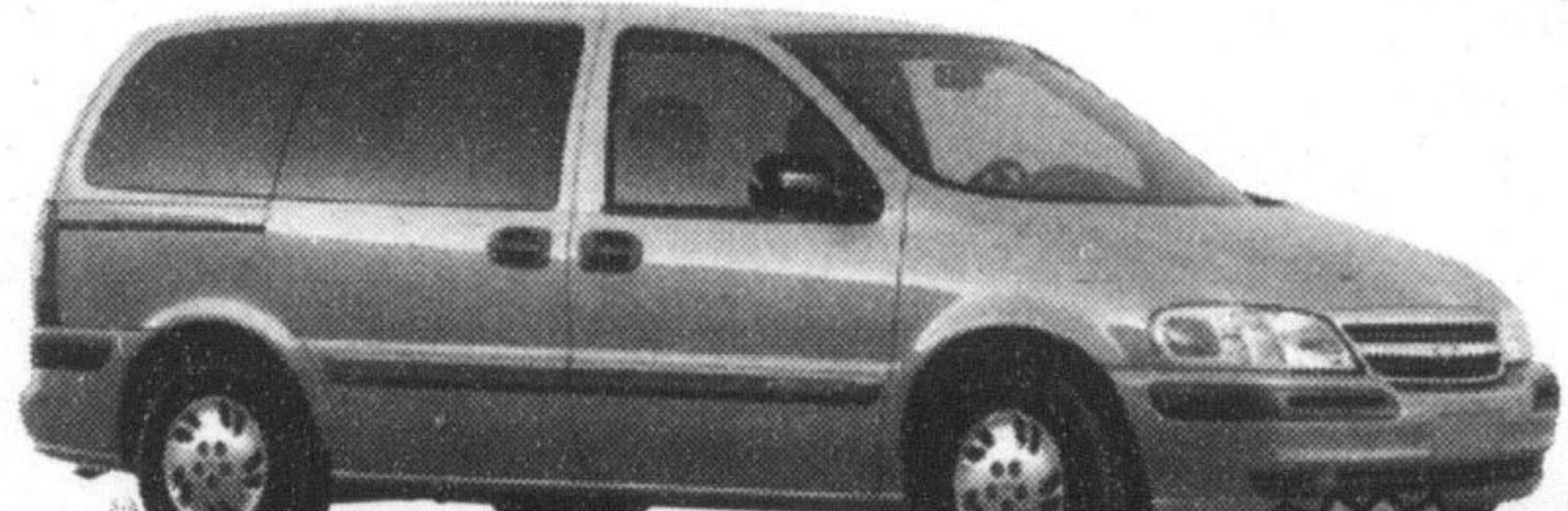
2001 VENTURE VANS