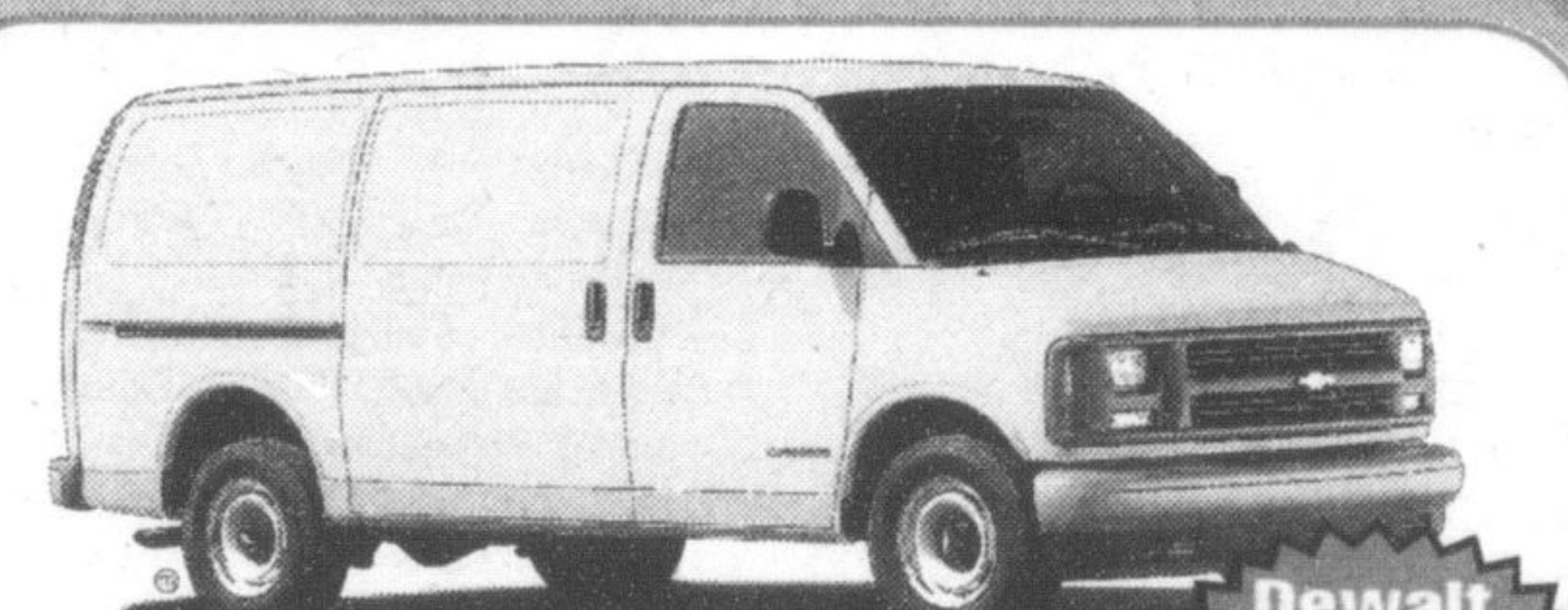
2001 EXPRESS CARGO VAN