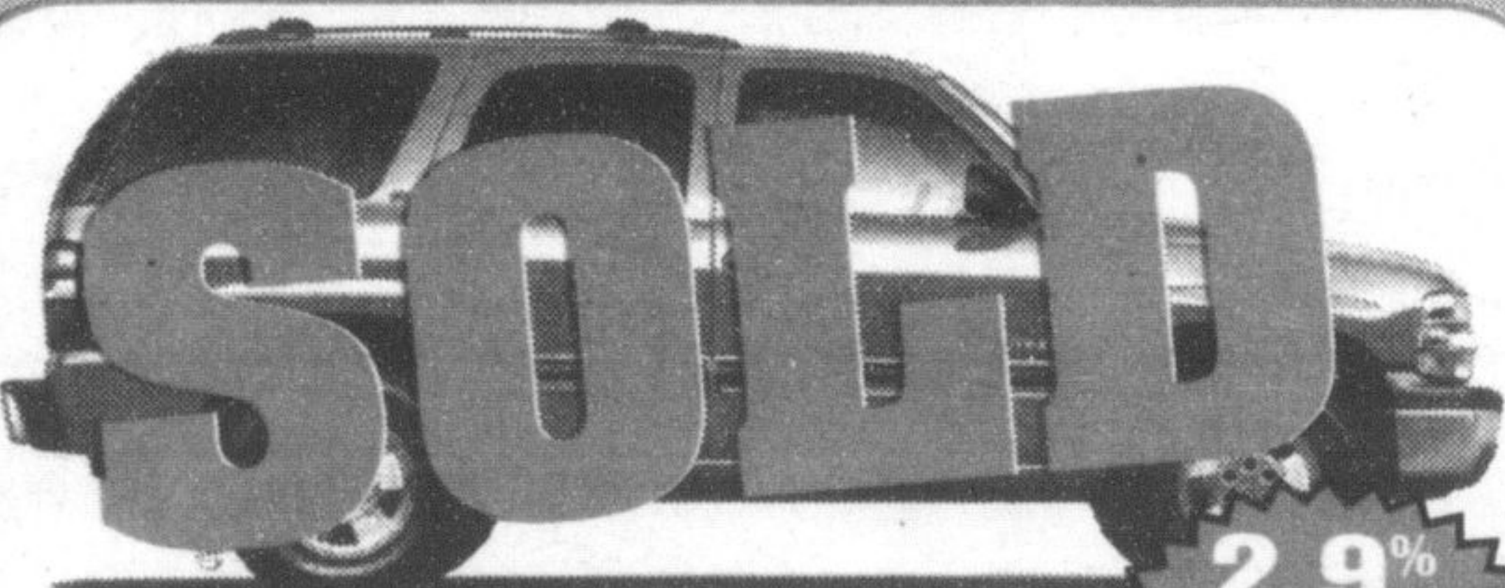
2001 TAHOE 4X4