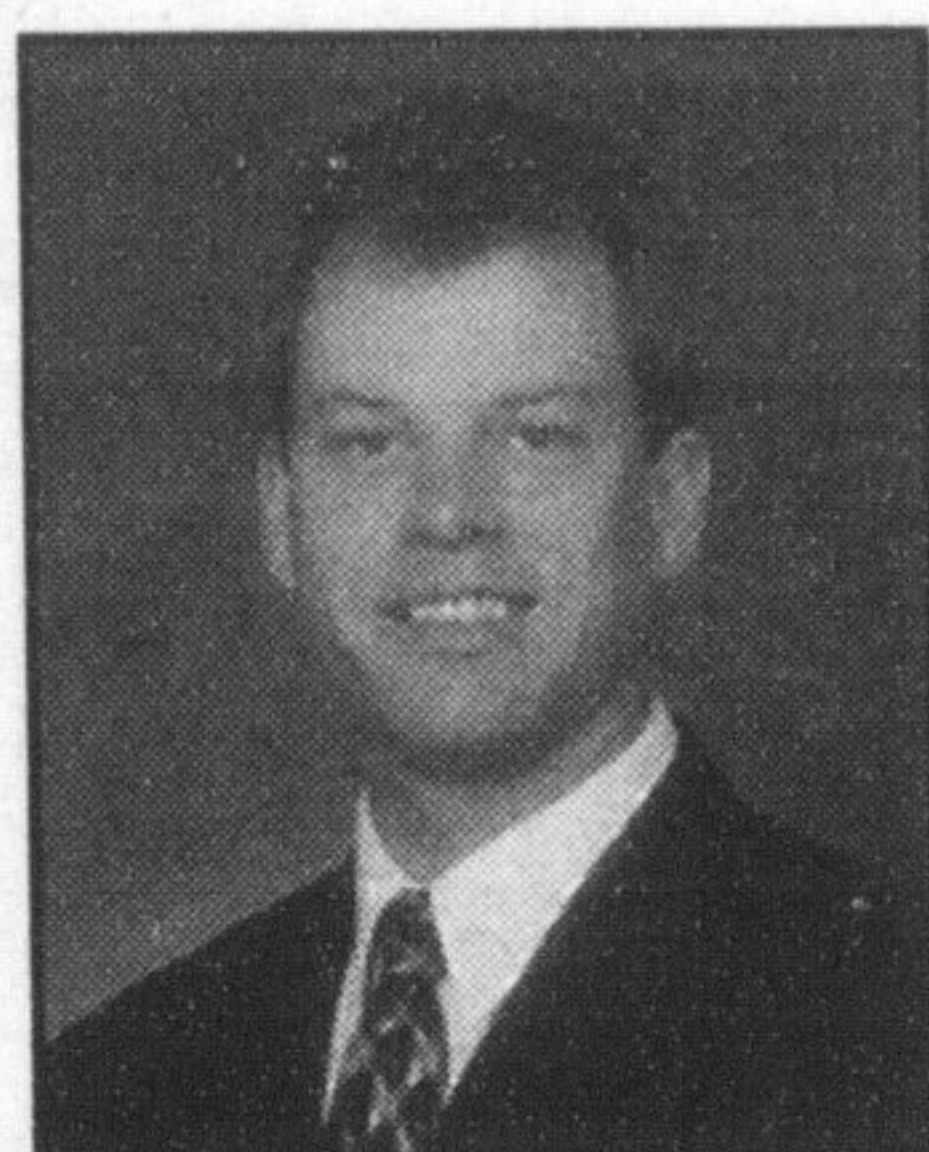
For a Personal Financial Consultation call: