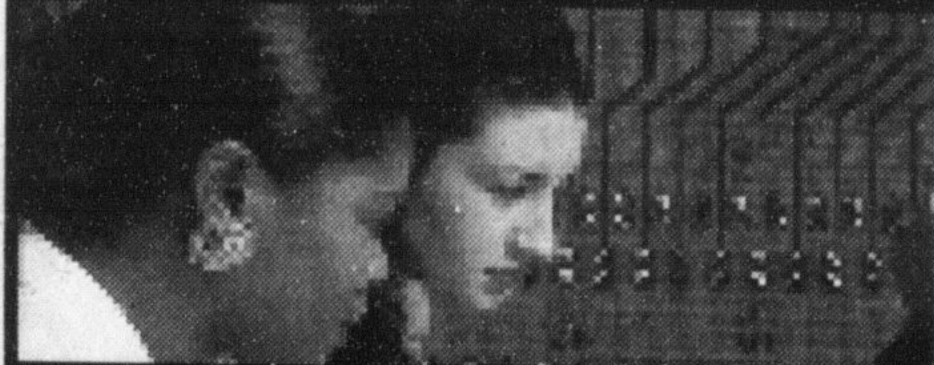
Halton District School Board

The Centre Skills Development & Training