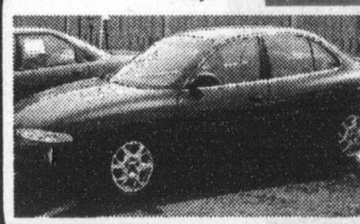
2000 Oldsmobile Intrigue