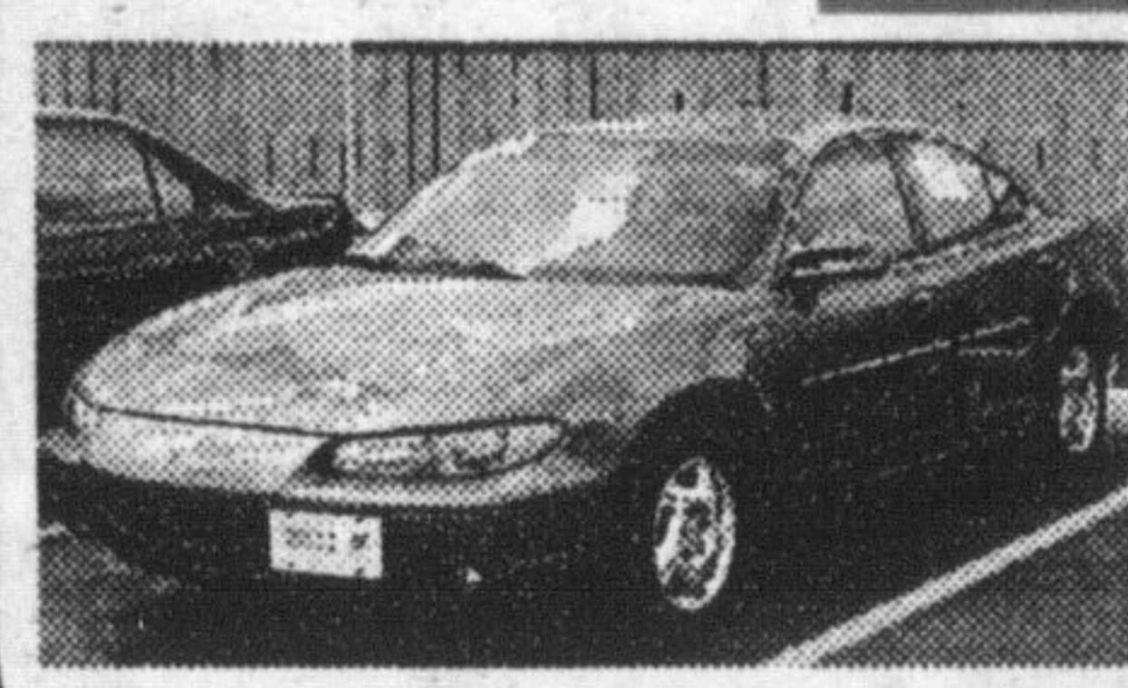
2000 Grand Prix