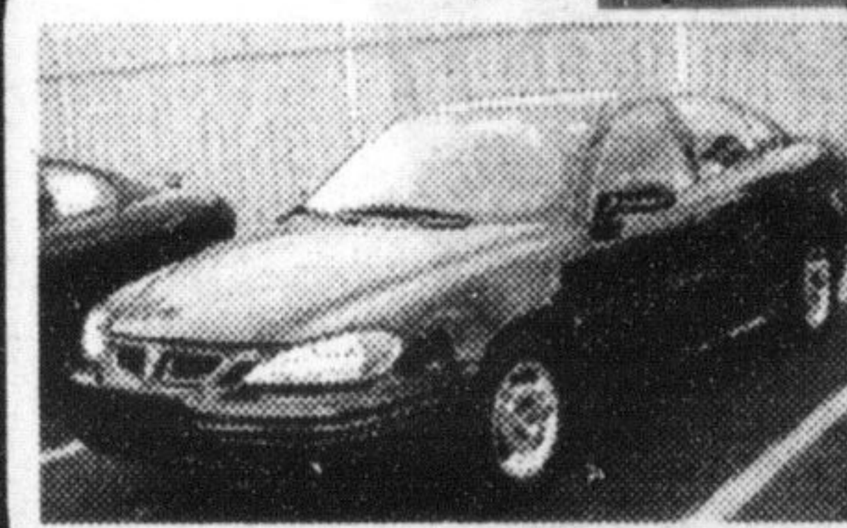
2000 Grand Am