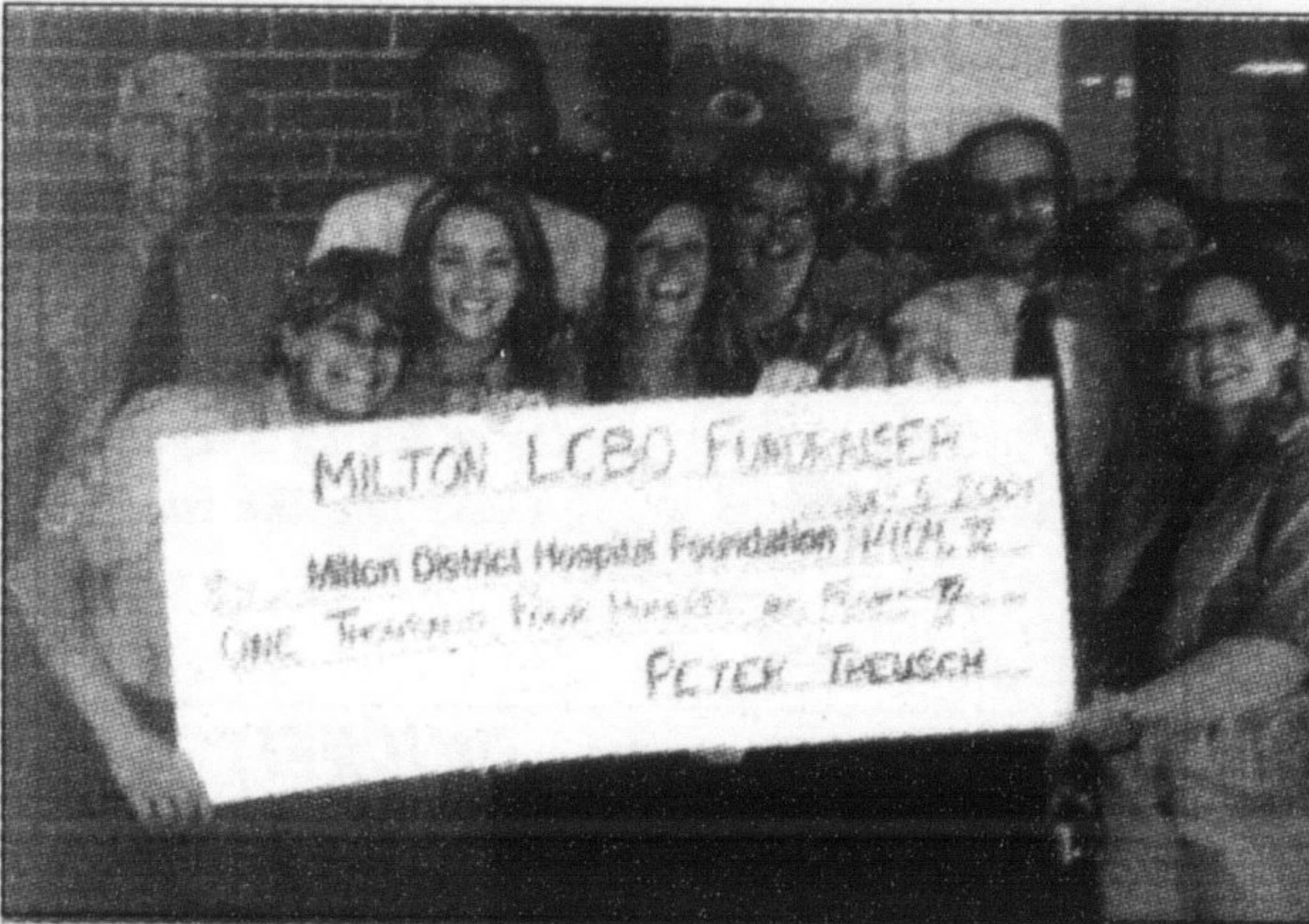
September 25th - FORE! - The MDHF 2nd