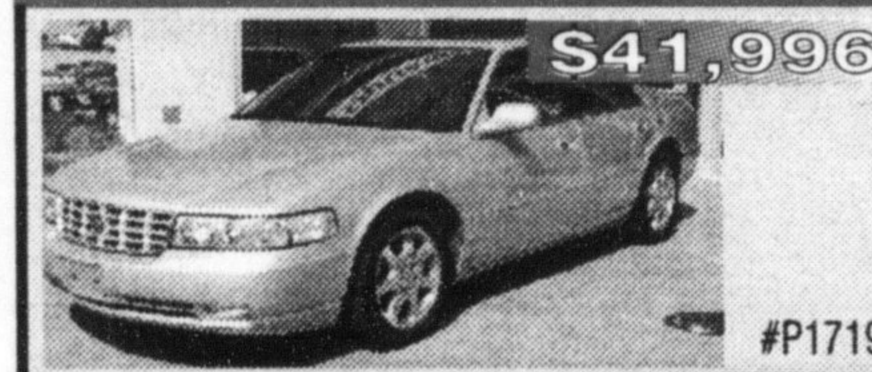
2000 Seville STS