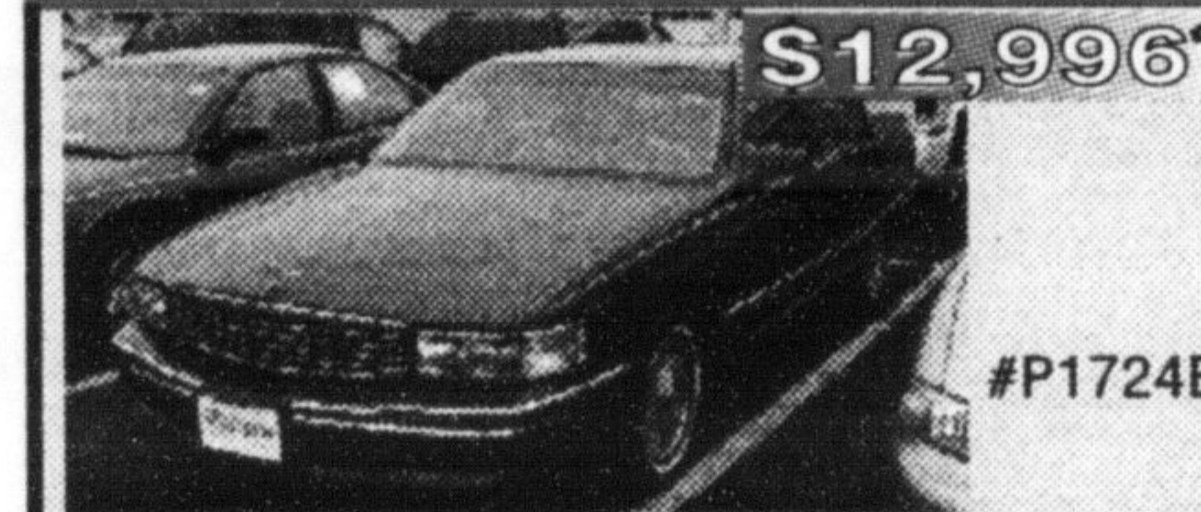
1994 Cadillac Sedan Deville