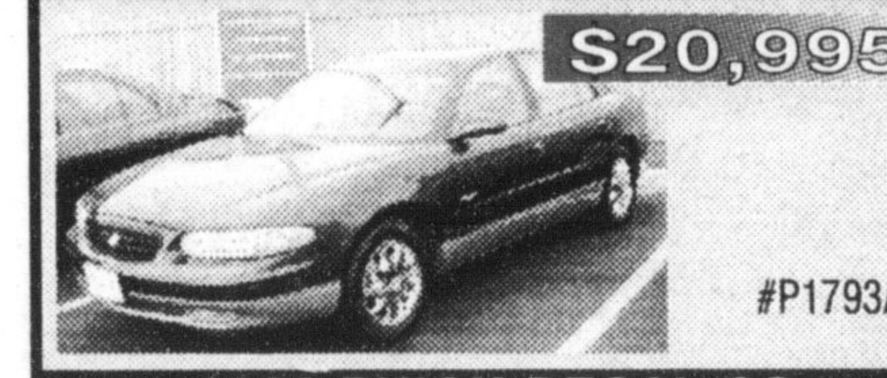
1998 BUICK REGAL GS