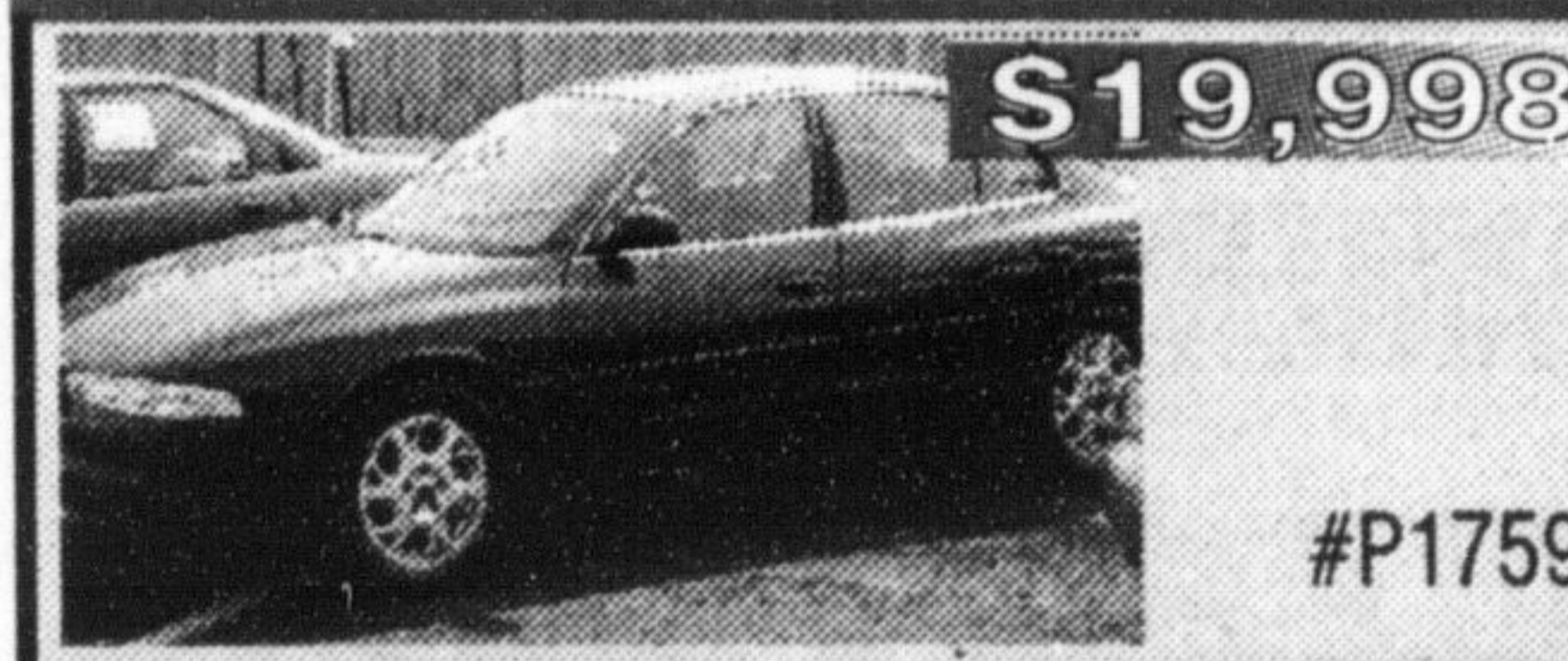
2000 Oldsmobile Intrigue