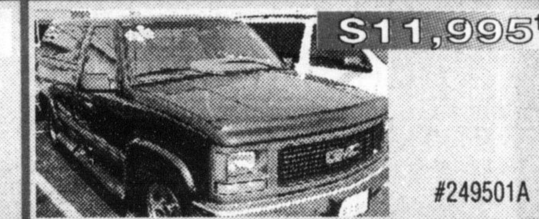
1996 GMC 1/2 Ton Pickup