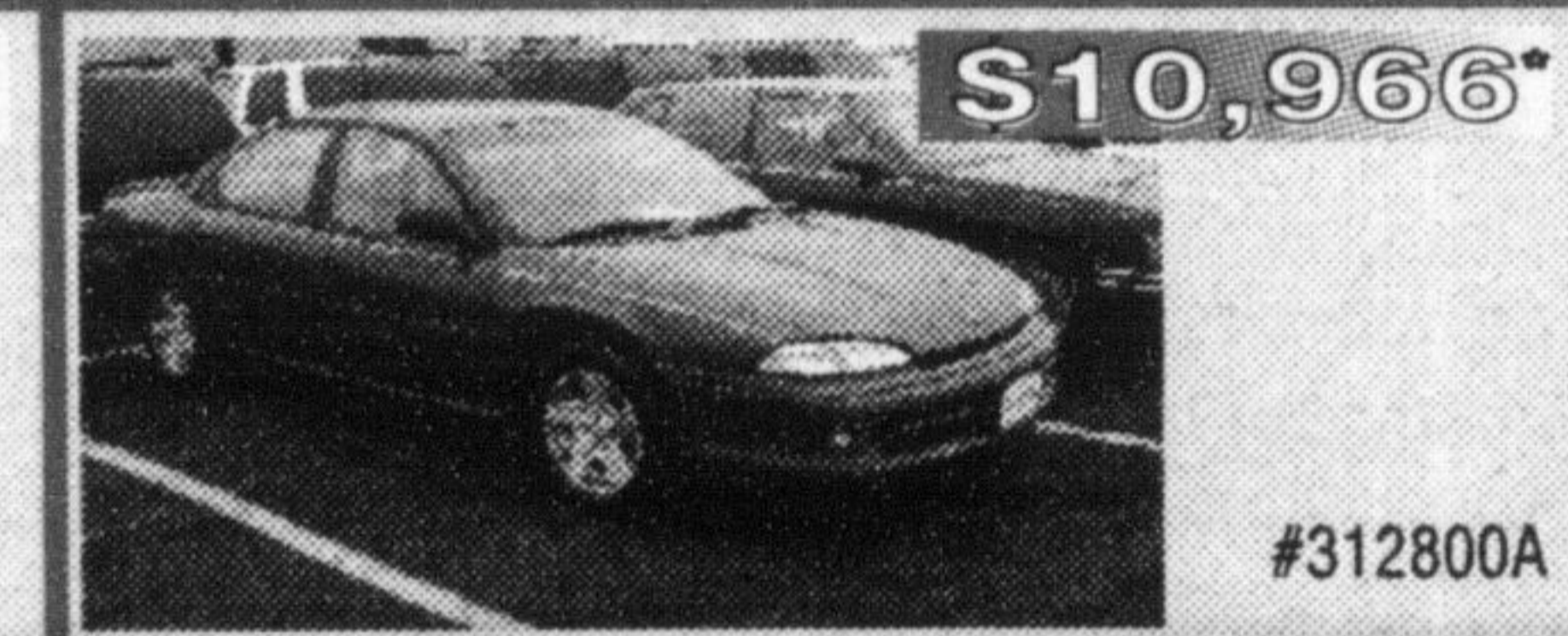
1996 Chrysler Intrepid