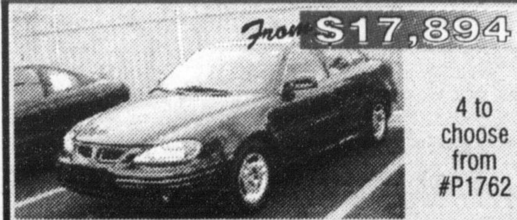
2000 Grand Am

6 mo. Powertrain Warranty with all Optimum Used Cars