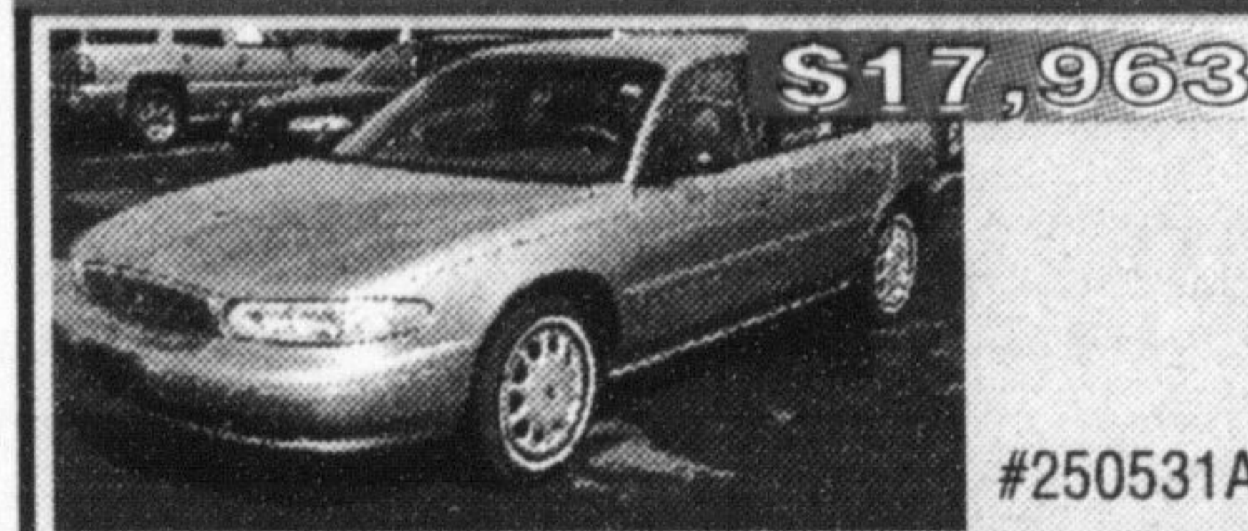
1999 Buick Century