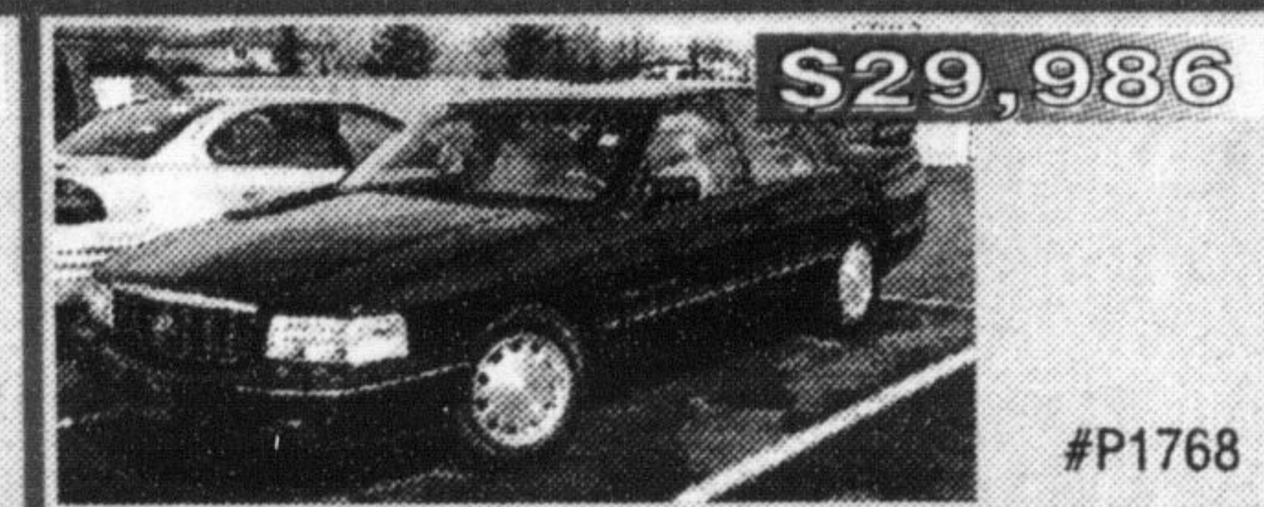
1998 Cadillac Concours