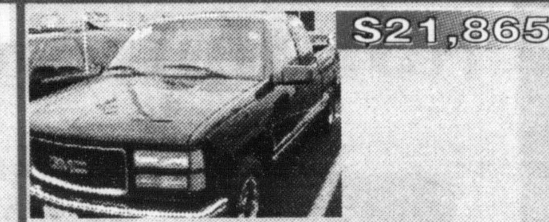
1998 SIERRA 1/2 TON PICKUP