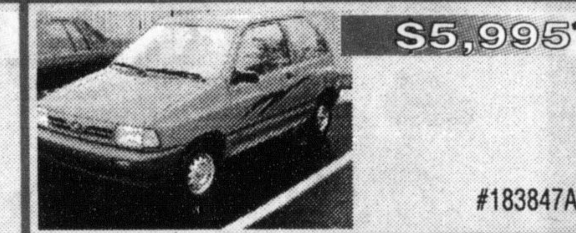
1993 Ford Festiva