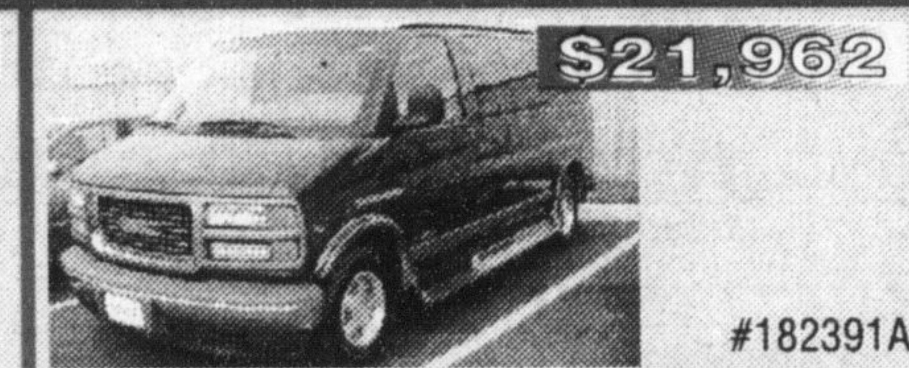
1997 Savana Pass. Van