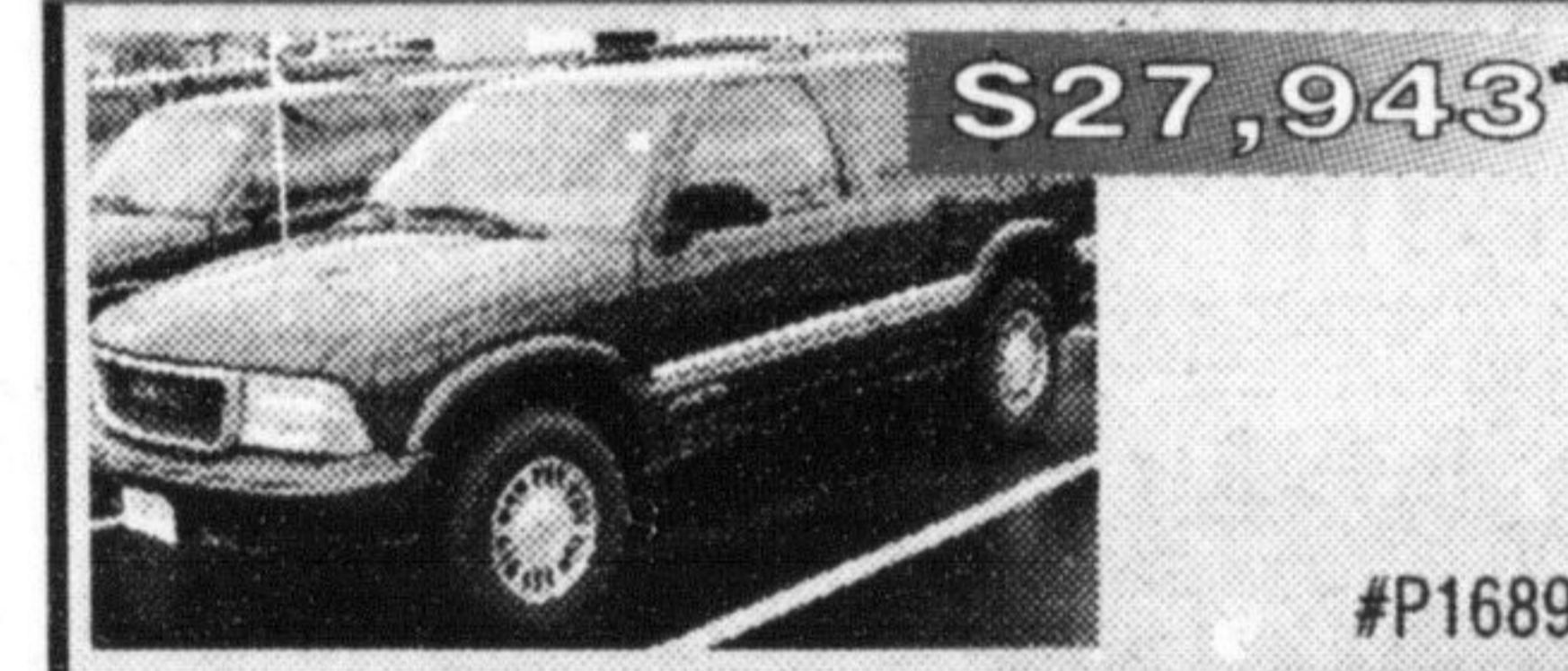
2000 GMC Jimmy