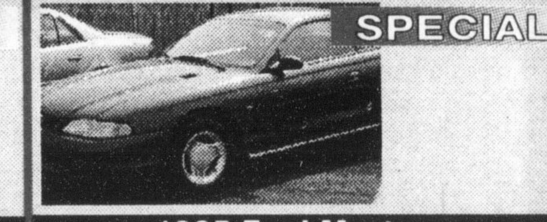
1995 Ford Mustang