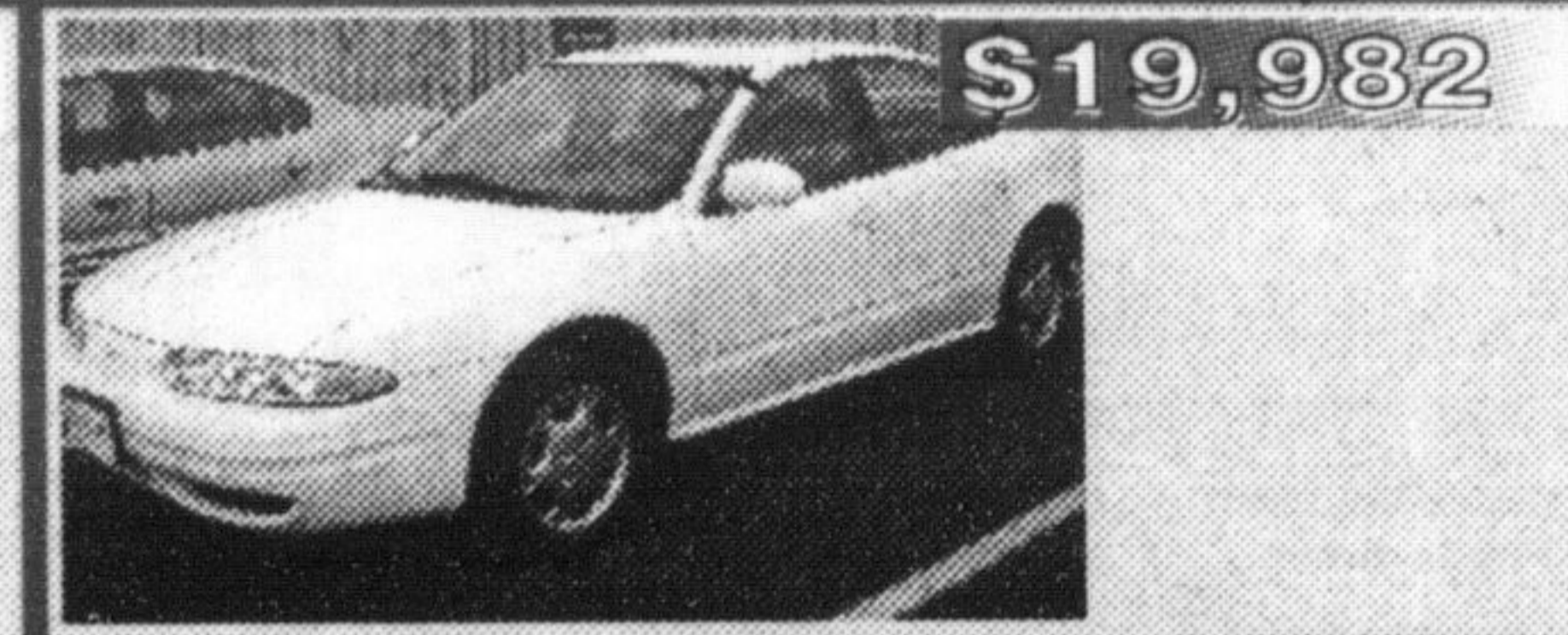
2000 ALERO GL