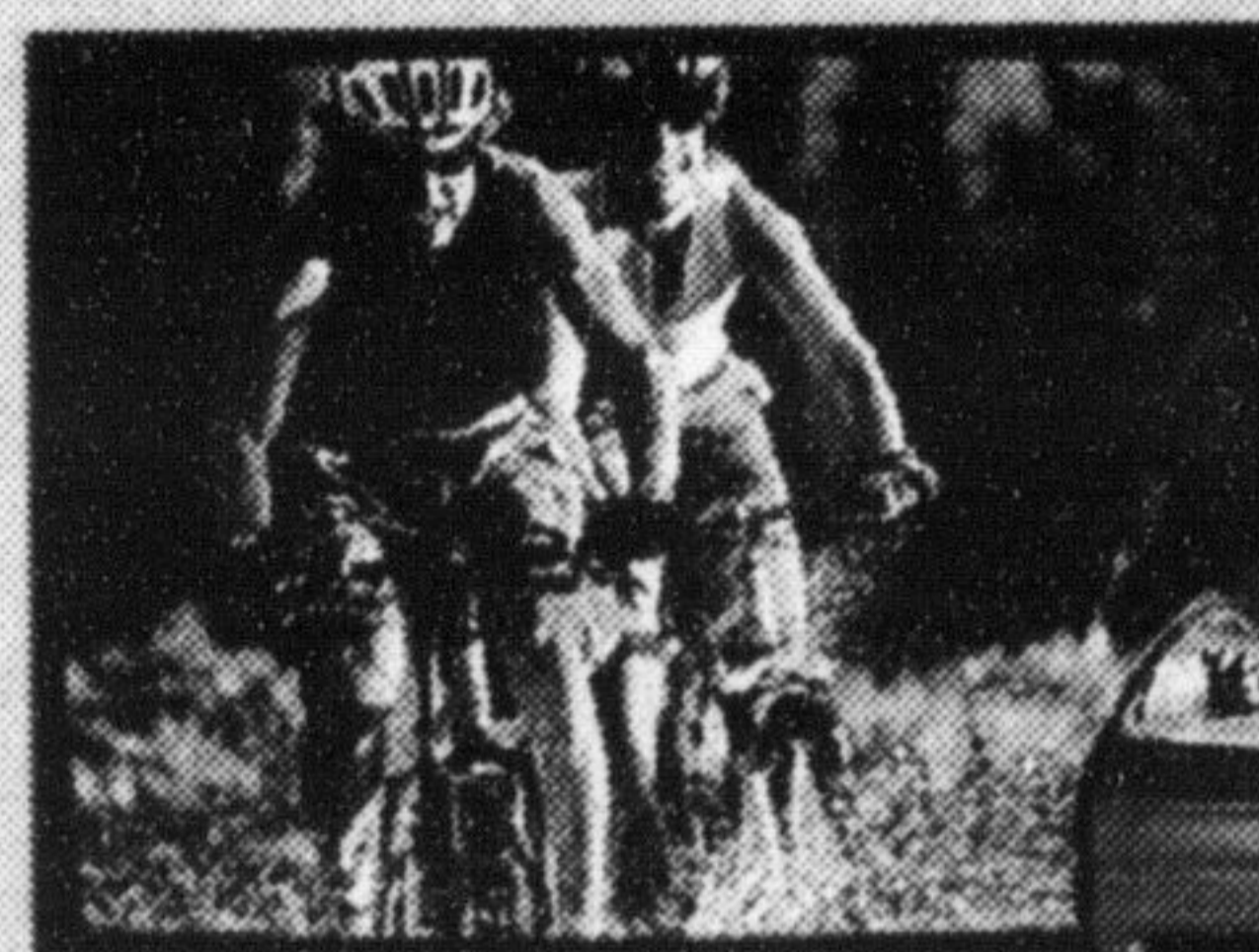
With air and CD player

The Taurus has earned five stars – the highest possible U.S. Government crash test rating – for front impact for both driver and front passenger – three years in a row. ††