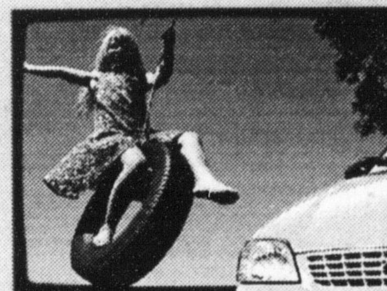
With personal safety system*