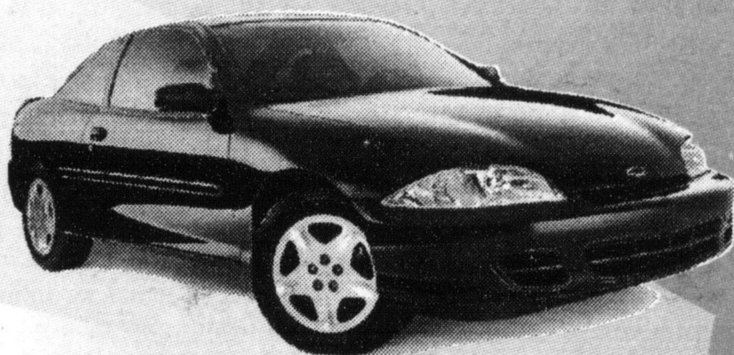
2001 Chevrolet Cavalier