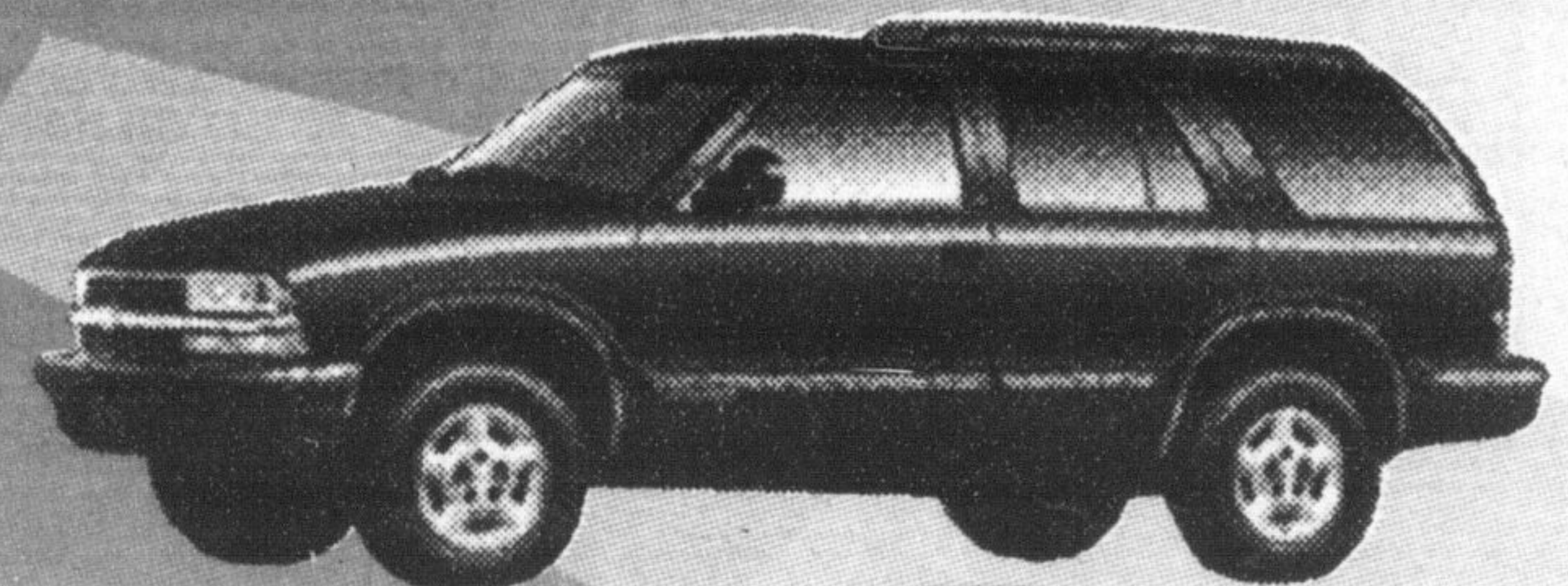
2001 Chevrolet Blazer

Ask us about your chance to save $10,000 Valid on Chevrolet vehicles only Until June 9/01