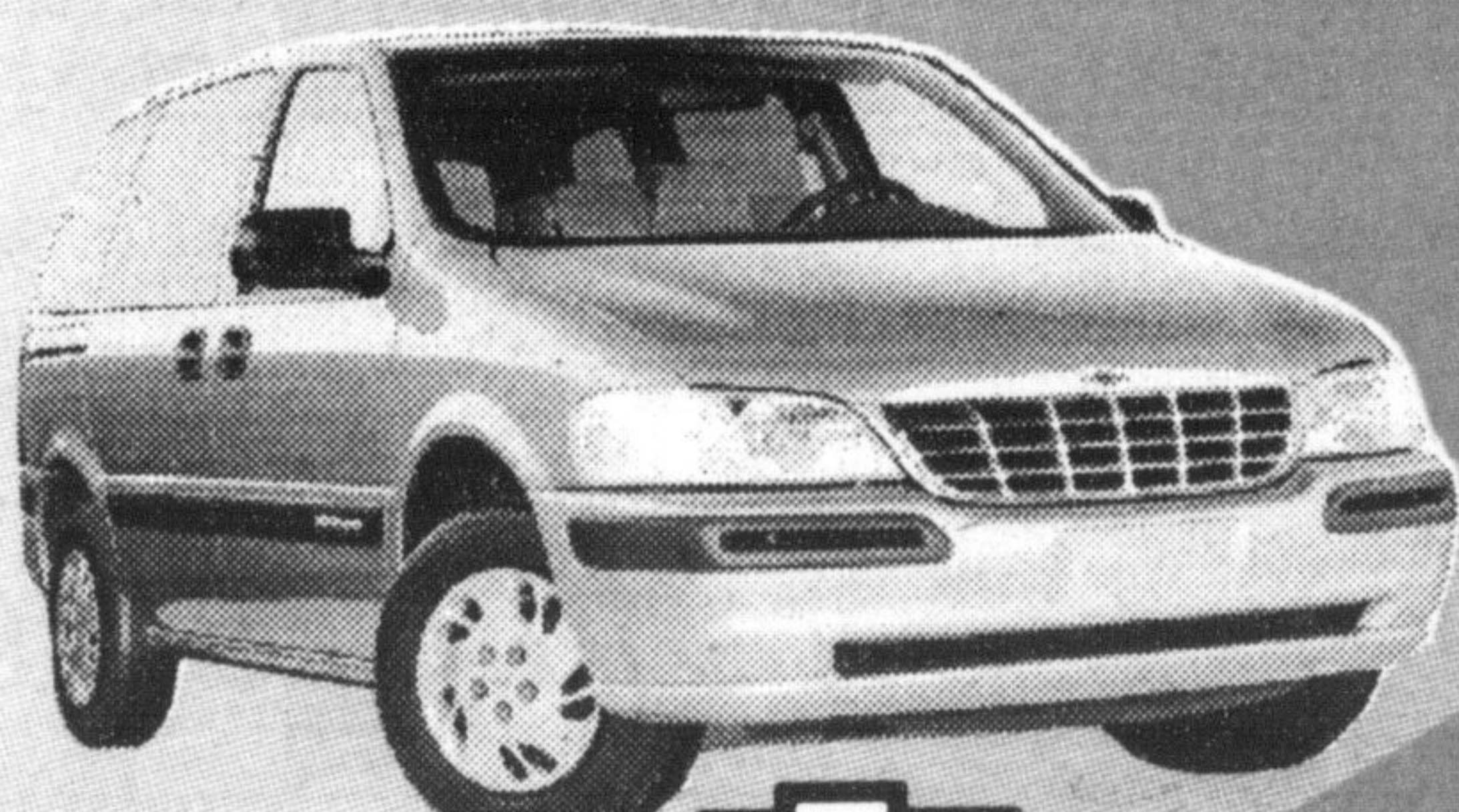
2001 Chevrolet Venture Van