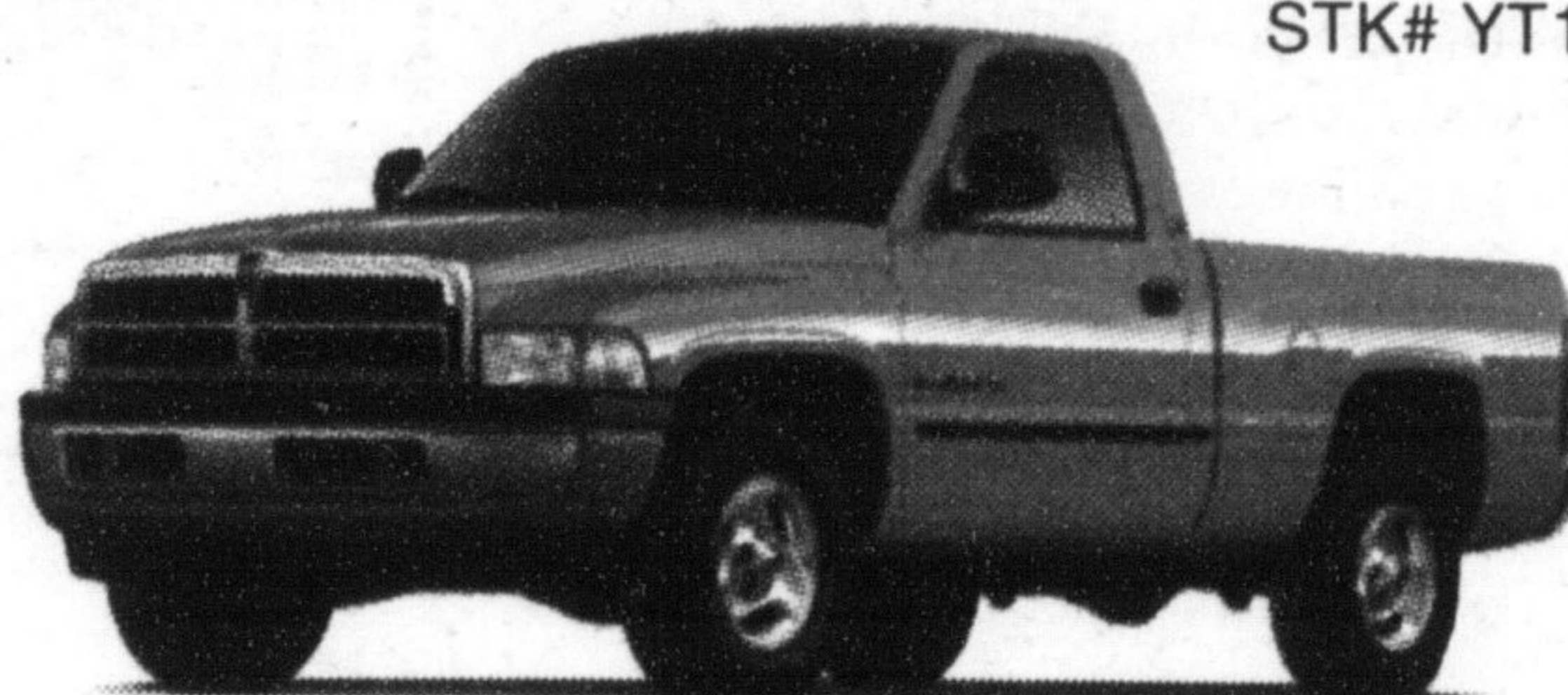
2001 1500 REG. CAB 2WD STK# YT170

Air conditioning, chrome wheels, anti-spin differential, HD service group, 5.2L SMPI V8, tilt, cruise control, 4 spd. automatic transmission, 2-tone paint