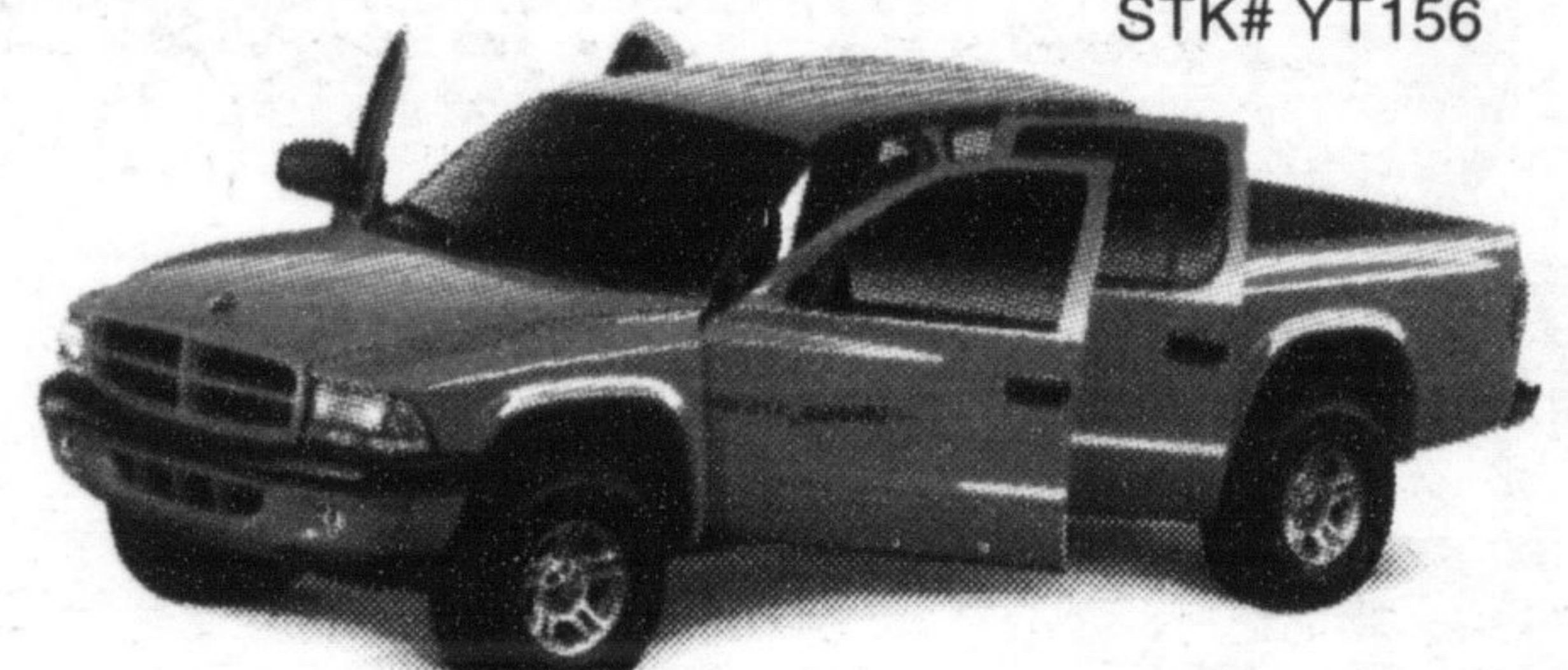
2001 DAKOTA CLUB CAB STK# YT156

"Sport Plus Group", 6 cyl., 3.9L SMPI V6, air conditioning, tilt, cruise control, sliding rear window, next generation air bags.