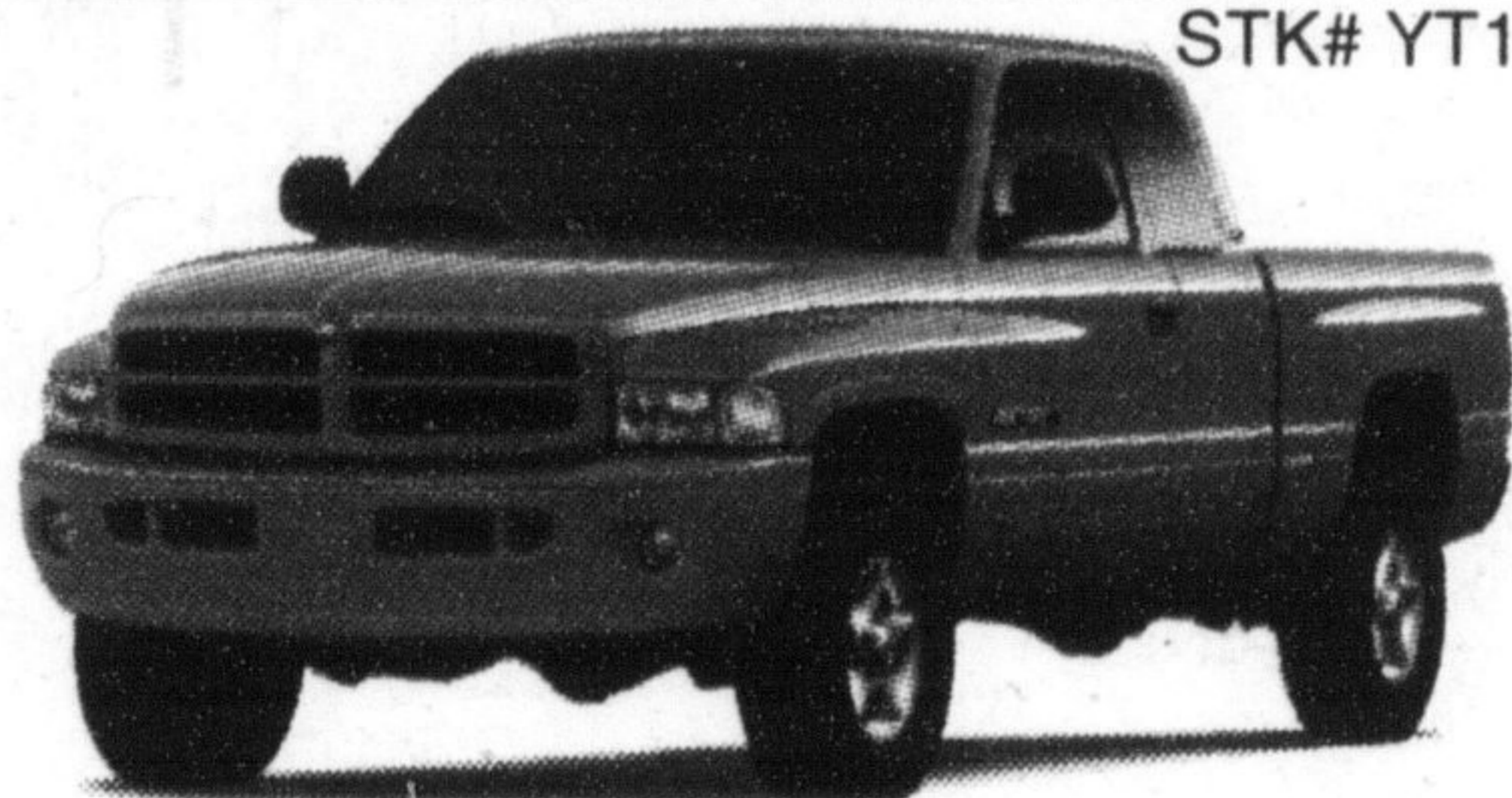
2001 1500 QUAD ST. 2WD STK# YT176

Air conditioning, chrome wheels, power heated mirrors, anti-spin differential, 5.2L SMPI V8, tilt, cruise control, 4spd. automatic transmission