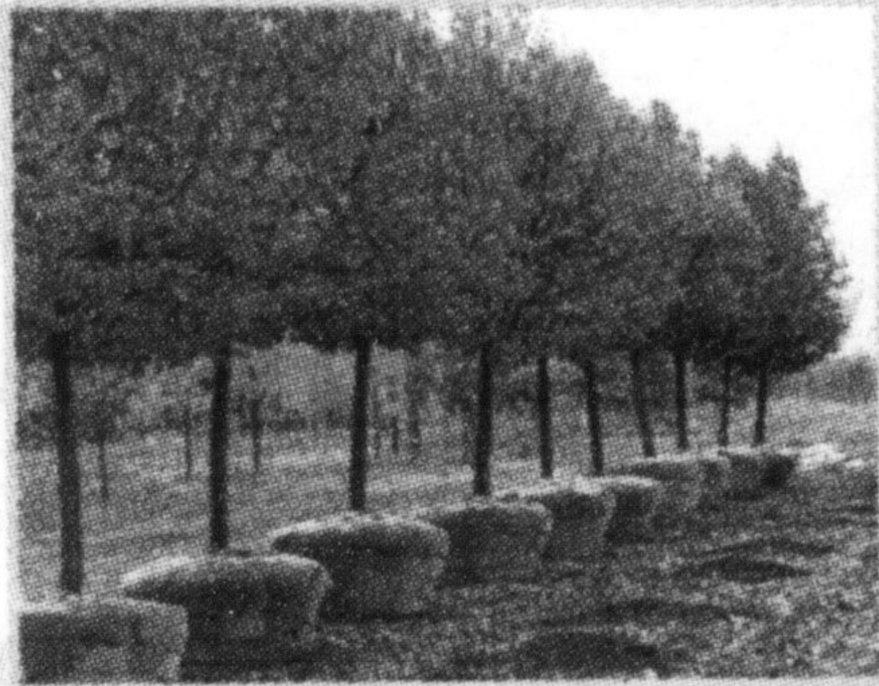
Instant Shade Trees up to 20 ft. freshly dug