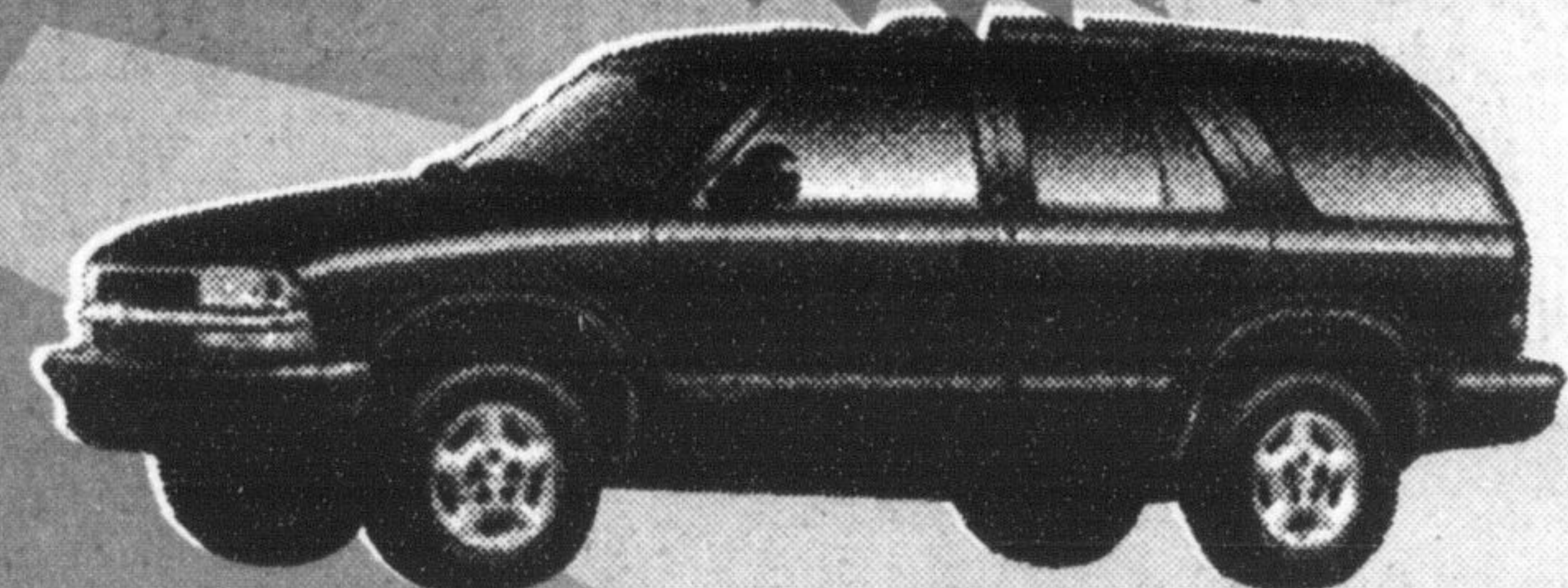
2001 Chevrolet Blazer

*O.A.C. See dealer for details. *Selected Models.