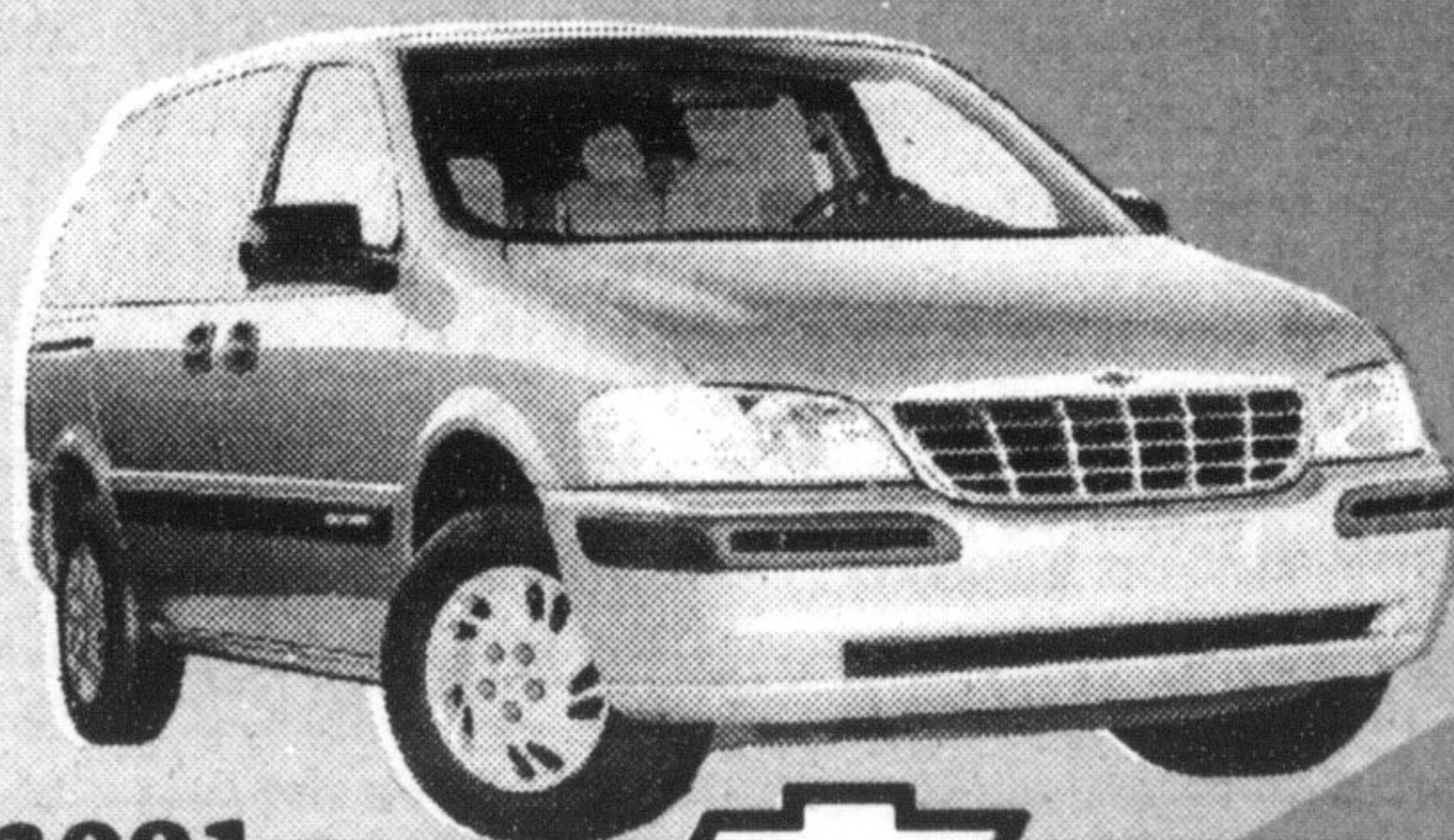
2001 Chevrolet Venture Van