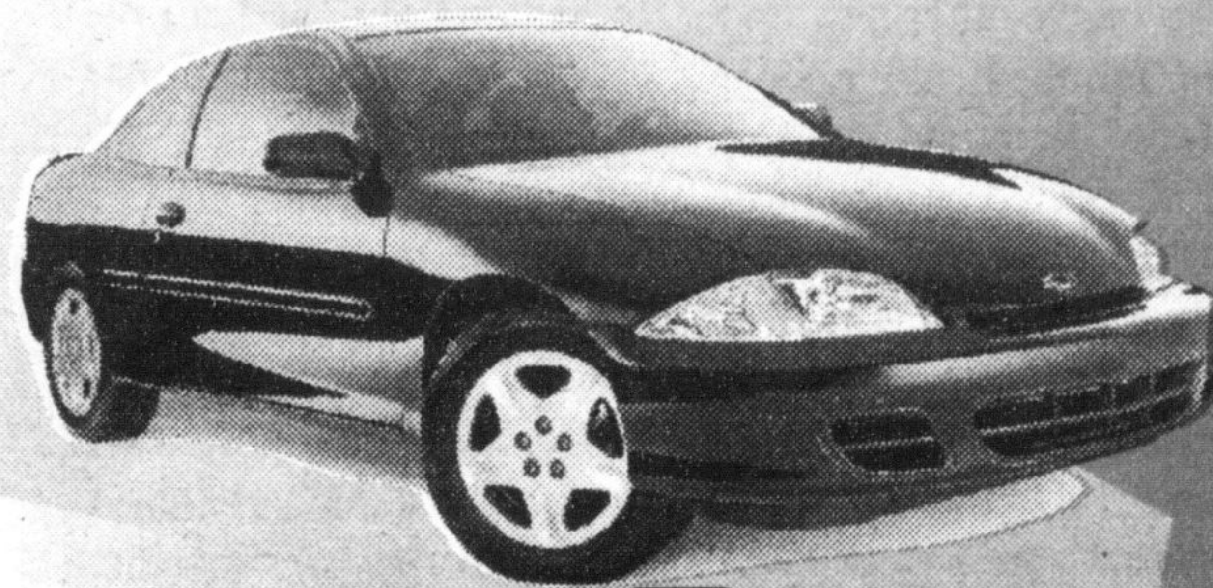
2001 Chevrolet Cavalier

Thanks for making our TENT EVENT a HUGE SUCCESS!