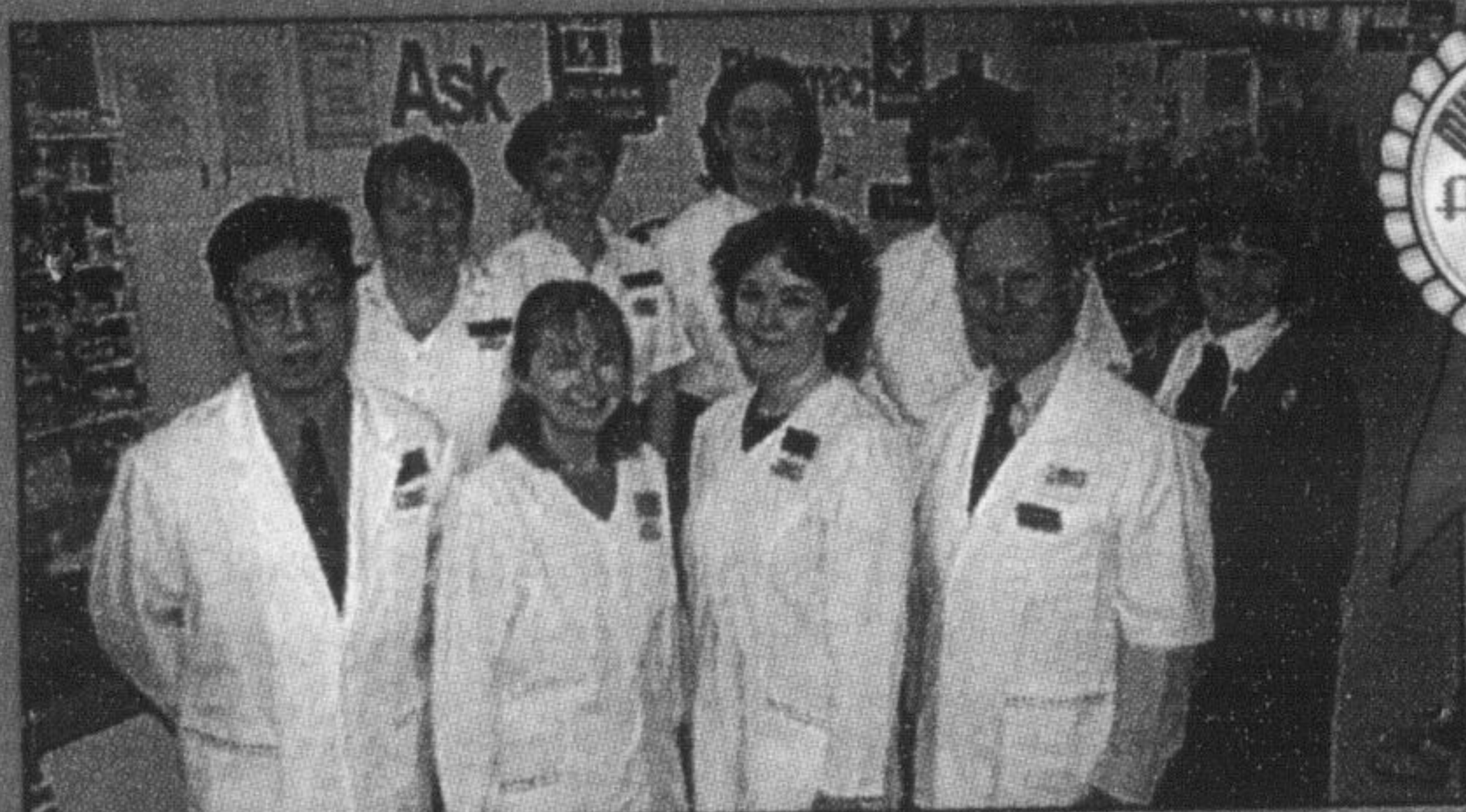
Your Pharmacy team is waiting to serve you. Home of Health Watch. Open to midnight, 7 days a week.