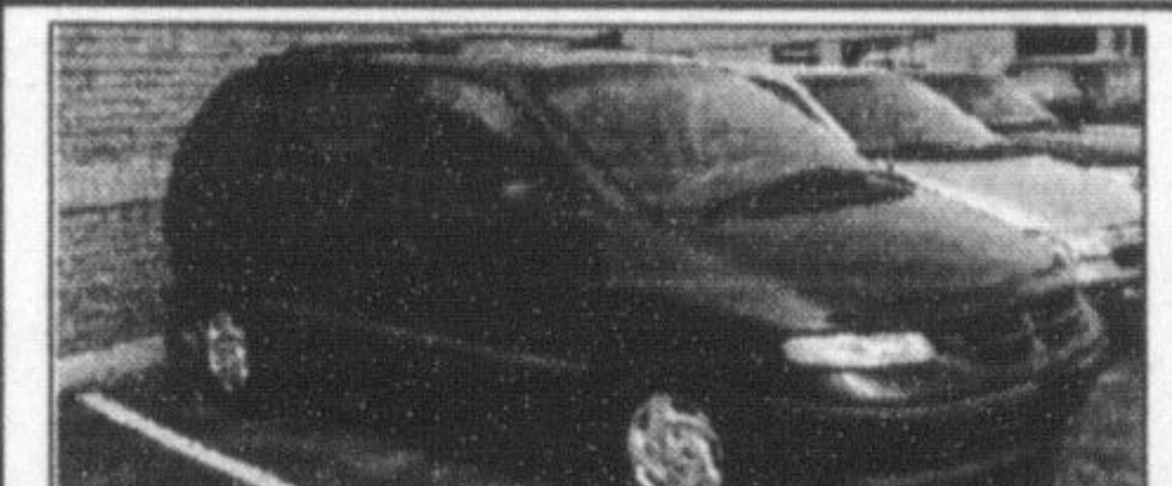
1996 DODGE CARAVAN SE

3.0L, V6, vineyard grey/grey inter., 4 dr, 7 pass., PW, PL, tilt, cruise, built in child seats, A/C. 104,000 km.