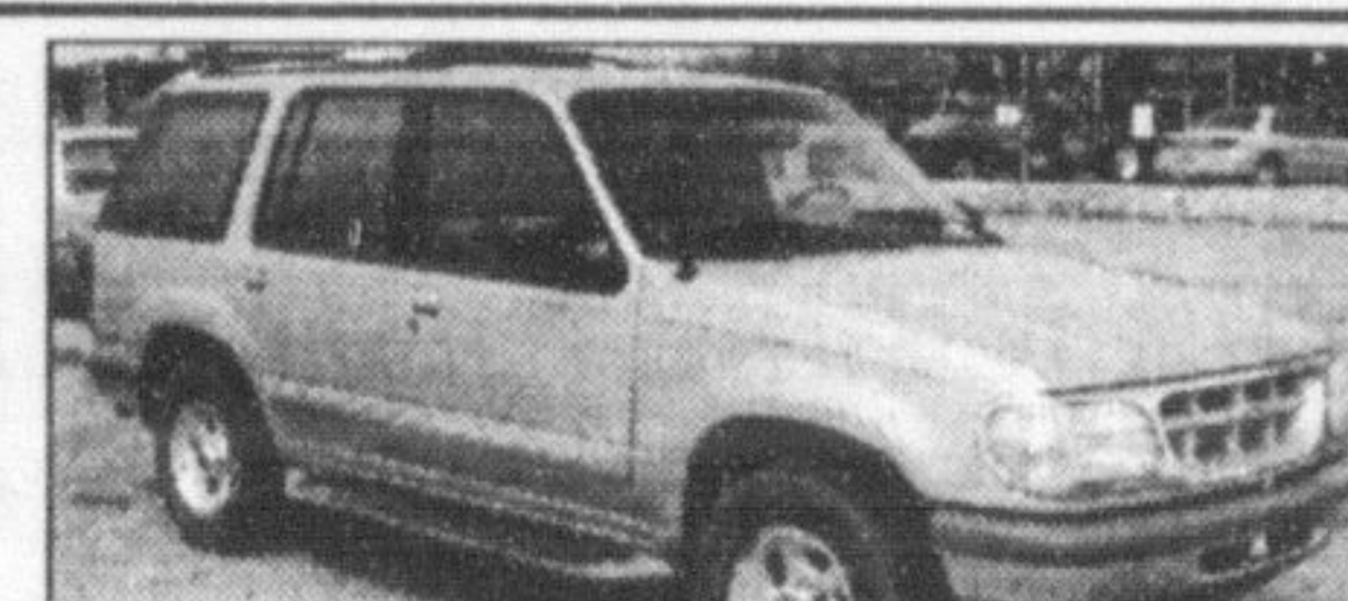
1996 FORD EXPLORER XLT

V6, auto, 4x4, 4 dr, champagne metallic/beige inter. PW, PL, tilt, cruise, A/C, alloy wheels, ABS, running boards, roof rack, 100,000 km.