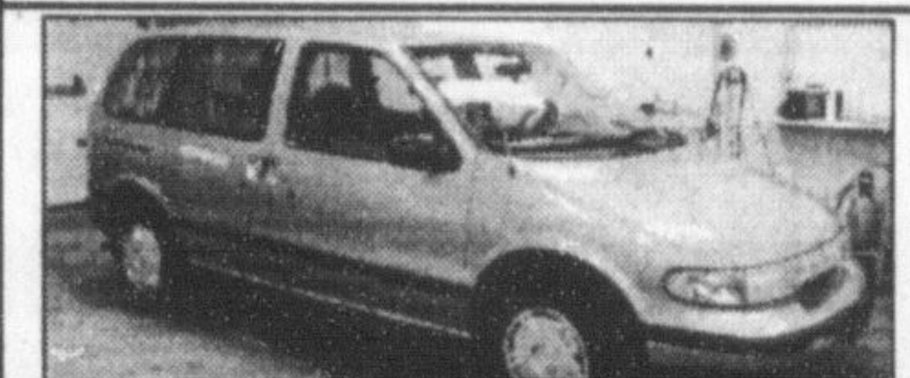
1995 MERCURY VILLAGER GS

3.0L V6, 7 pass, desert mist/grey int. PW, PL, tilt, cruise, AM/FM cass, rear radio controls, air, ABS and more. 106,000 km.