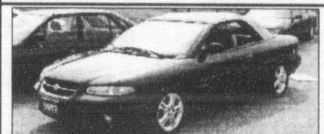
1997 CHRYSLER SEBRING JXI CONV.

2 dr, auto, dark green/tan leather, tan top. Loaded. 82,000 km.