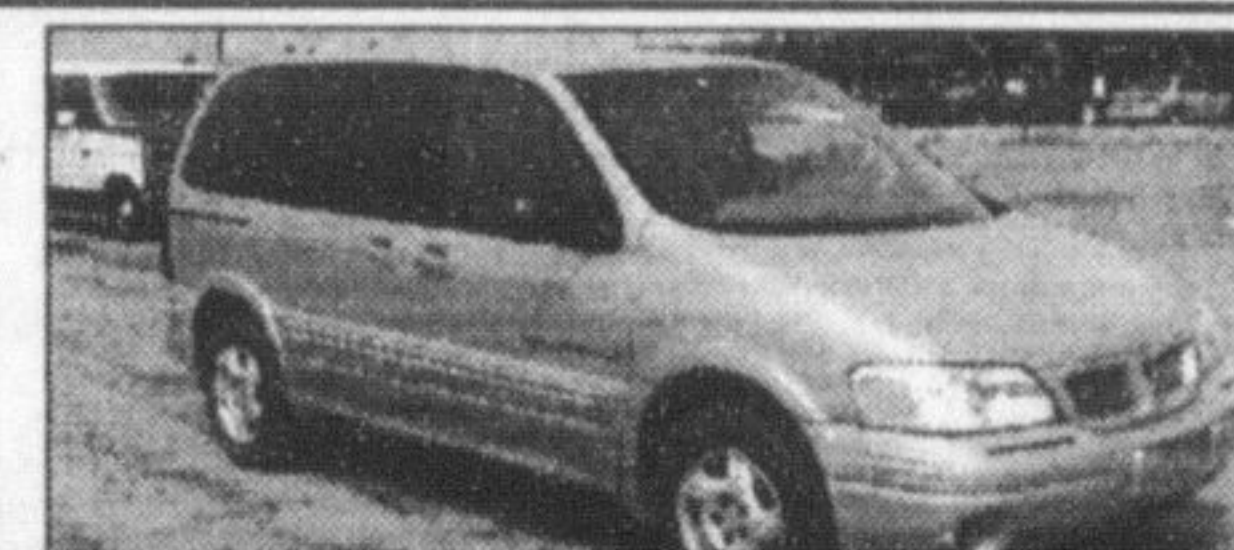
1999 FORD PORT TRANSPORT

V6, silver/grey inter., 3 dr, 6 pass, PS, PB, PL, PM, tilt, cruise, A/C, privacy tint, ABS. 47,000 km.