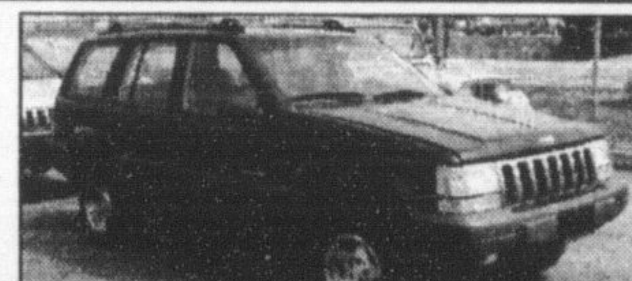
1997 GRAND CHEROKEE LARADO

V6, auto, select, trek, 4x4, 62,000 km, keyless entry, two-tone paint, climate control, alloy wheels, PW, PL, tilt, roof rack & more!