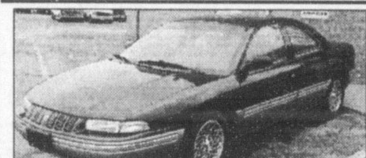
1994 CHRYSLER CONCORD

3.8L V6, dark green/grey cloth int, 85,000 km., PW, PL tilt, cruise, alloy wheels, new tires, keyless entry.