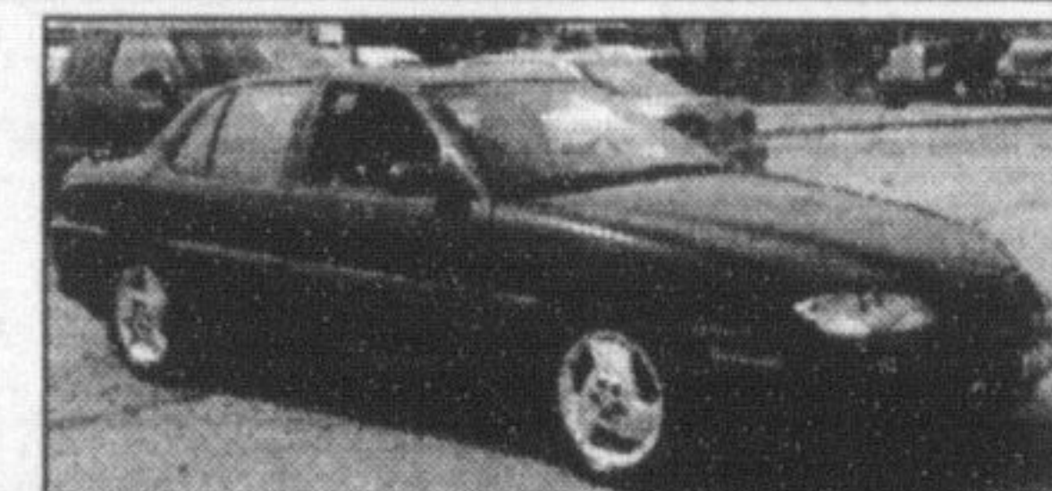
1996 PONTIAC GRAND AM GT

Come & see our great selection of pre-owned vehicles. All prices have been reduced!