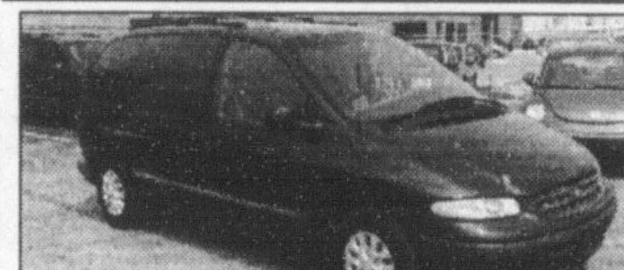
1999 PLYMOUTH VOYAGER

3.0L, V6, 3 dr, 7 pass. Features incl. PW, PL, tilt, cruise, ABS, A/C, privacy, tint, roof rack and more. 63,000 km.