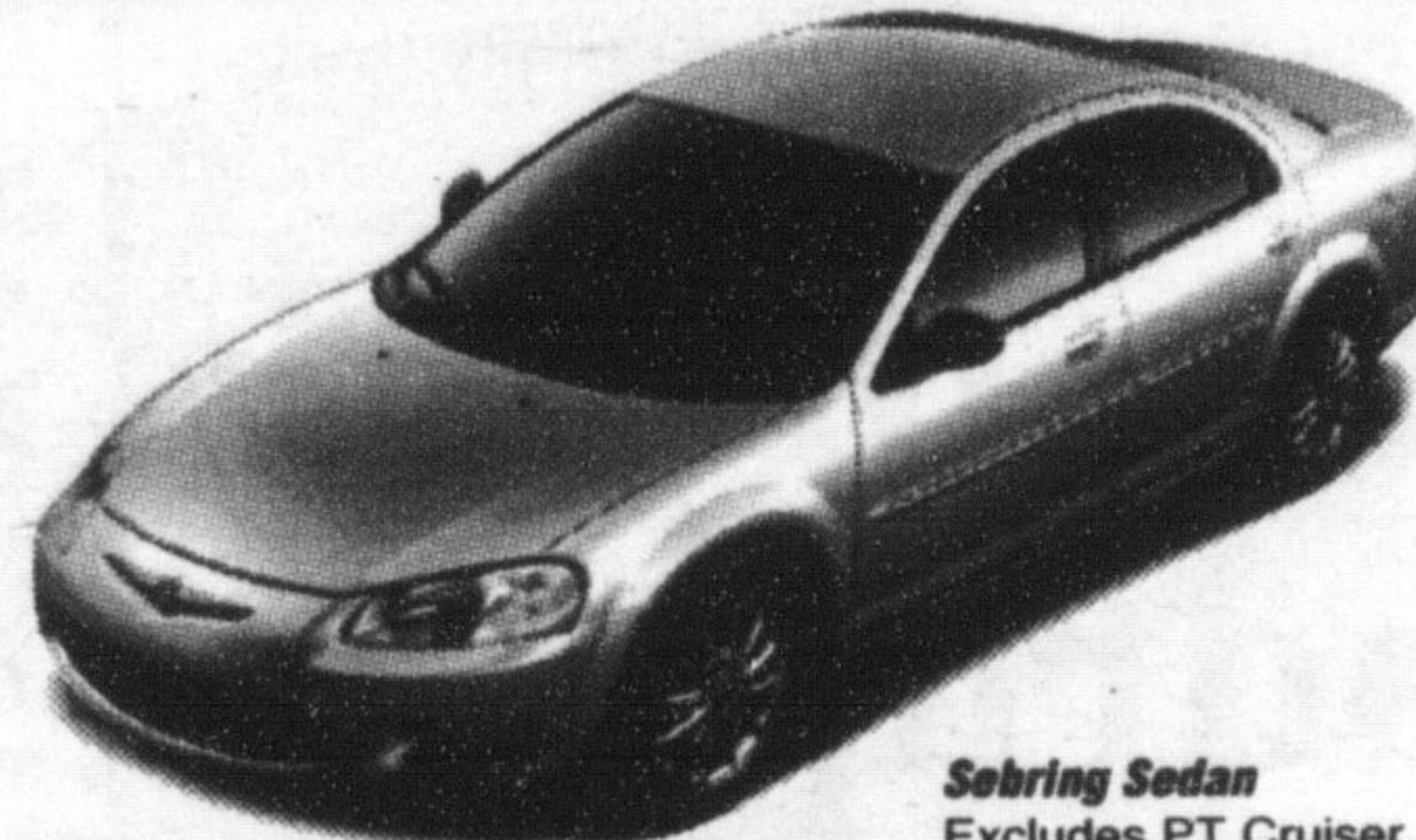
Sobring Sedan Excludes PT Cruiser