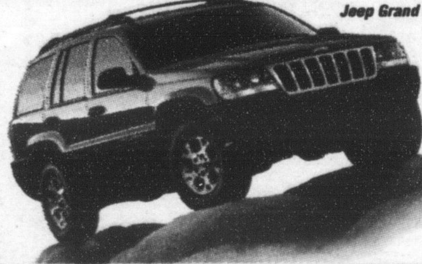
Jeep Grand Cherokee

Milton CHRYSLER • DODGE • JEEP "WE SELL SATISFACTION"